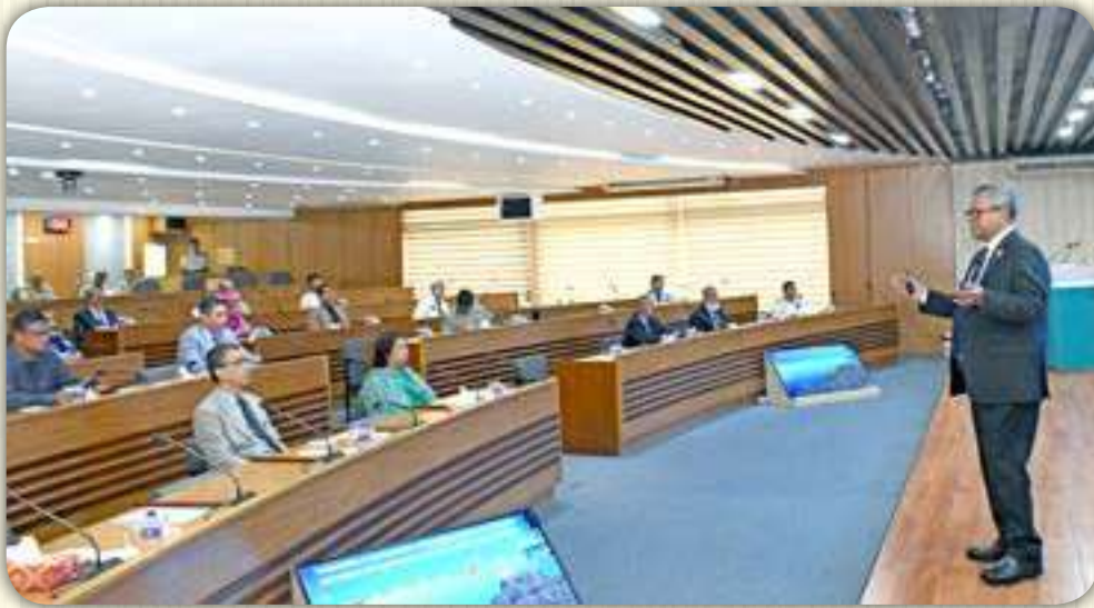
Rear Admiral Md Khurshed Alam , ndc, psc, BN (Retd) Secretary, Maritime Affairs Unit, Ministry of Foreign Affairs 'Managing a Sustainable and Equitable Blue Economy: Exploring Opportunities for Southeast Asian Regions'