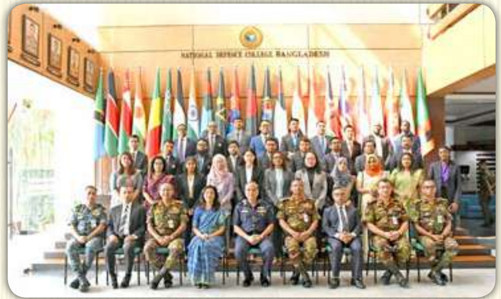
Delegation from Foreign Service Academy 07 November 2023