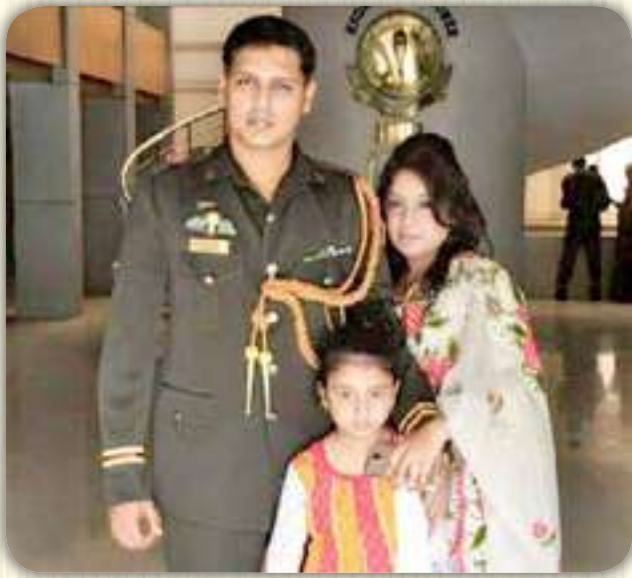
Lt Col Sami-Ud-Dowla Chowdhury Bangladesh Army