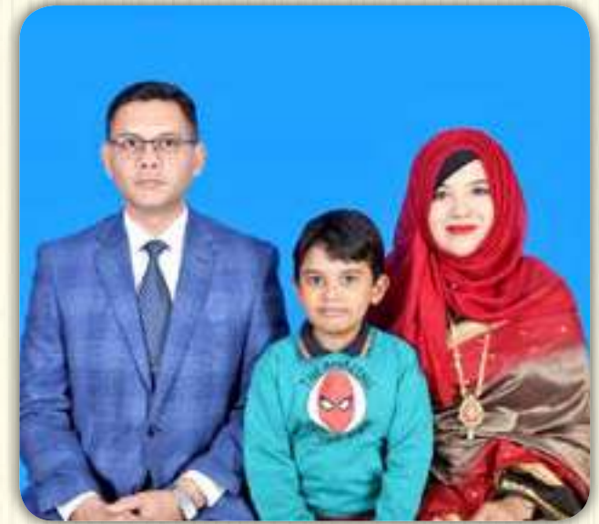
Lt Col Mohammad Asiful Haque Bangladesh Army