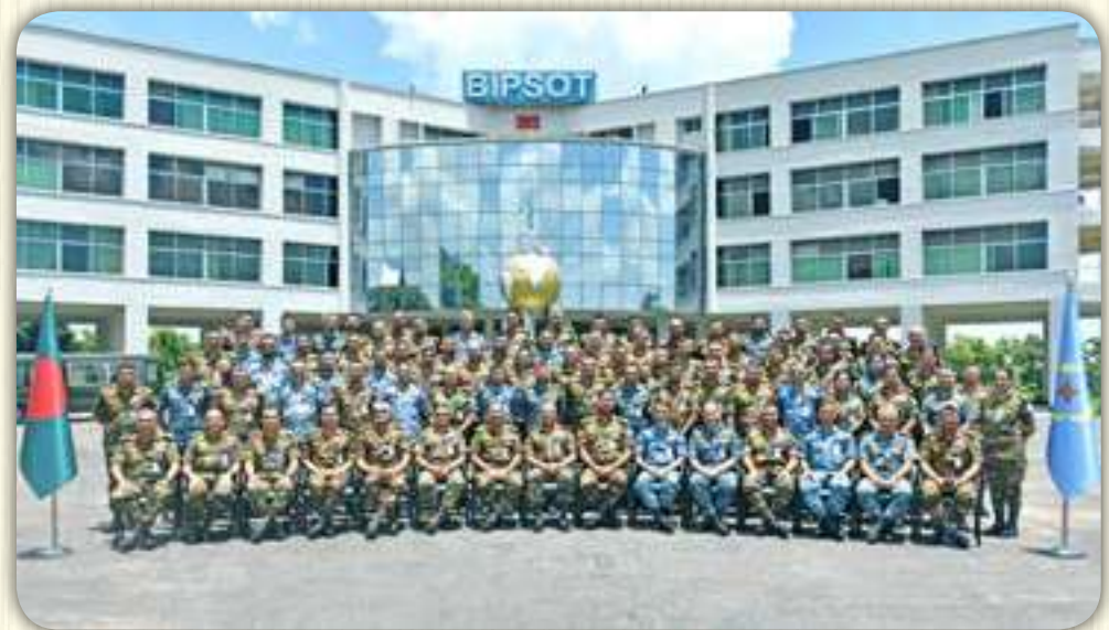
Bangladesh Institute of Peace Support Operation Training 30 July 2023