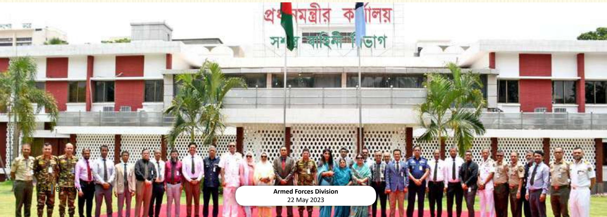
Armed Forces Division 22 May 2023