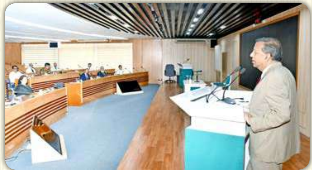
Mr. Anisul Huq, MP Hon'ble Minister, Ministry of Law, Justice and Parliamentary Affairs 'Constitution of Bangladesh'