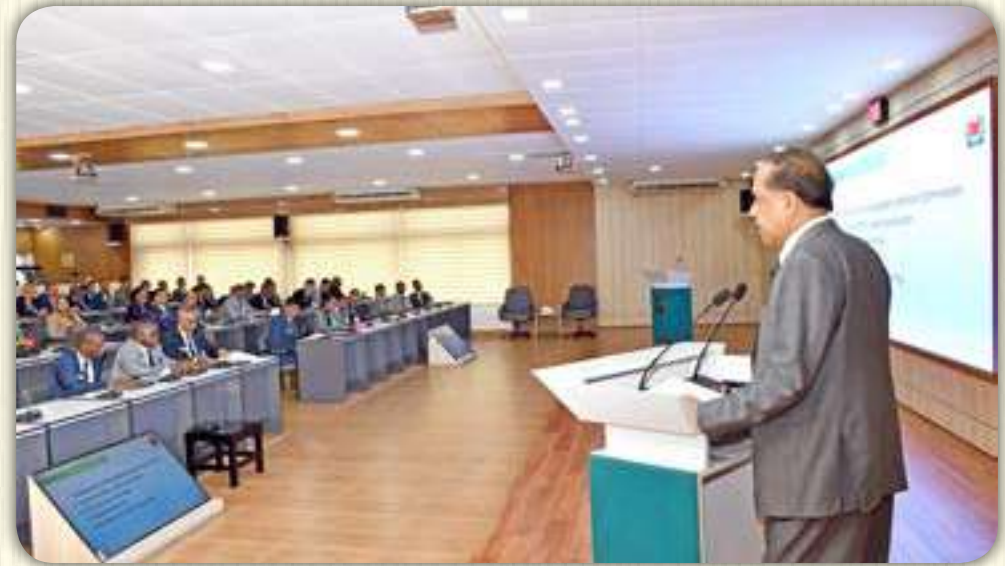
Mr. Kazi Habibur Awal Chief Election Commissioner of Bangladesh 'The Electoral System of Bangladesh'