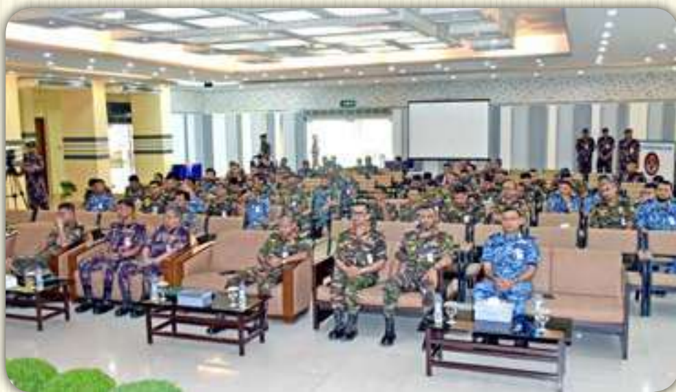
Headquarters Border Guard Bangladesh 04 July 2023