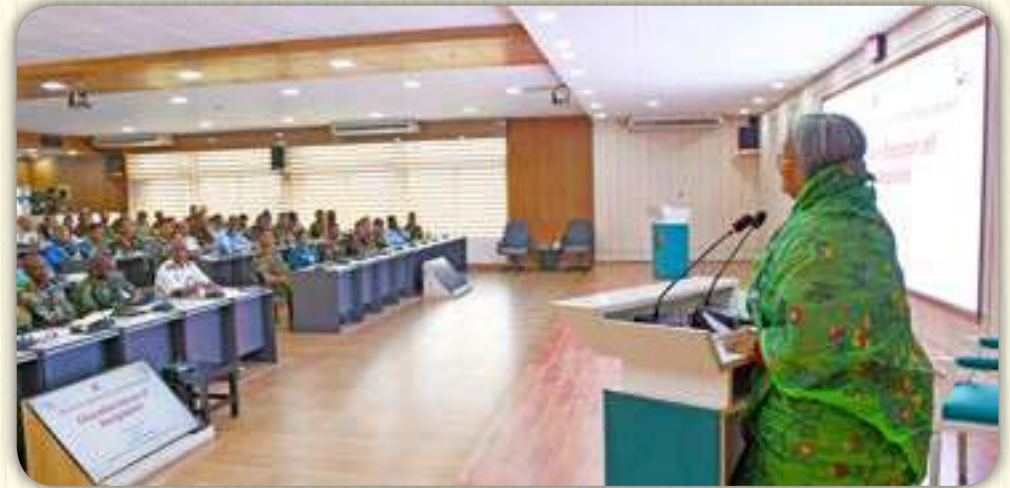
Dr. Dipu Moni, MP Hon'ble Minister, Ministry of Education 'Education System of Bangladesh'