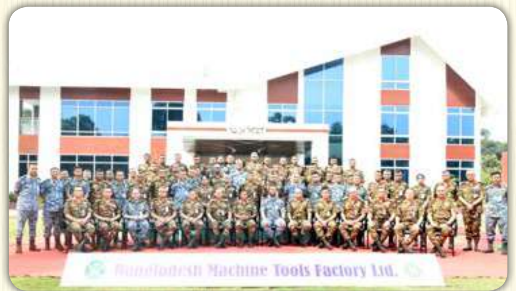
Bangladesh Machine Tools Factory 10 September 2023