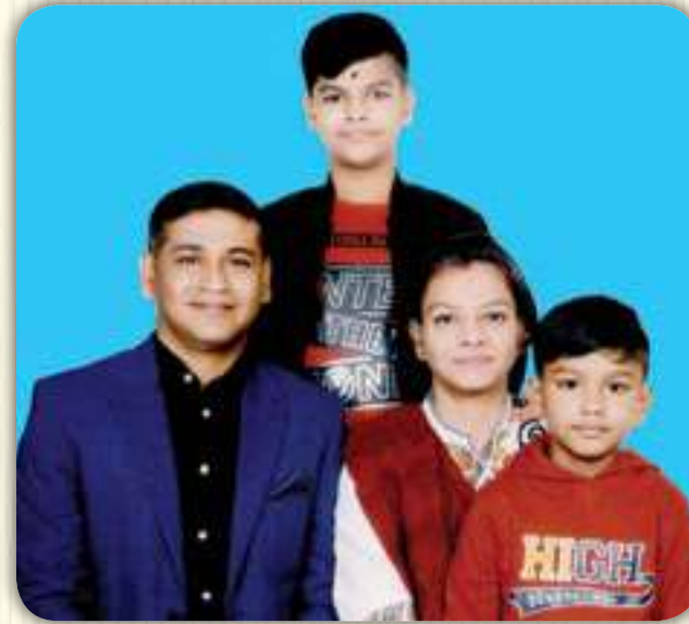
Lt Col Shupta Sharmin Khan Bangladesh Army