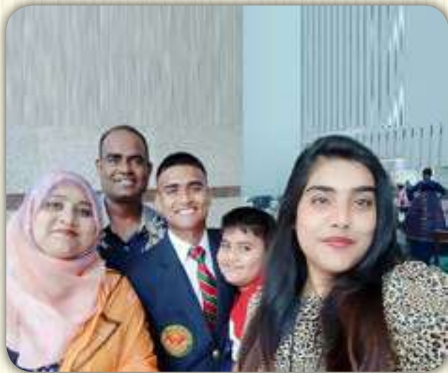
Brig Gen Humayun Quayum Bangladesh Army