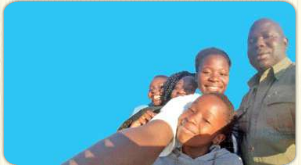
Col D Kapisha Zambia Army