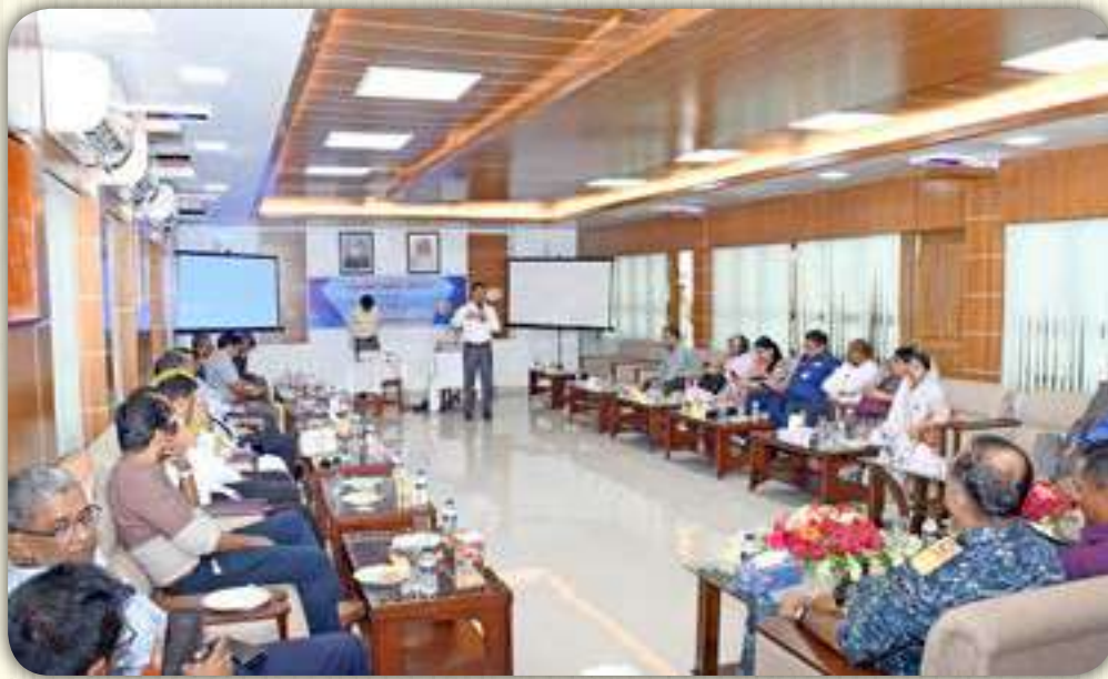
Cox's Bazar District Administration 17 May 2023