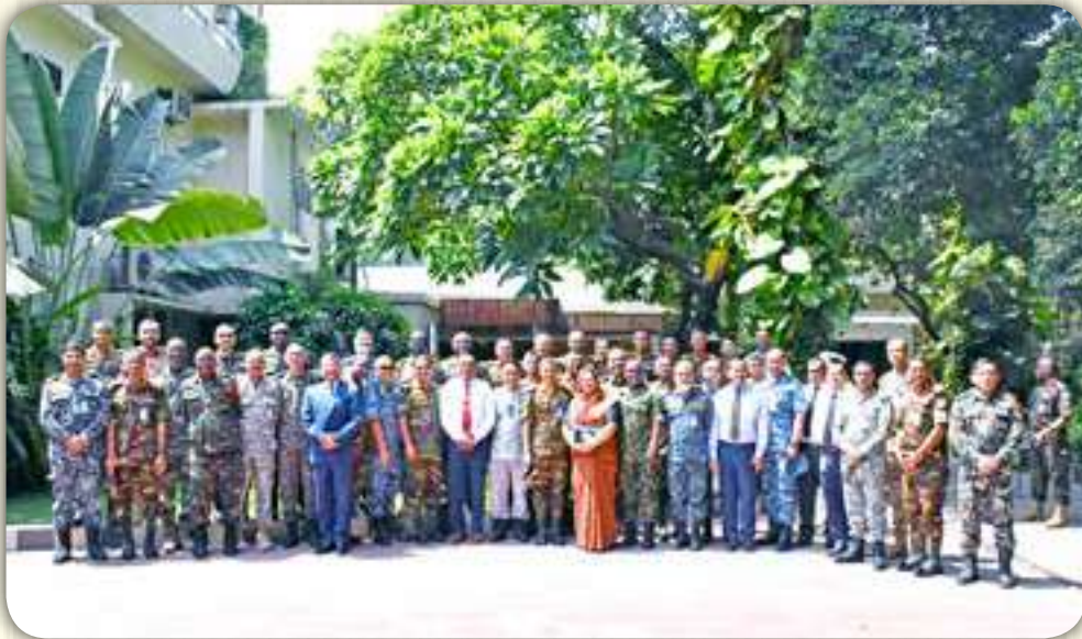
Bangladesh Institute of International and Strategic Studies 25 July 2023