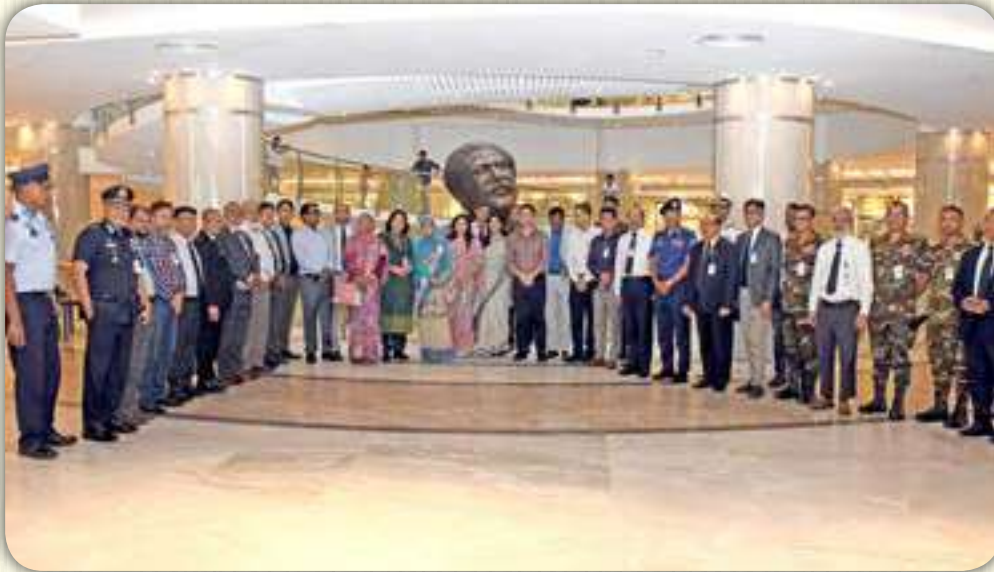
Bangabandhu Military Museum 05 September 2023