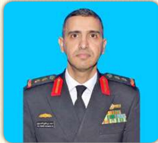
Capt Ahmad Faea Alasiri Royal Saudi Navy