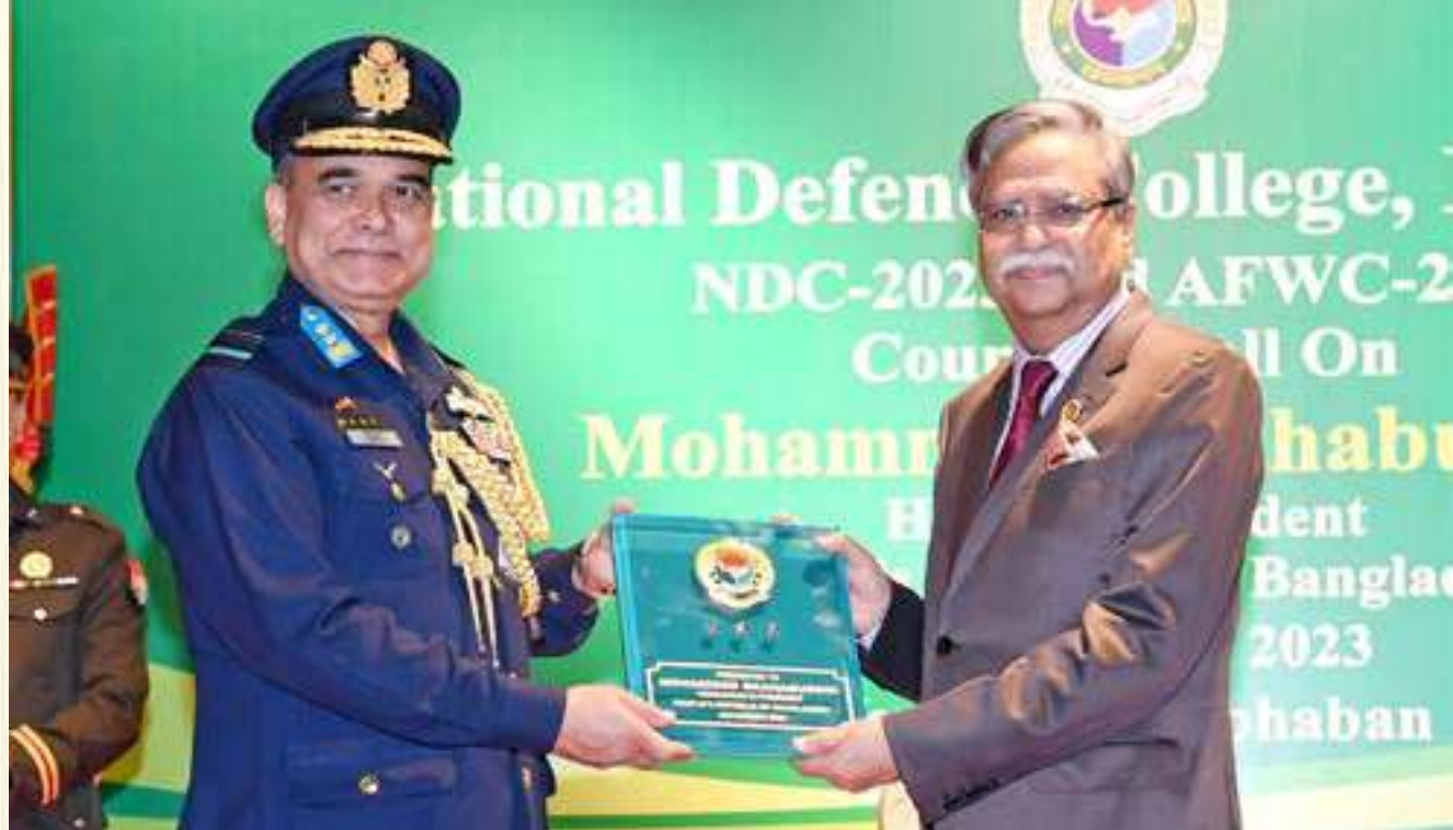
Visit to Bangabhaban on 22 November 2023