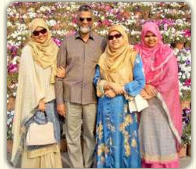
Air Cdre Muhammad Mushtaqur Rahman Bangladesh Air Force