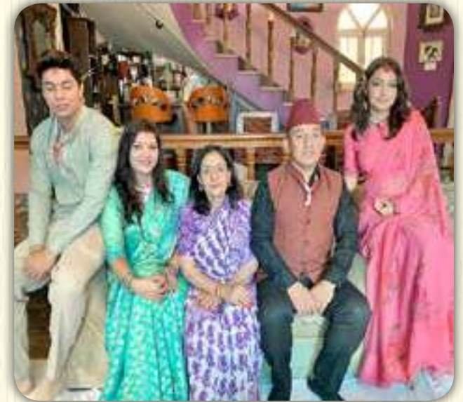
Col Subash Jung Thapa Royal Nepalese Army