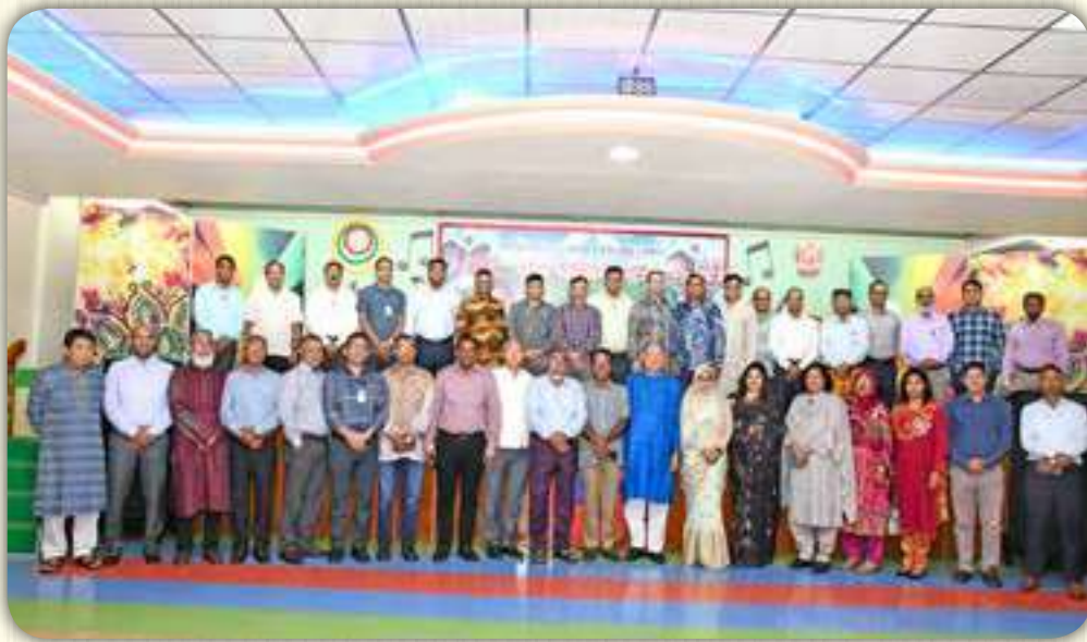
Headquarters 305 Infantry Brigade 12 September 2023