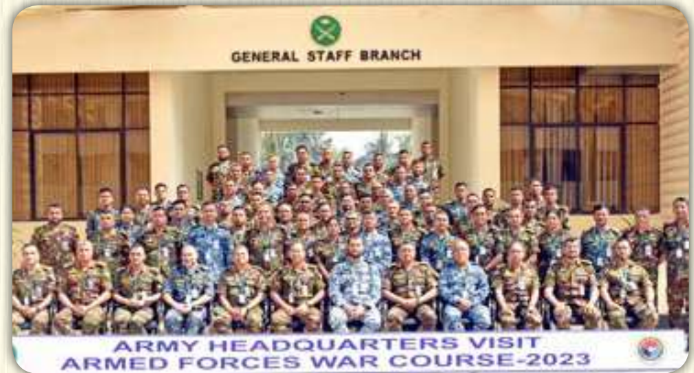
Army Headquarters 01 March 2023