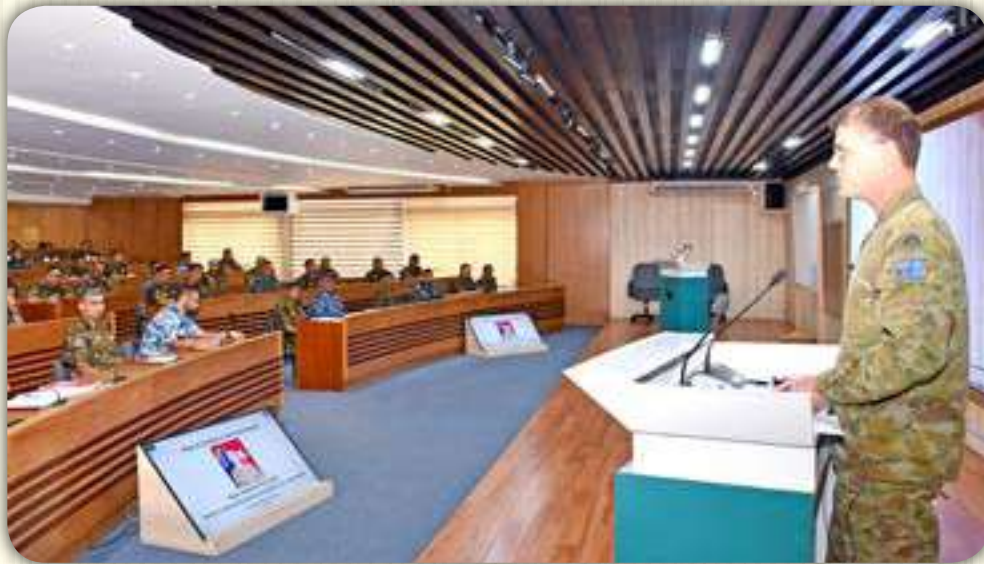
Major General Chirs Smith Deputy Commanding General (Australia) for U.S. Army Pacific 'Role of U.S Army in the Indo-Pacific'