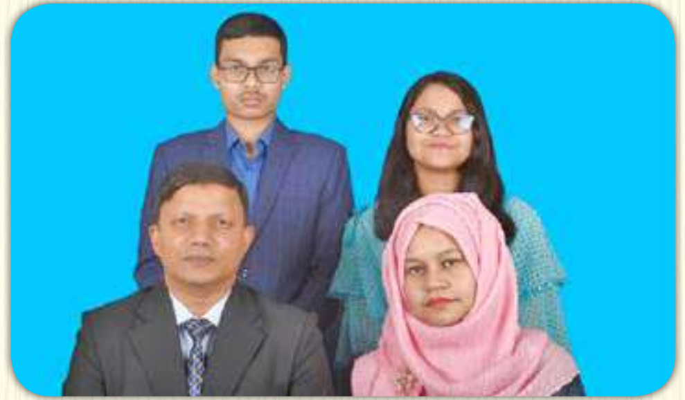
Gp Capt Md Enamul Huda Bangladesh Air Force