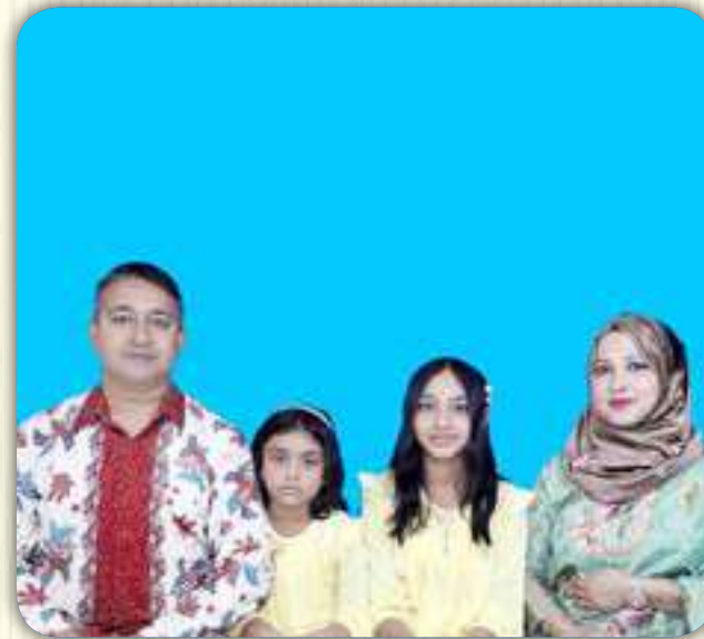
Capt Sayed Mohammad Noor-E-Alam Bangladesh Navy