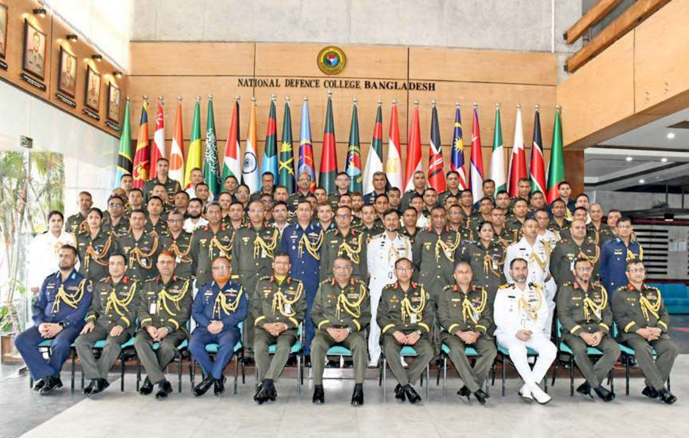
Armed Forces War Course 2023 on 29 January 2023