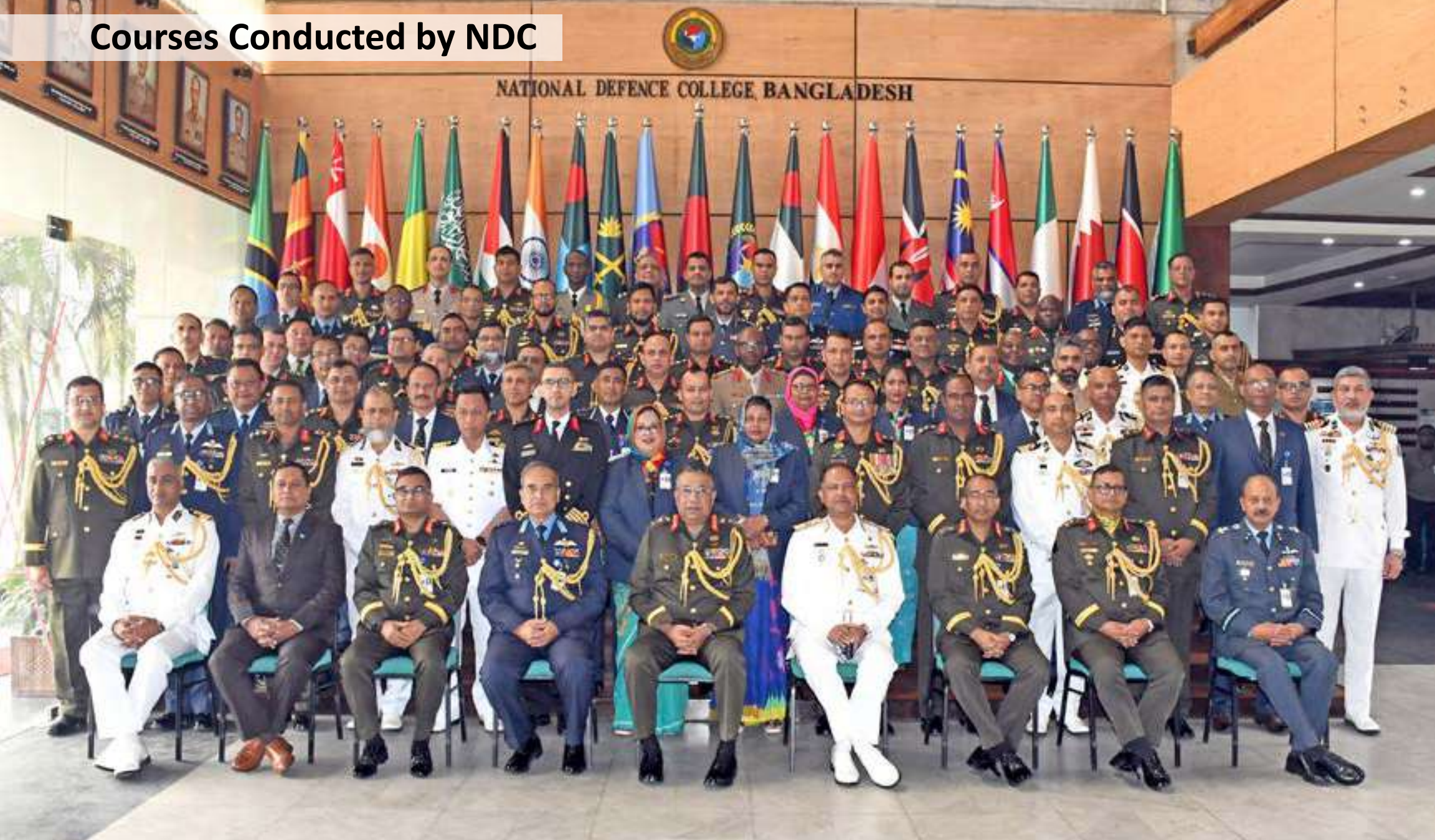
National Defence Course 2023 on 15 January 2023