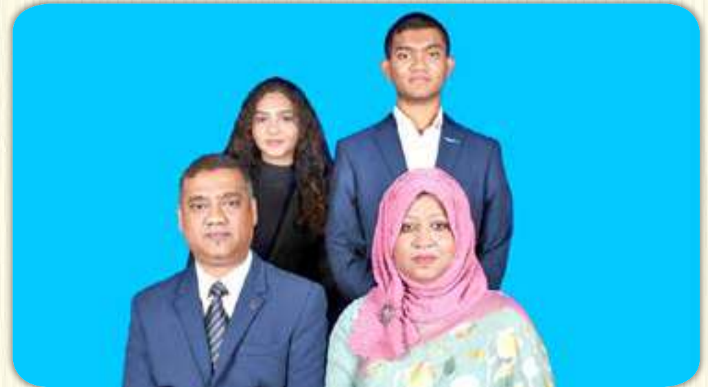
Wg Cdr Md Mesbah-Ul-Sattar Bangladesh Air Force