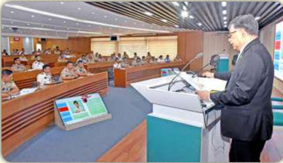
Mr. Masud Bin Momen Senior Secretary, Ministry of Foreign Affairs 'Foreign Policy of Bangladesh'