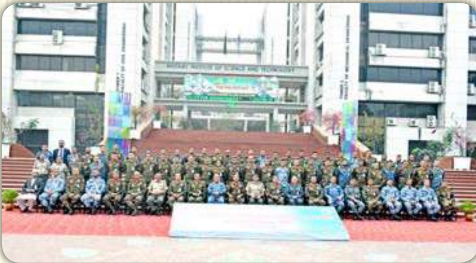
Military Institute of Science and Technology 16 February 2023