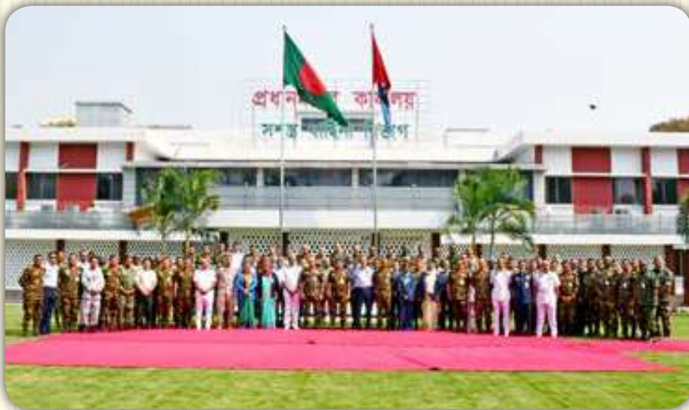
Armed Forces Division 01 March 2023