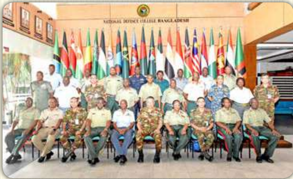
Delegation from Zimbabwe 15 June 2023