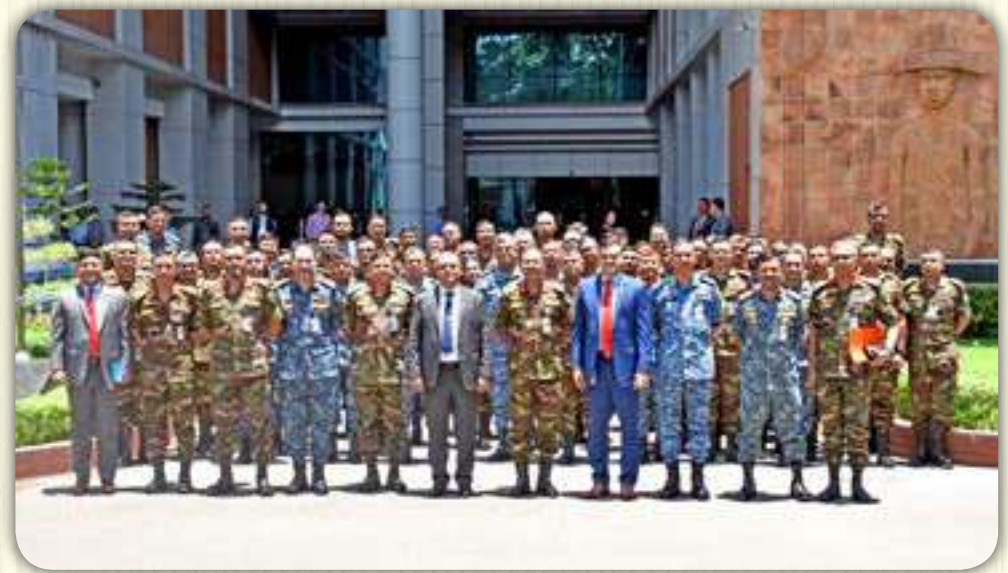
National Security Intelligence 04 July 2023