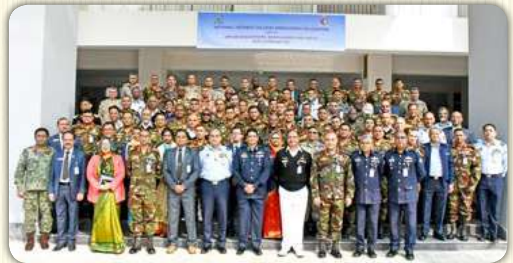
Air Headquarters 06 February 2023