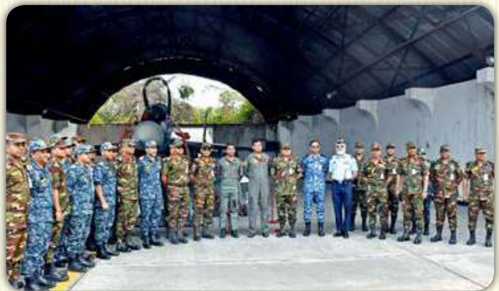
BAF Base Bangabandhu 14 March 2023