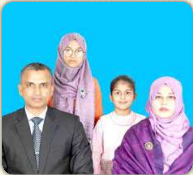
Lt Col Syed Farhan Ebne Hafiz Bangladesh Army