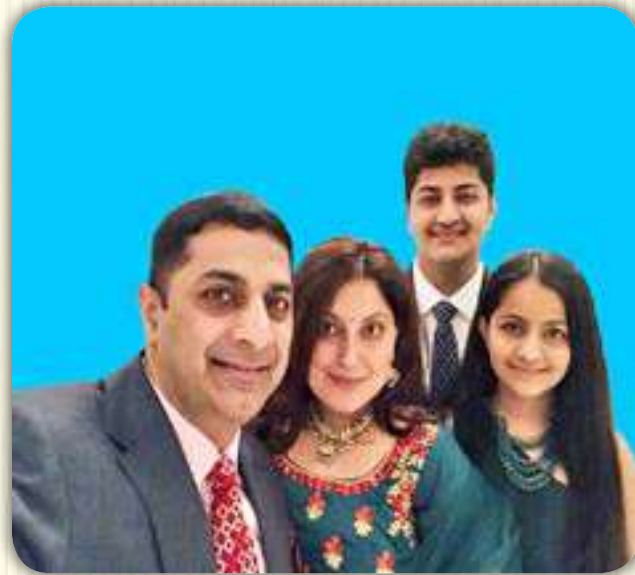
Cmde Saurabh Thakur Indian Navy