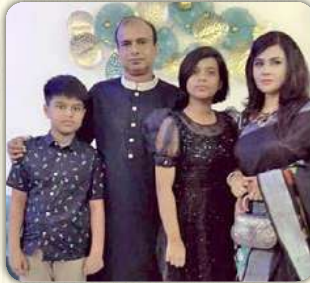
Brig Gen Raisul Islam Bangladesh Army