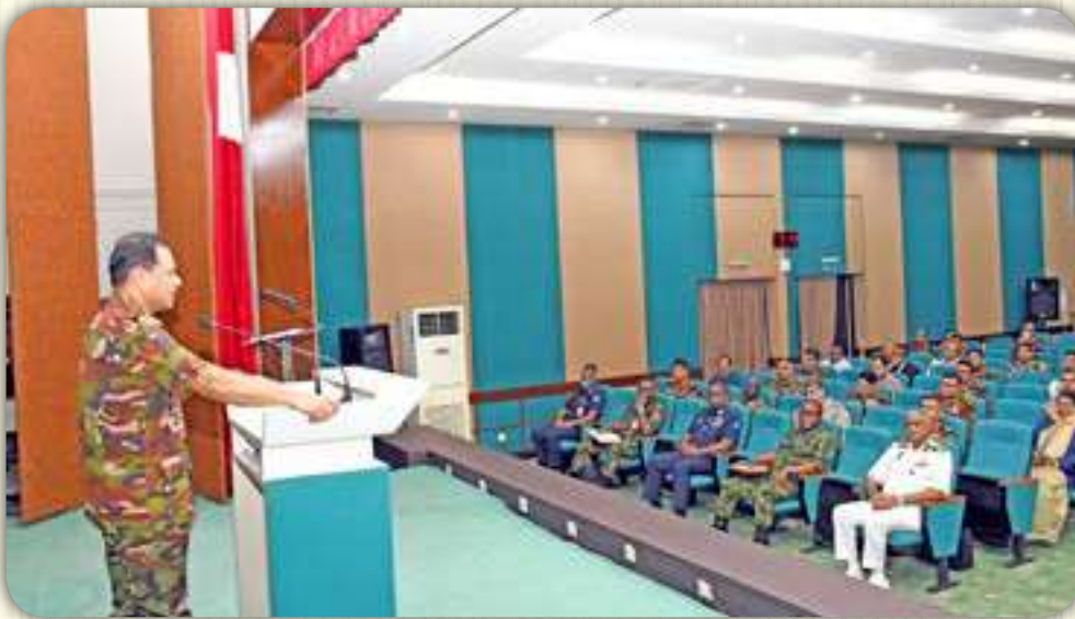
General S M Shafiuddin Ahmed, SBP (BAR), OSP, ndu, psc, PhD Chief of Army Staff, Bangladesh Army 'Keynote Speech on Bangladesh Army'