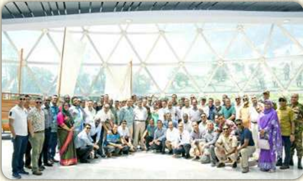
Bangabandhu Military Museum 08 July 2023