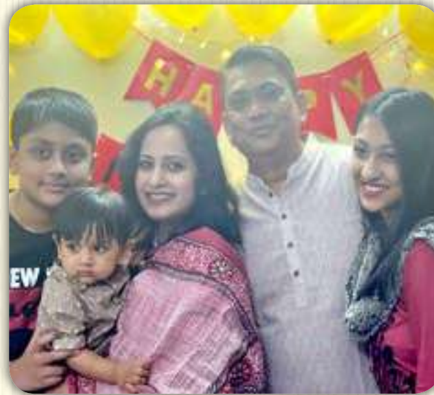
Air Cdre Abu Sayeed Mehboob Khan Bangladesh Air Force