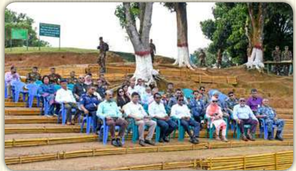
CIO Camp, Kaptai 12 September 2023