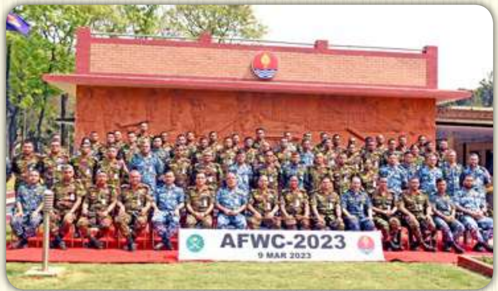
Headquarters 14 Independent Engineering Brigade 09 March 2023