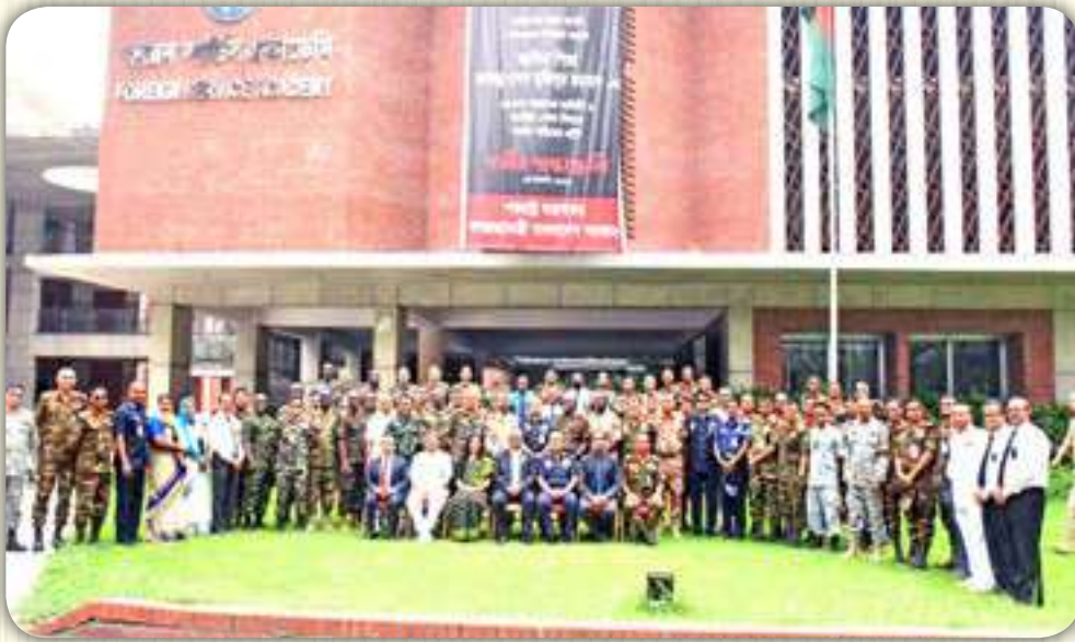
Foreign Service Academy 22 August 2023