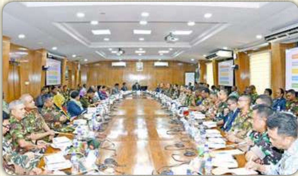
Cabinet Division 06 March 2023