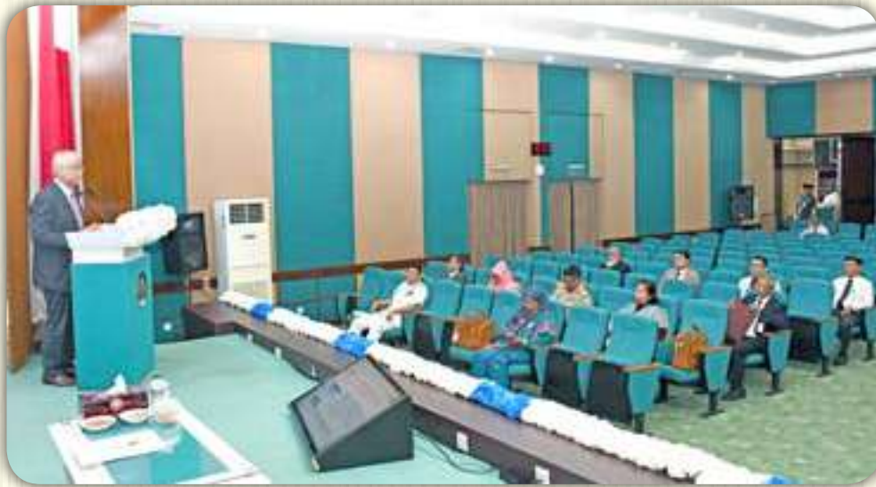
Dr. Shamsul Alam Hon'ble State Minister, Ministry of Planning 'Smart Bangladesh and Bangladesh Delta Plan 2100'