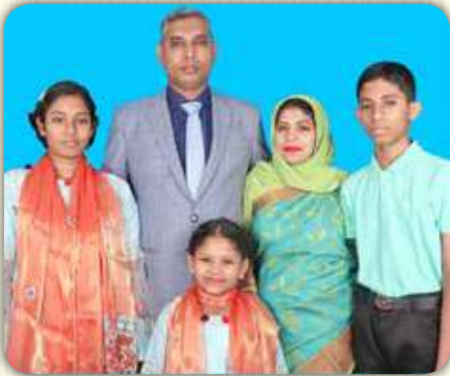
Lt Col Hasan Masud Bangladesh Army