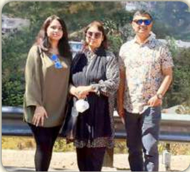
Brig Gen Kazi Mustafizur Rahman Bangladesh Army