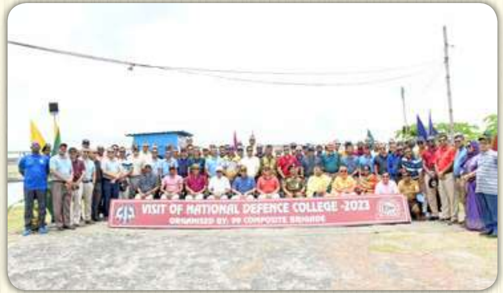
99 Composite Brigade 13 July 2023