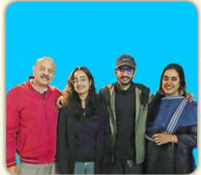
Air Cmde PVS Narayana Indian Air Force