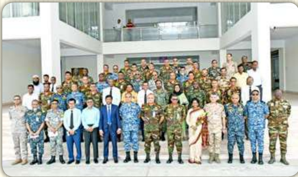
Bangladesh Rice Research Institute 30 May 2023