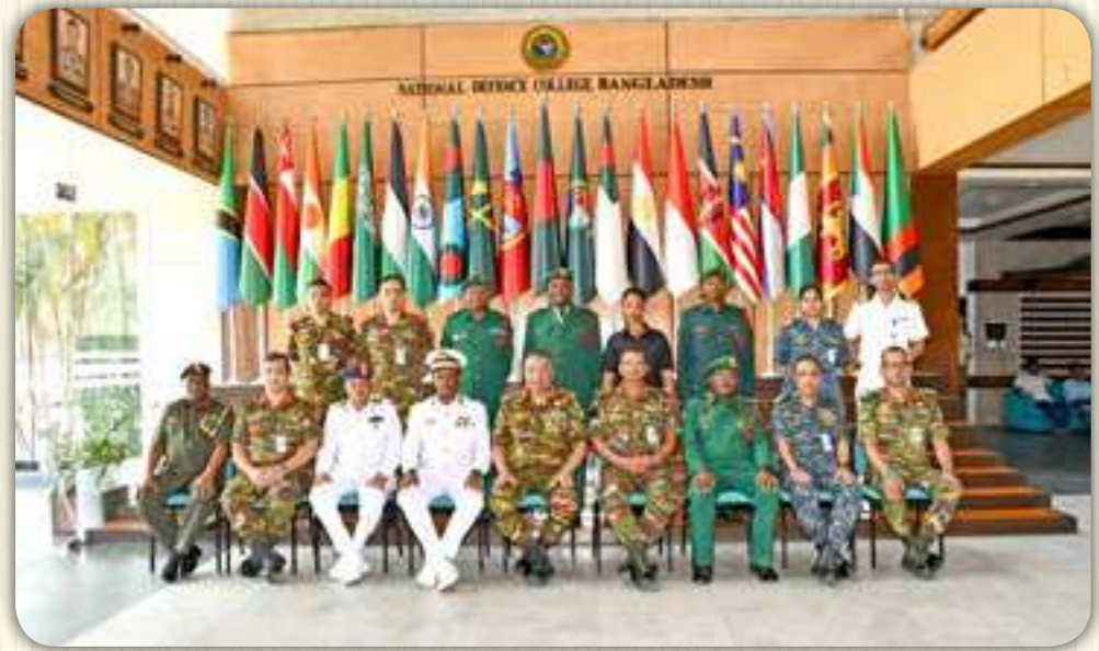
Delegation from Tanzania People's Defence Force 08 May 2023