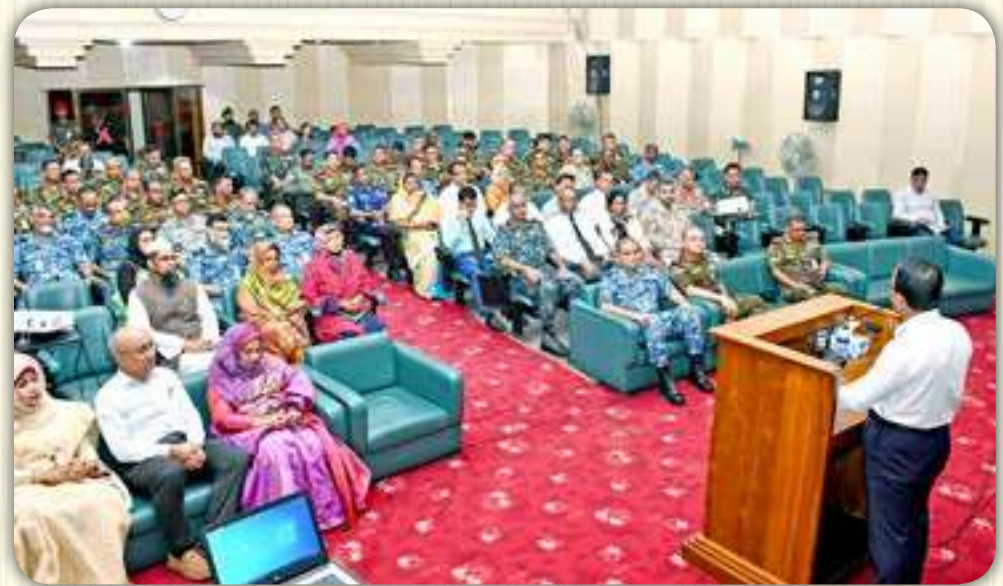
Bangladesh Agricultural Research Institute 30 May 2023