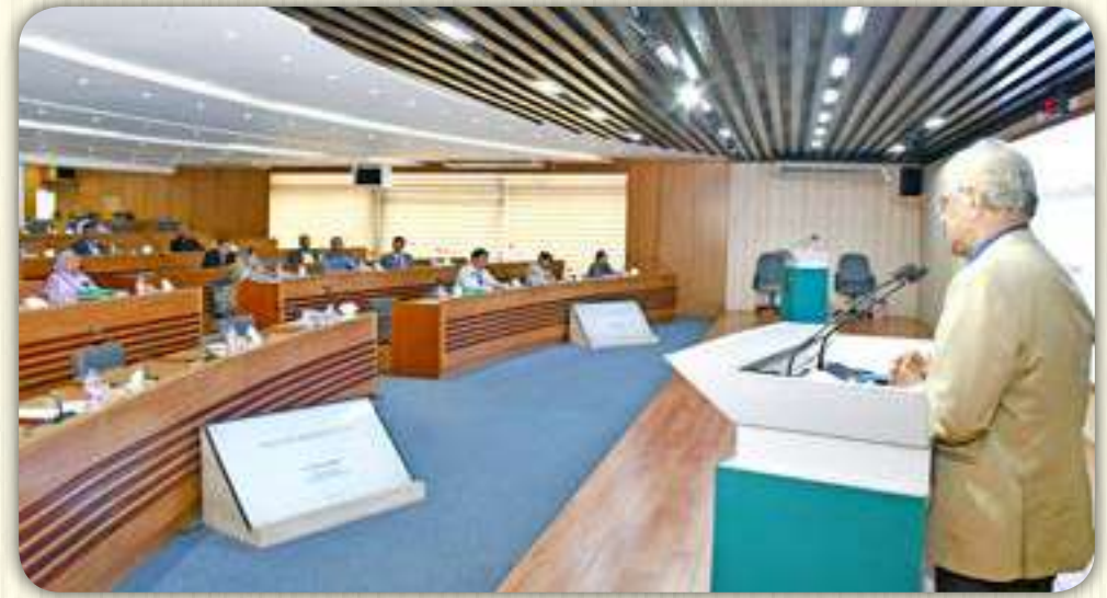
Dr. Shamsul Alam Hon'ble State Minister, Ministry of Planning 'Vision 2041 and Bangladesh Delta Plan 2100'