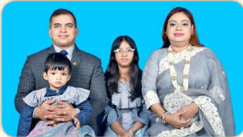
Gp Capt Mehedi Hasan Bangladesh Air Force