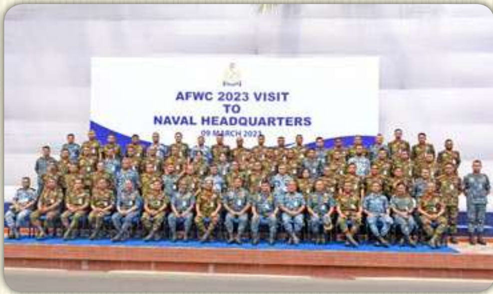
Naval Headquarters 09 March 2023