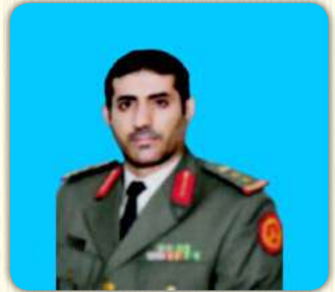
Staff Col Badr Hamed F Alangari Royal Saudi Air Force