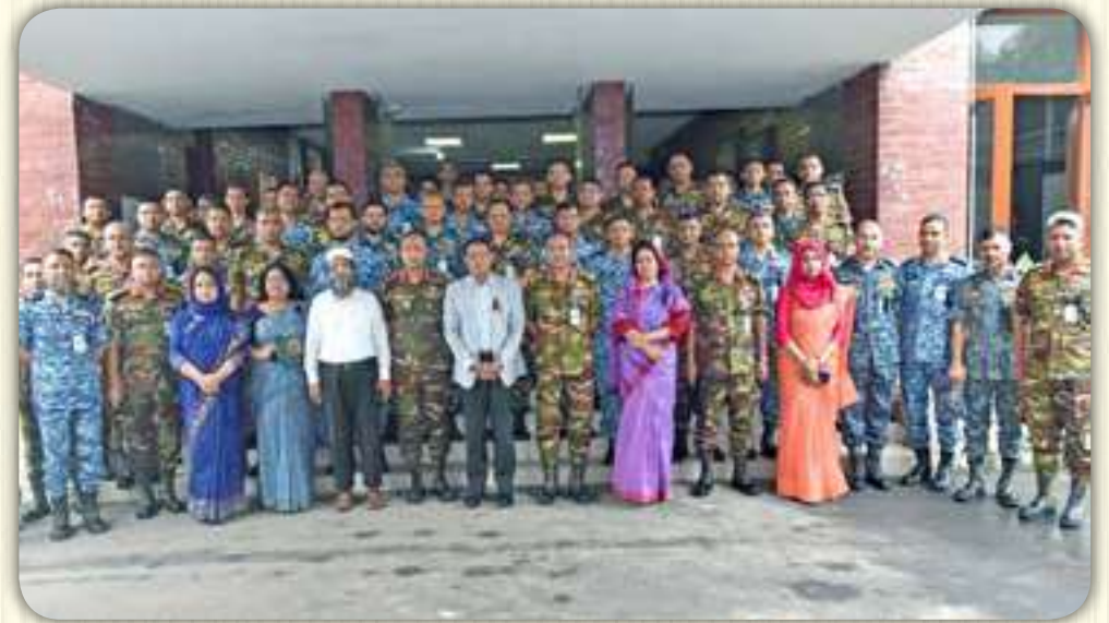
Ministry of Defence 06 August 2023