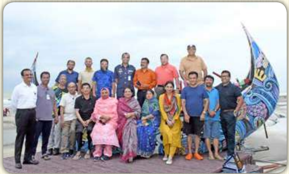
BAF Shaheen Beach 17 May 2023