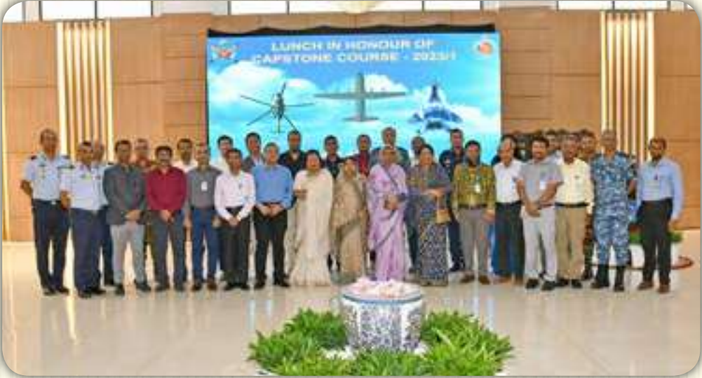
BAF Base Bangabandhu 10 May 2023