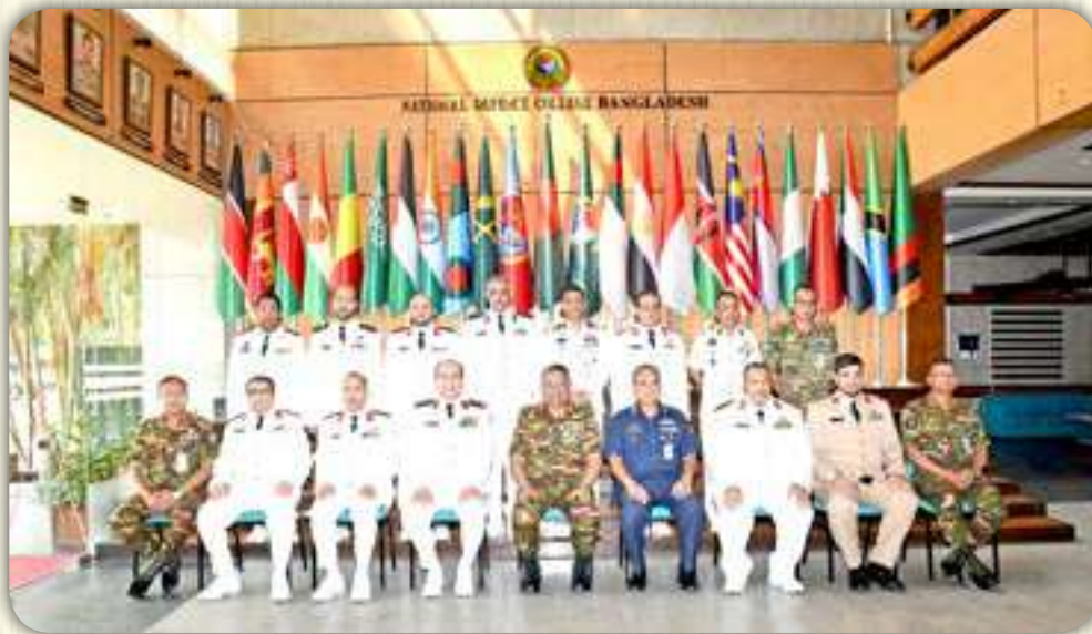
Delegation from KSA 07 March 2023