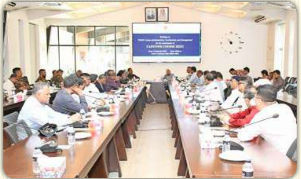
Office of the Refugee Relief and Repatriation Commissioner 13 September 2023