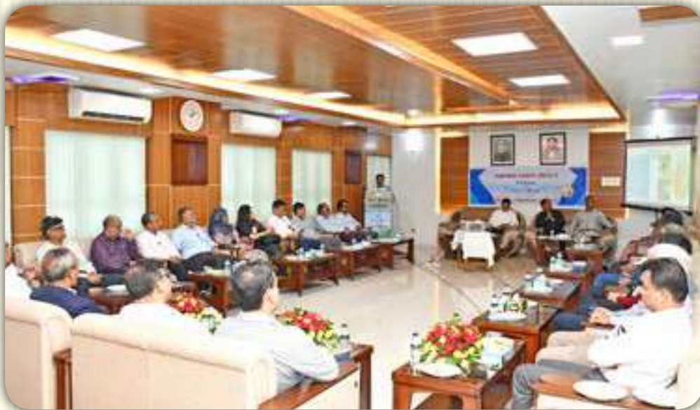
Office of the Deputy Commissioner, Cox's Bazar 13 September 2023