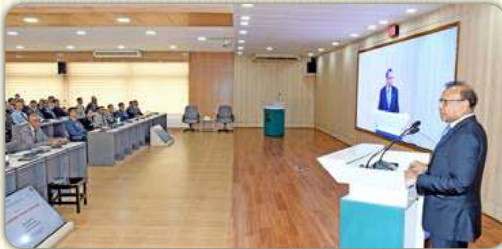
Md. Tazul Islam, MP Hon'ble Minister, Local Government Division 'Local Government System of Bangladesh'