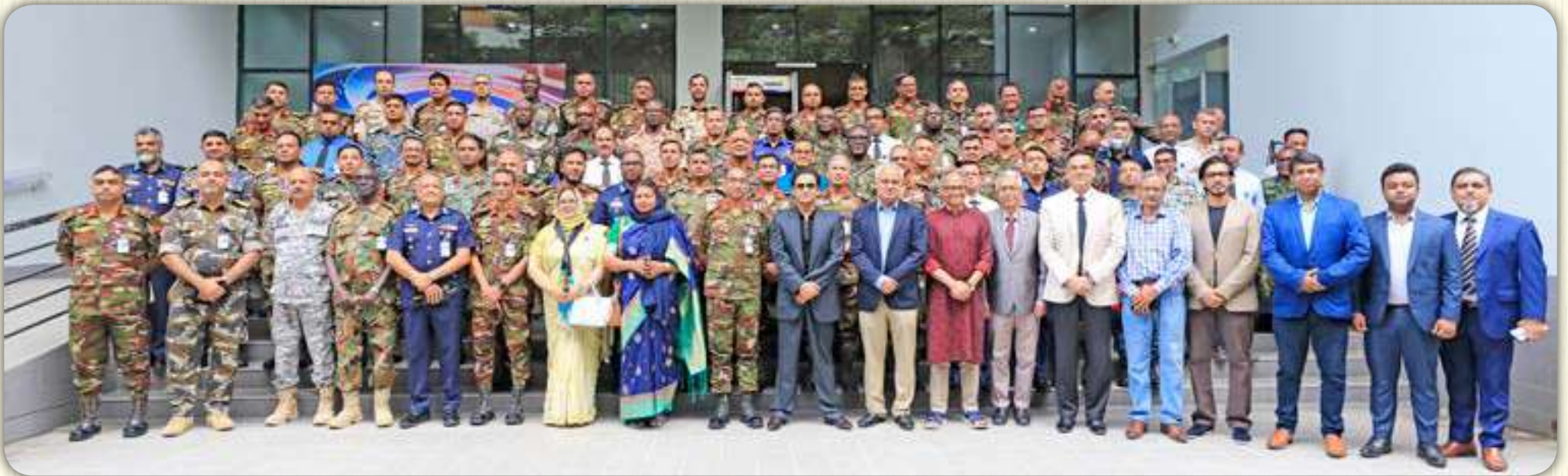
East West Media Group 18 October 2023