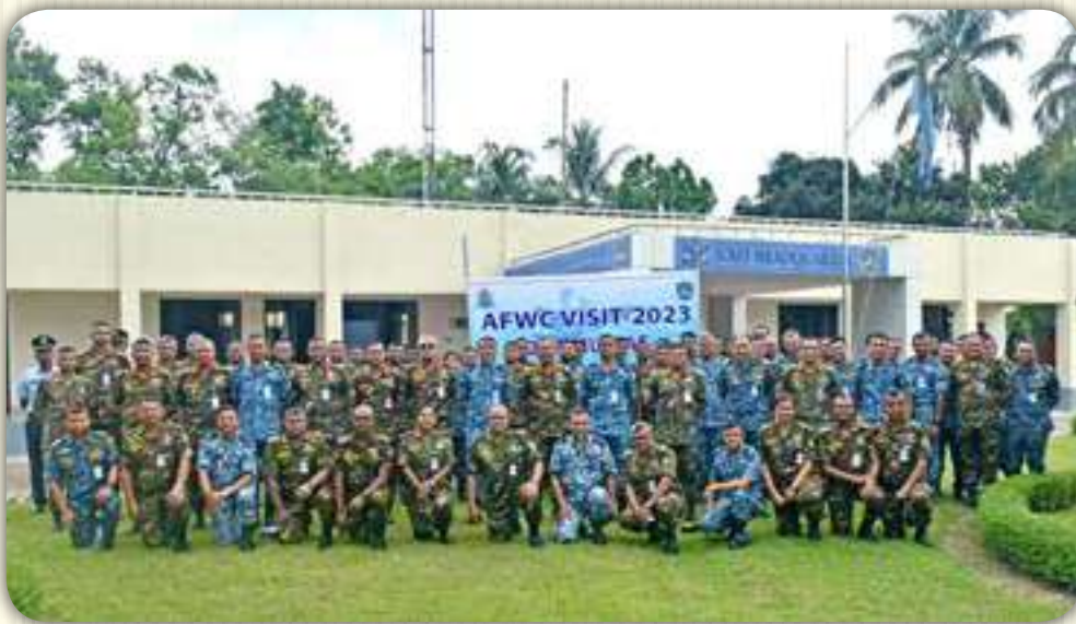
203 Maintenance Unit, BAF 30 July 2023