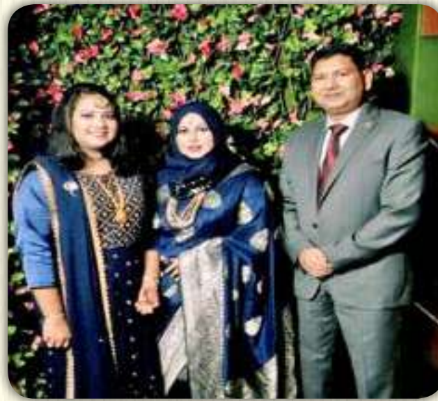
Cdr Mahbuba Afroze Bangladesh Navy