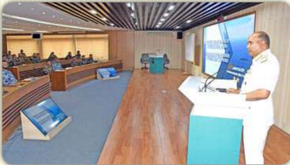
Rear Admiral S. M. Moniruzzaman, OSP, ndc, ncc, psc Commander, BN Fleet, Chattogram

'Protection of Sea Lines of Communication by International Laws - Relevance of Blockade in Present Day Context'