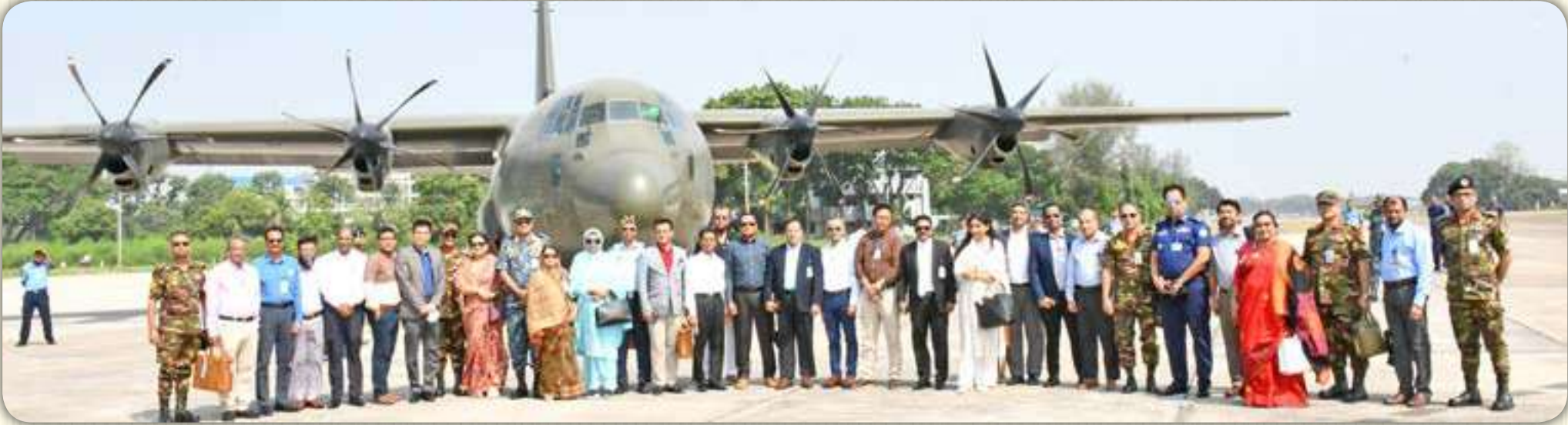
BAF Base Bangabandhu 16 May 2023