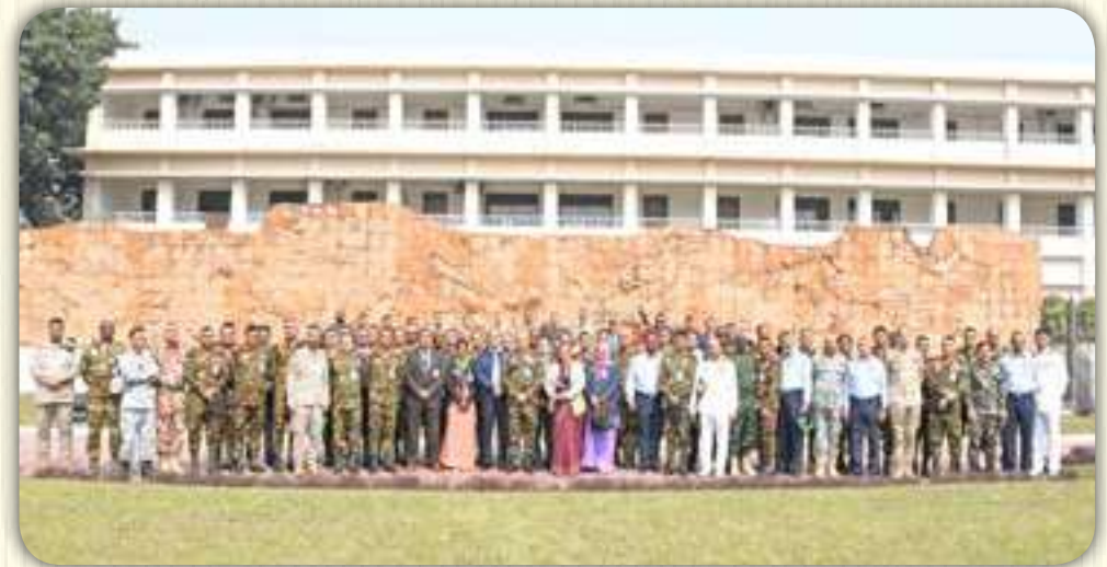
Bijoyketon 05 February 2023