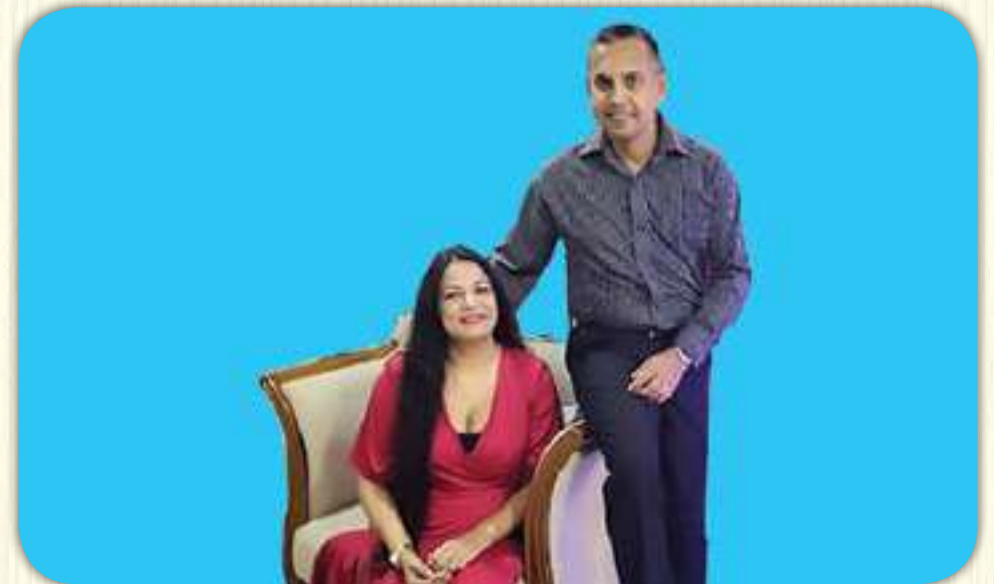
Air Cdre AV Jayasekera Sri Lankan Air Force