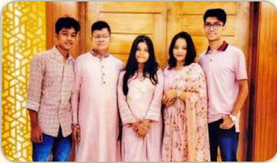
Gp Capt Md Asadul Islam Biswas Bangladesh Air Force