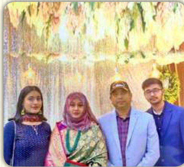
Cdre M Tariqul Islam Bangladesh Navy