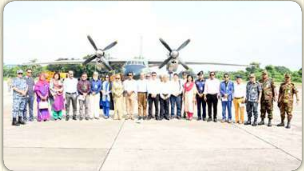
BAF Base Bangabandhu 10 September 2023