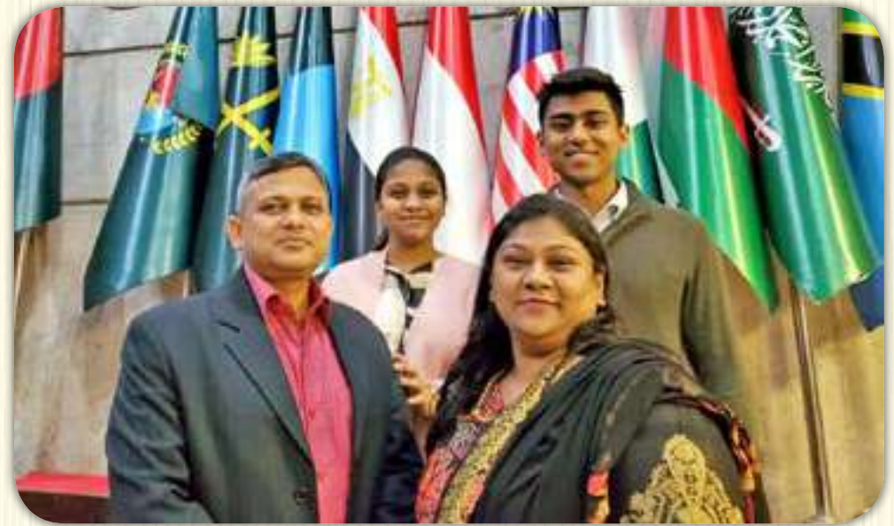
R Adm Golam Sadeq SDS (Navy) (Outgoing)