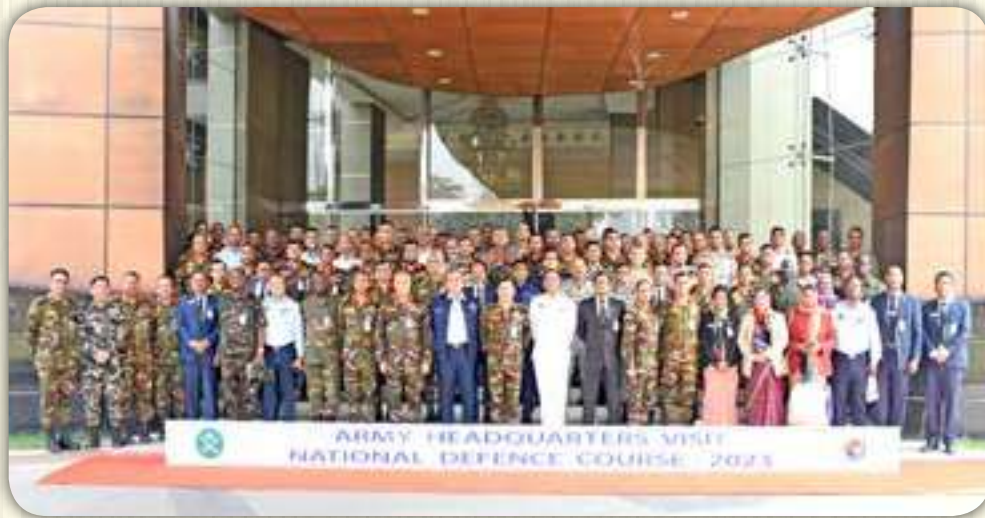
Army Headquarters 05 February 2023