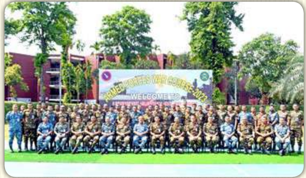
Headquarters 6 Independent Air Defence Artillery Brigade 17 May 2023