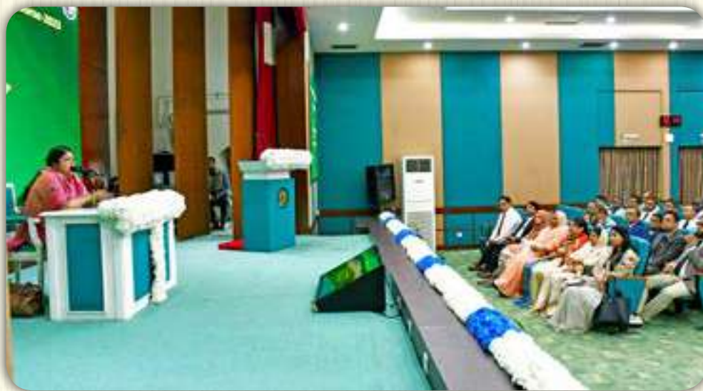
Dr. Shirin Sharmin Chaudhury, MP Hon'ble Speaker, Bangladesh National Parliament 'Constitution of Bangladesh'