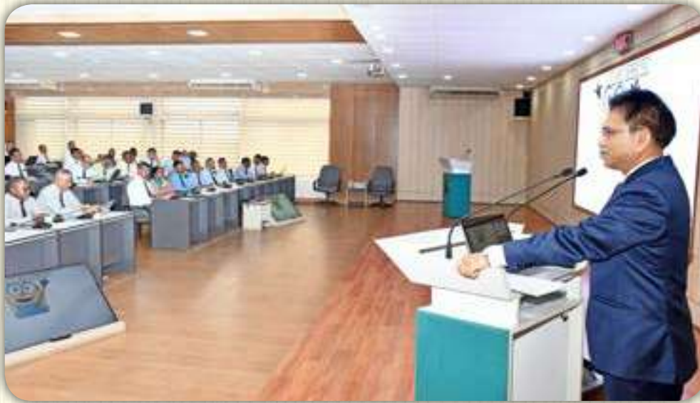
Major General A K M Abdullahil Baquee, rcds, ndu, psc (retd) 'Elements of National Power'