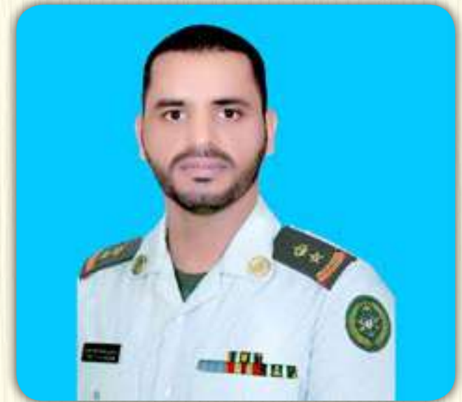
Staff Col Turki Salem Alarjani Royal Saudi Air Force