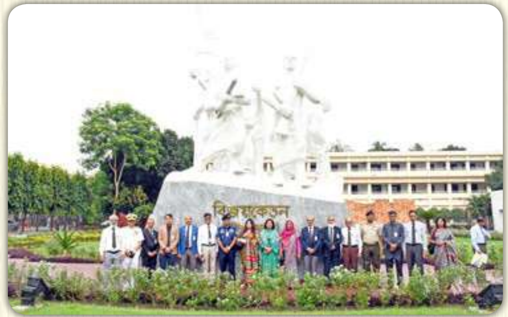
Bijoyketon 18 September 2023