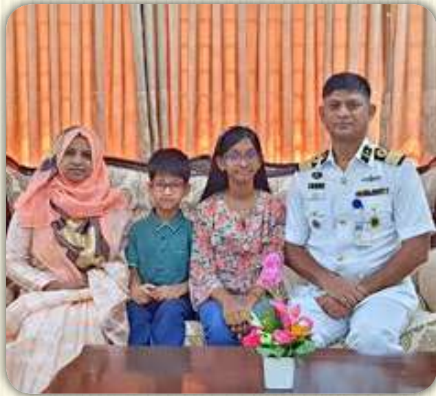
Cdre M Monir Uddin Mollick Bangladesh Navy