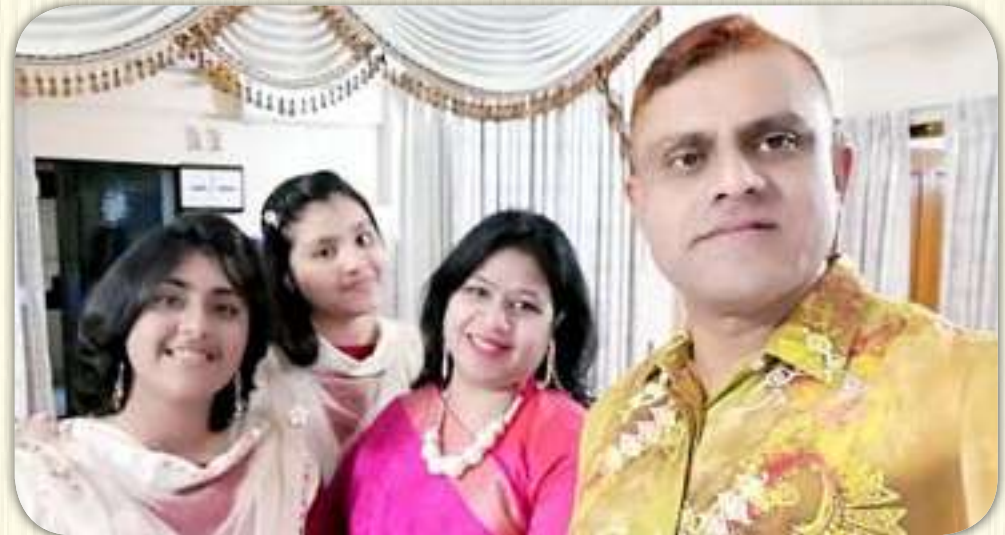
Brig Gen A K M Sazedul Islam DS (Army)