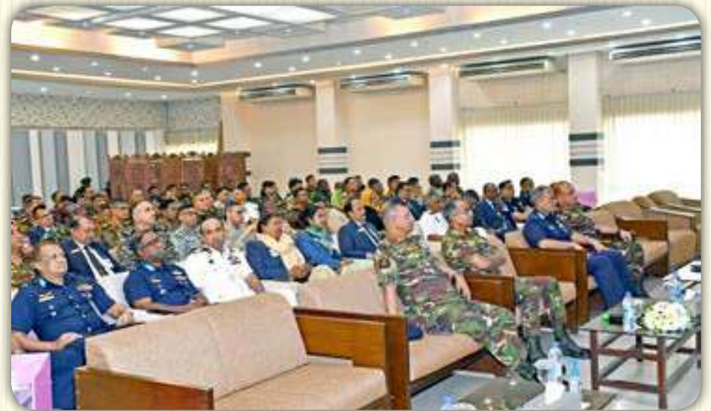
Headquarters Border Guard Bangladesh 05 March 2023