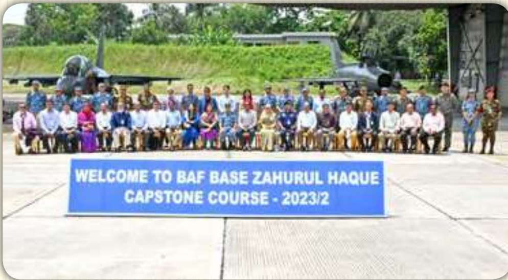
BAF Base Zahurul Haque, Chattogram 10 September 2023