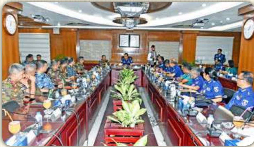
Police Headquarters 02 July 2023