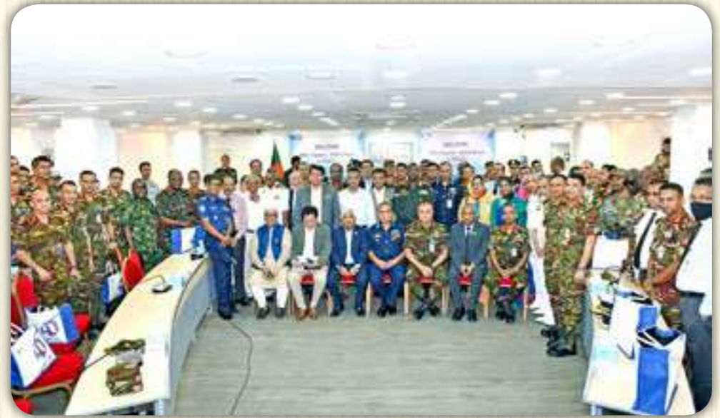
Federation of Bangladesh Chambers of Commerce and Industry 17 April 2023