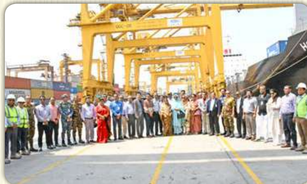
Chittagong Port Authority 16 May 2023