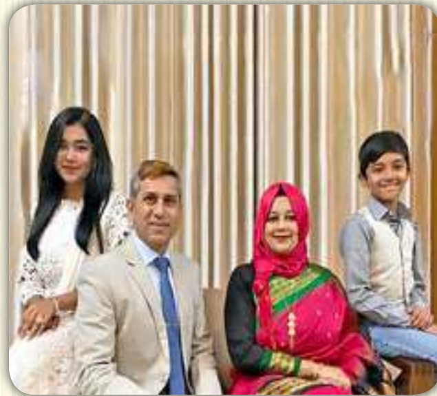
Brig Gen Tanvir Islam Khan Chowdhury Bangladesh Army