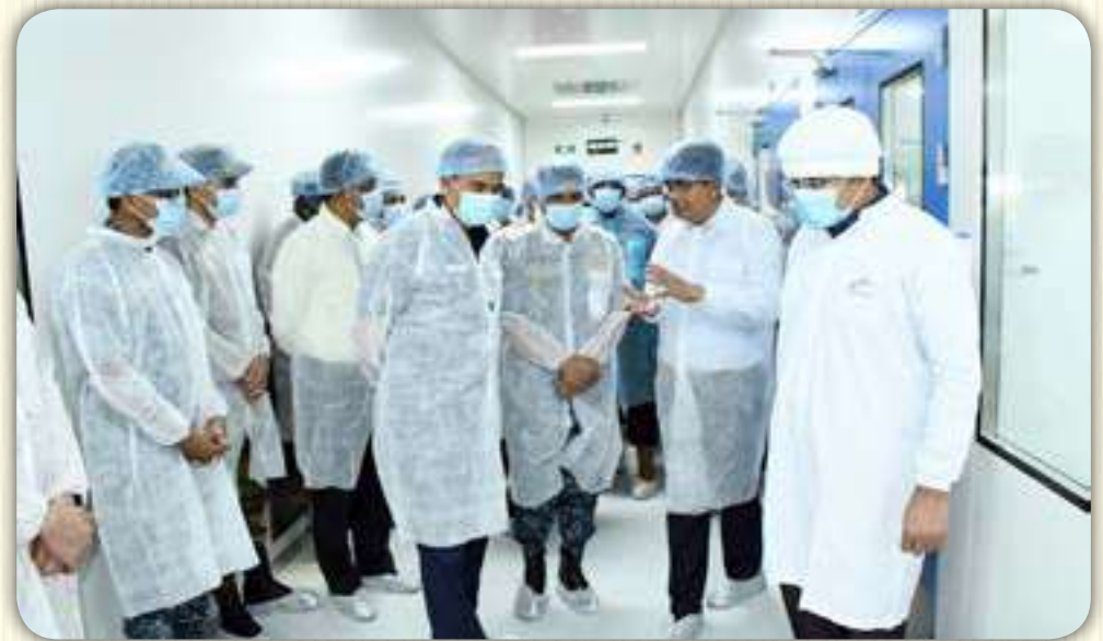
Incepta Pharmaceuticals Limited 11 May 2023