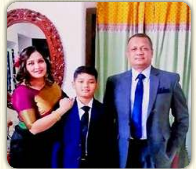
Air Cdre Md Moinul Hasnain Bangladesh Air Force