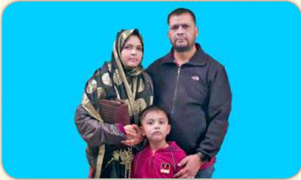
Gp Capt Shaikh Abdullah Alamgir Bangladesh Air Force