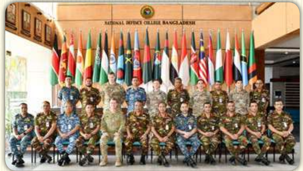
Delegation from U.S Army Pacific 13 March 2023