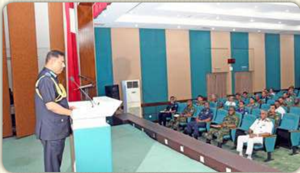
Air Chief Marshal Shaikh Abdul Hannan , BBP, BUP, nswc, fawc, psc, GD(P) Chief of Air Staff, Bangladesh Air Force 'Keynote Speech on Bangladesh Air Force'