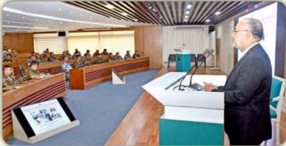
Dr. Md. Enamur Rahman, MP Hon'ble State Minister, Ministry of Disaster Management and Relief 'Bangladesh's Experience in Disaster Management: Success, Intricacies and Lessons for the Armed Forces'