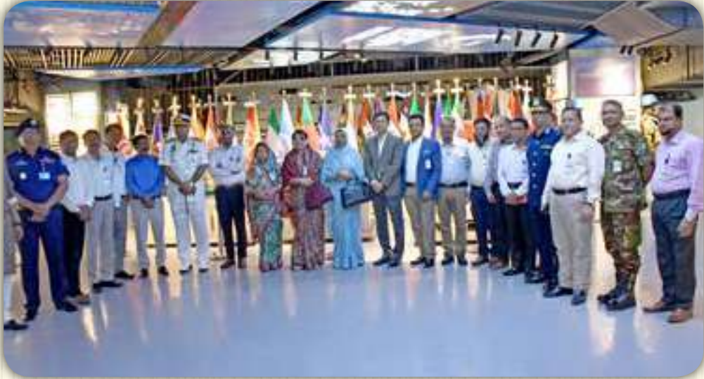
Bangabandhu Military Museum 15 May 2023