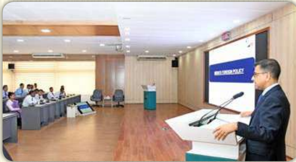
H. E. Mr. Pranay Verma High Commissioner of the Republic of India to Bangladesh 'Contemporary India: its Foreign Policy, Security and Development Strategy and Bangladesh-India Relations'