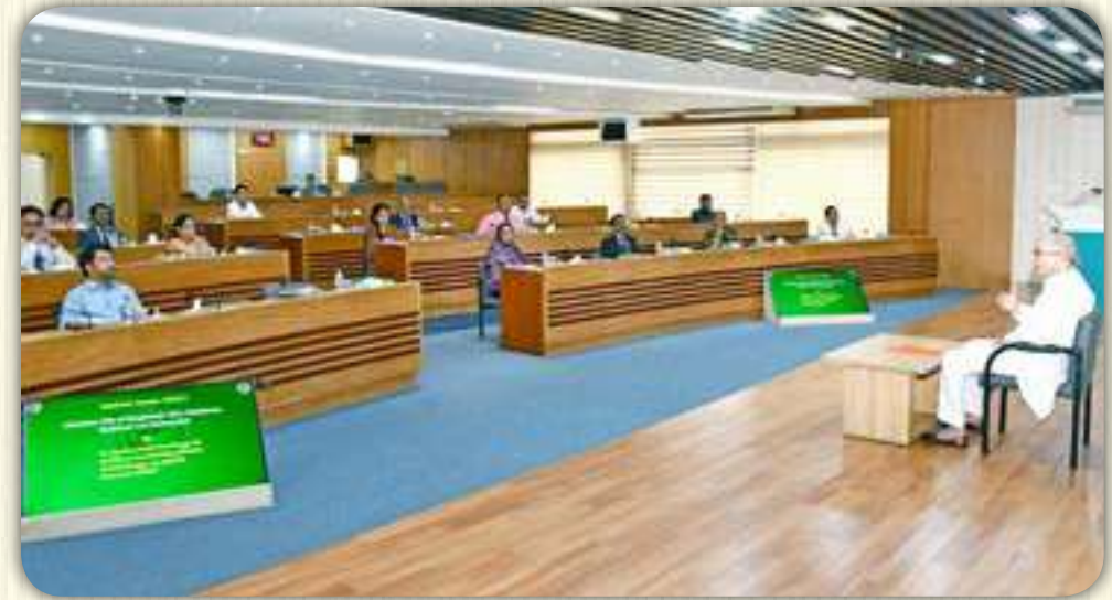
Dr. Tawfiq-e-Elahi Chowdhury, BB Advisor to Hon'ble Prime Minister (Power, Energy and Mineral Resources Affairs) 'Liberation War of Bangladesh 1971: Resistance, Resilience and Redemption'