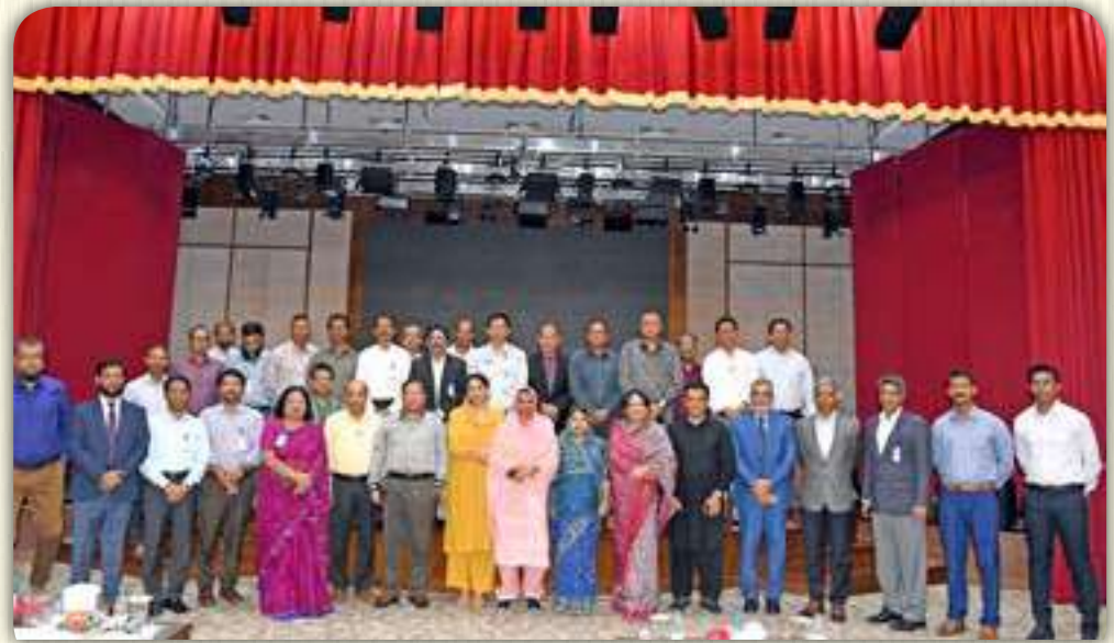
Cox's Bazar Development Authority 17 May 2023