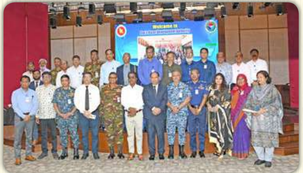
Cox's Bazar Development Authority 14 September 2023