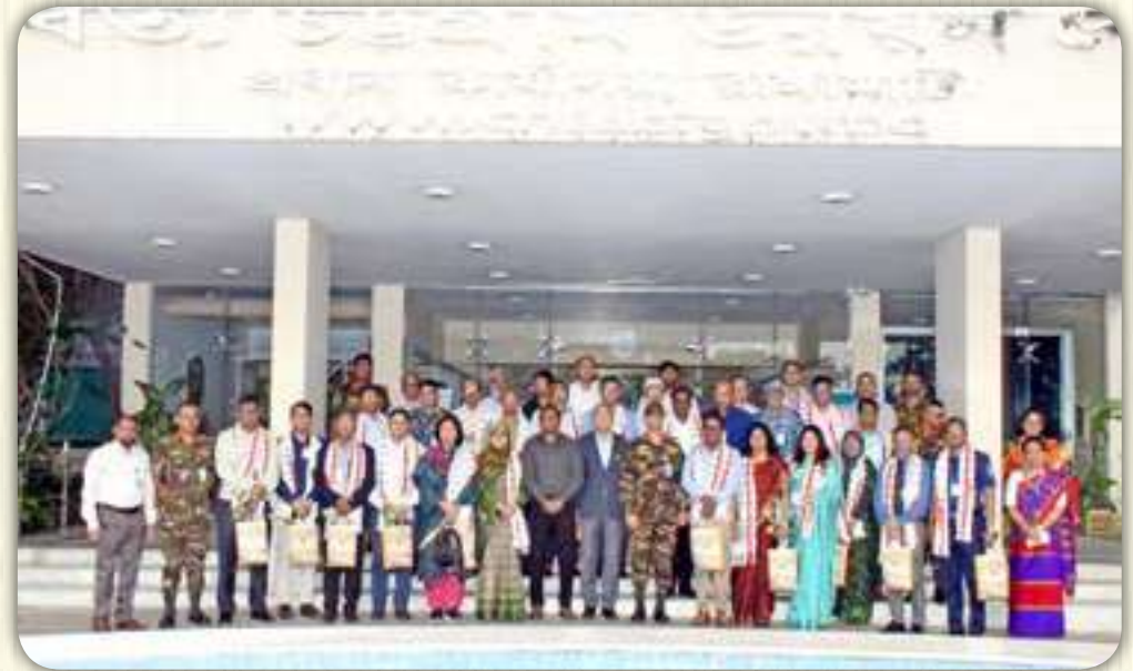
Chittagong Hill Tracts Development Board 11 September 2023