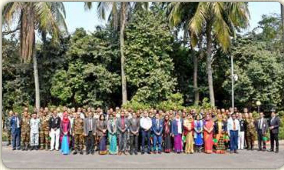
Ministry of Defence 08 February 2023