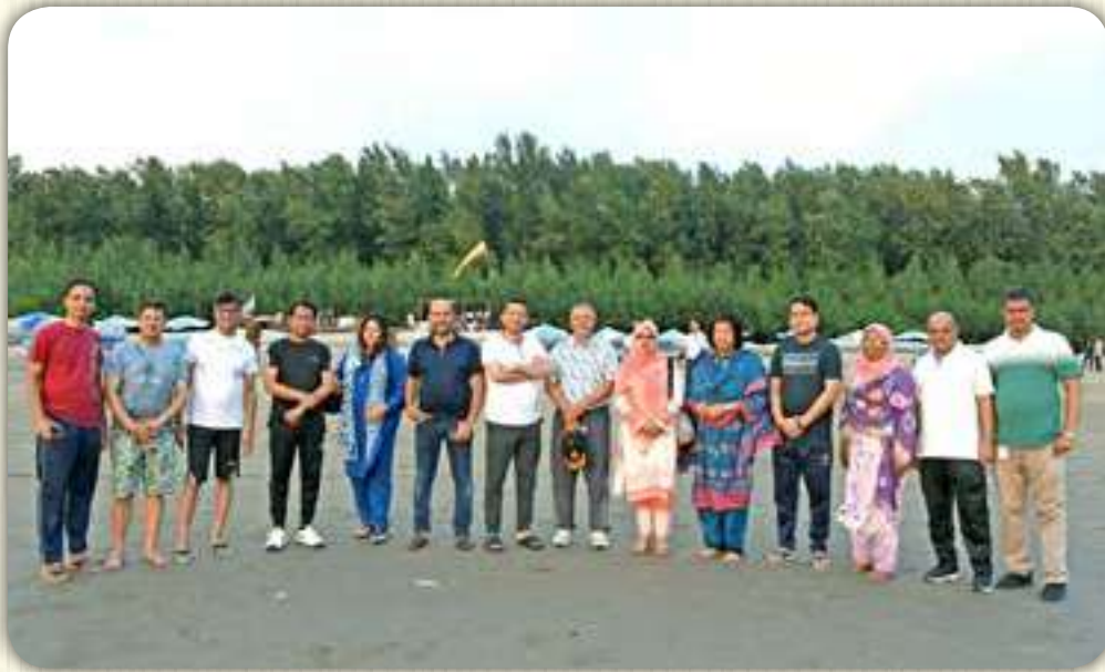
BAF Shaheen Beach 12 September 2023