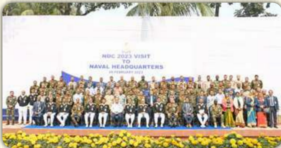
Naval Headquarters 06 February 2023