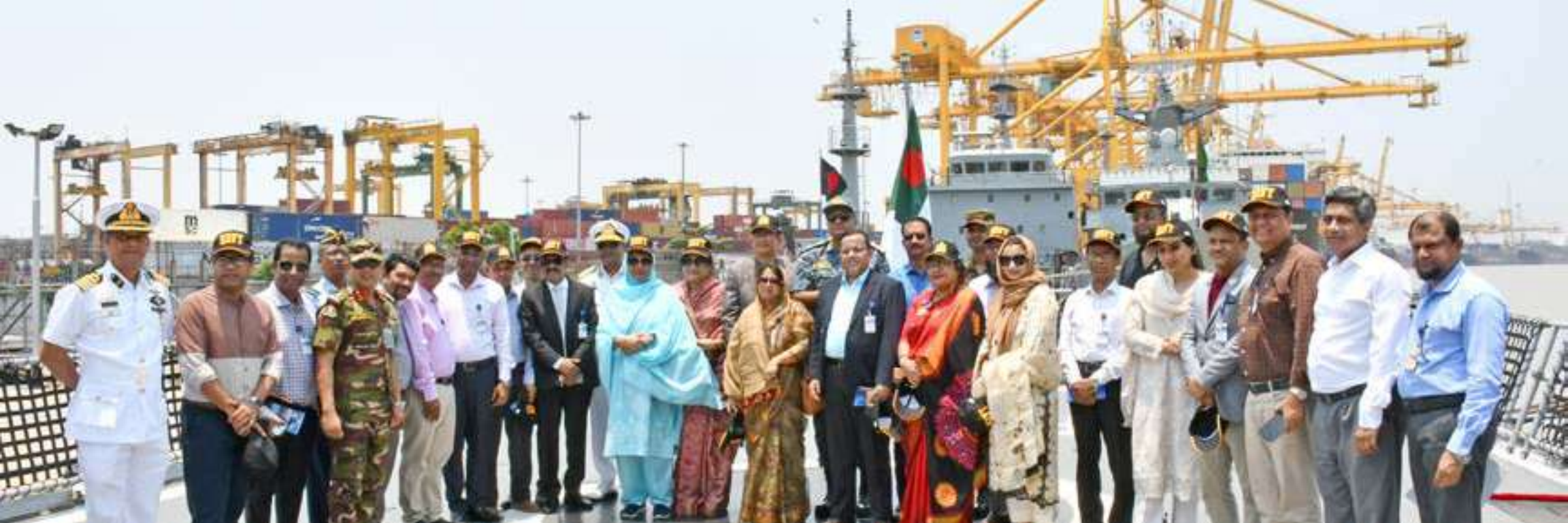
BNS Bangabandhu 16 May 2023