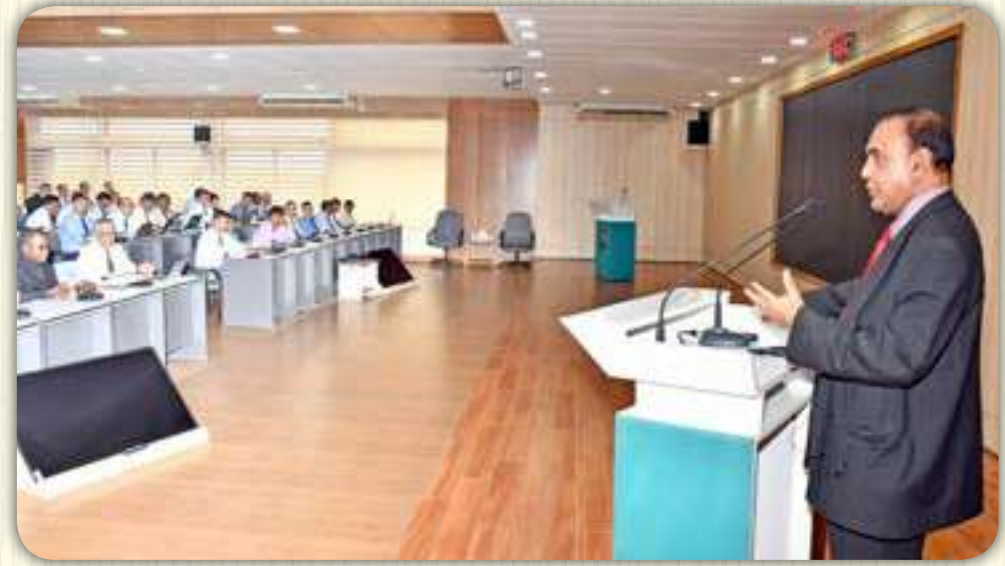
Rear Admiral A.S.M.A Awal, ndc, psc (Retd) 'Maritime/Sea Power: Perspective for Developing Countries'