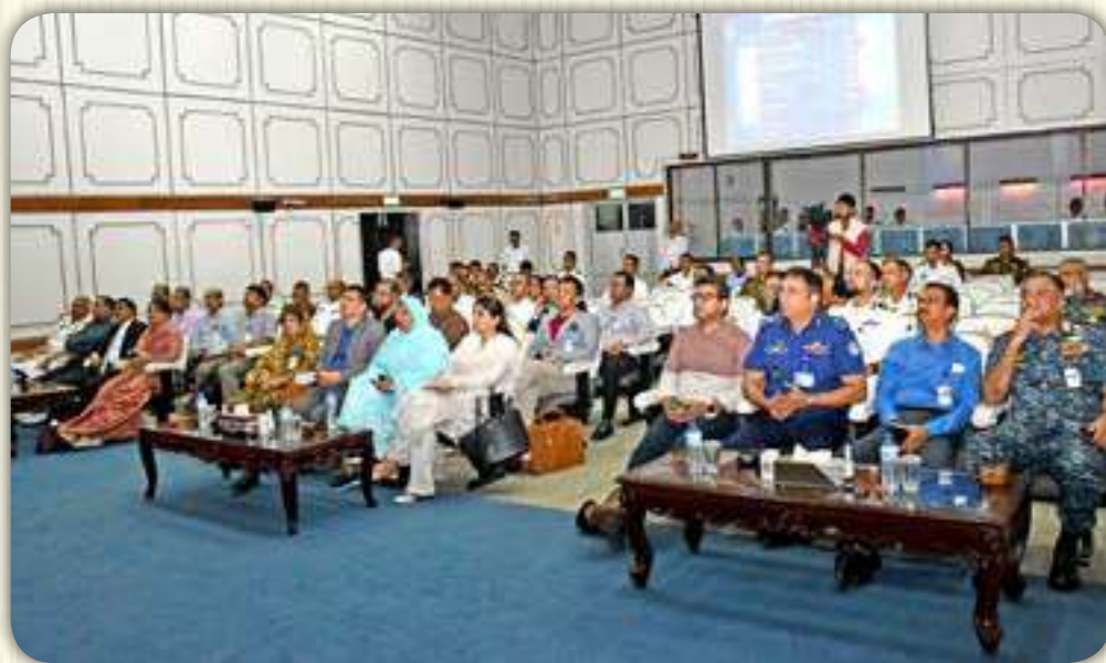
School of Maritime Warfare and Tactics 16 May 2023