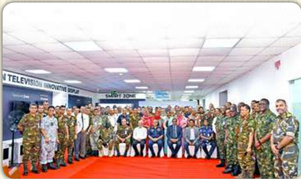
Walton Electronics 03 May 2023