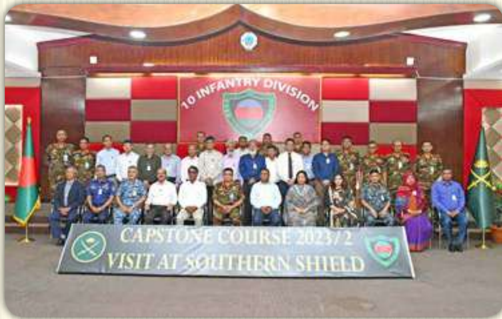
Headquarters 10 Infantry Division 14 September 2023