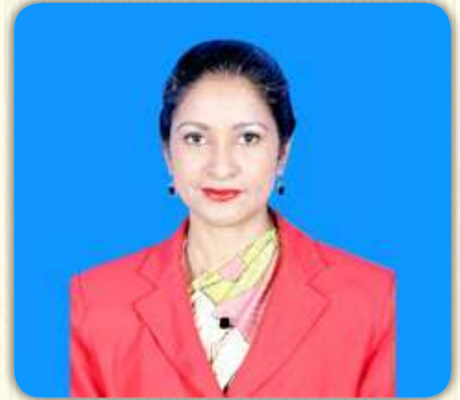
Addl Secy Yasmeen Parveen Bangladesh Civil Service