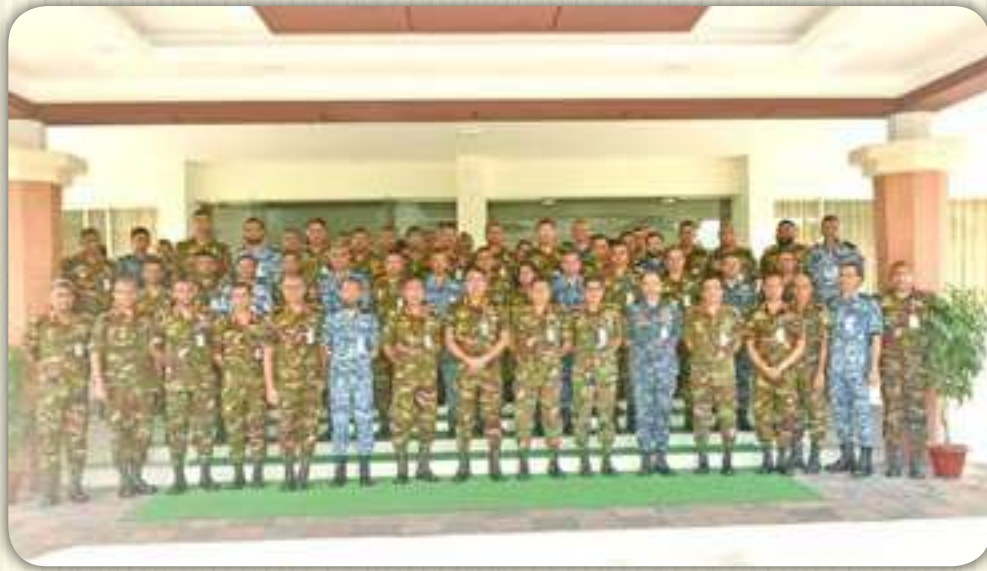
Bangladesh Ordnance Factories 30 July 2023