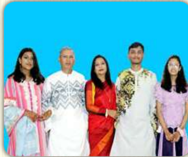
Brig Gen A B M Nowroj Ehsan Bangladesh Army