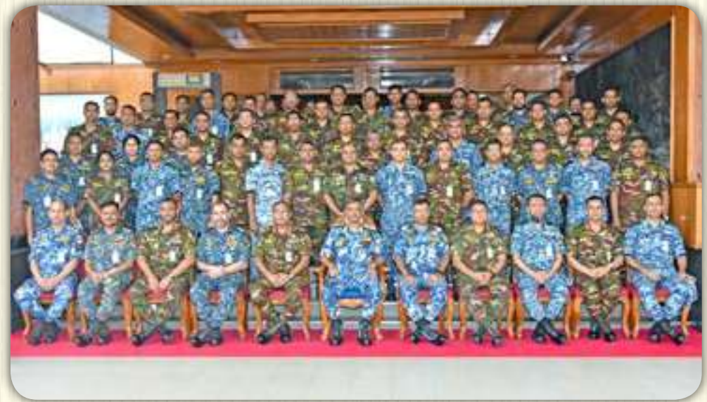
Headquarters Bangladesh Coast Guard 20 July 2023