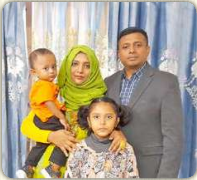
Lt Col Mohammad Golam Akbor Bangladesh Army