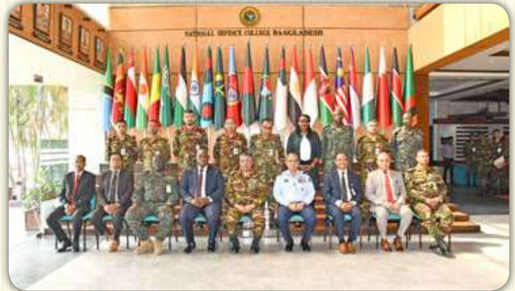
Delegation from Gambia 12 February 2023