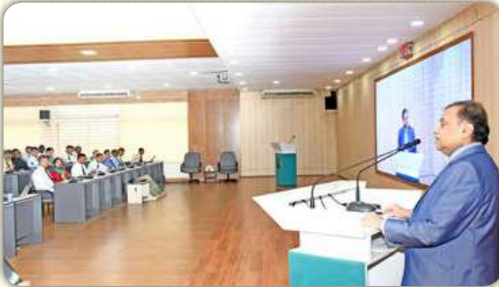
Mr. Abul Hasan Chowdhury Former State Minister of Foreign Affairs 'Geo-strategy of Bangladesh and its Impact on National Security'