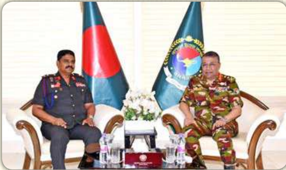
Delegation from Sri Lanka 22 May 2023