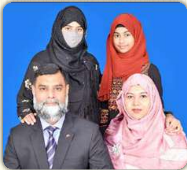
Air Cdre Md. Asad-Uz-Zaman Bangladesh Air Force