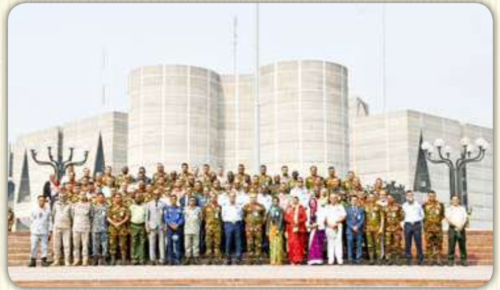
Bangladesh National Parliament 28 February 2023