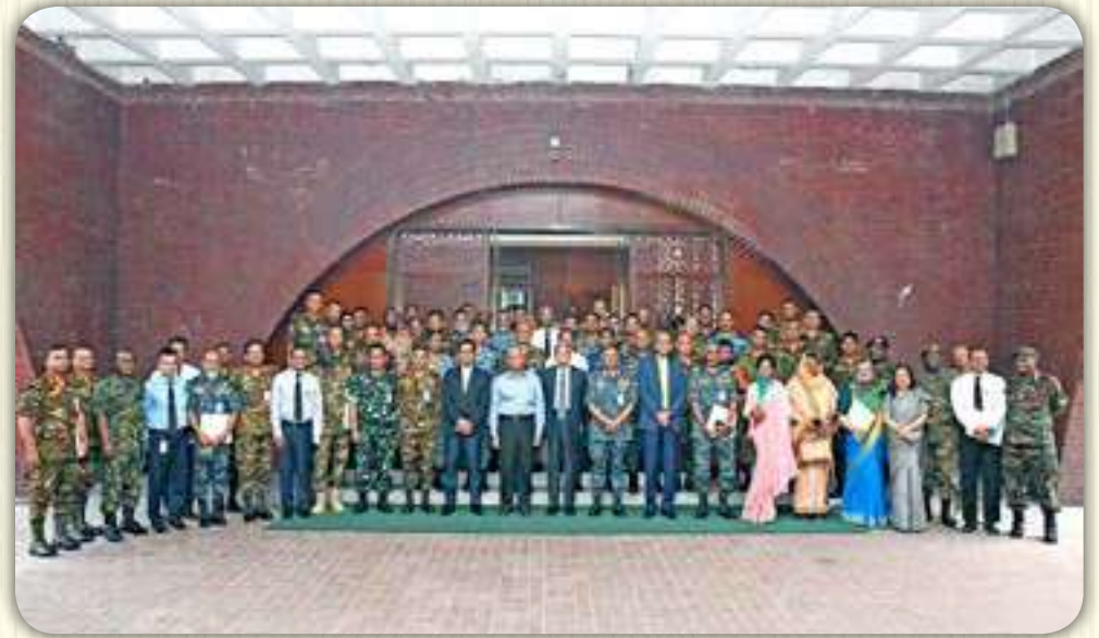
Ministry of Planning 11 October 2023