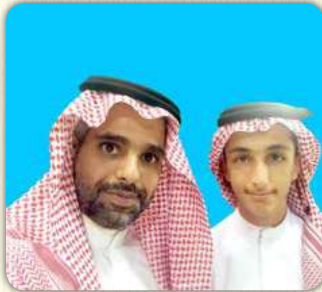
Lt Col Bandar Sager A. Alsabti Royal Saudi Armed Forces