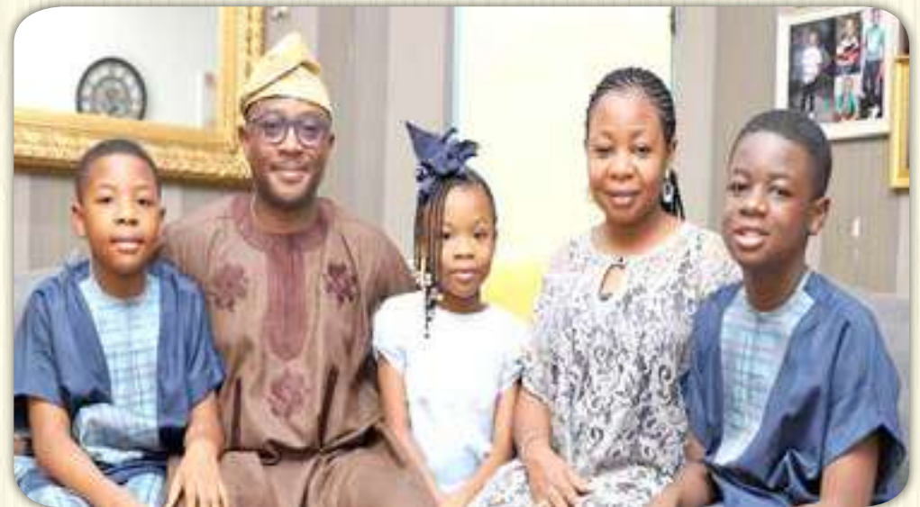
Gp Capt FO Olanrewaju Nigerian Air Force