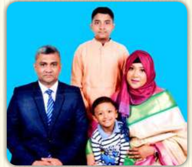
Lt Col Mehedi Hasan Bangladesh Army