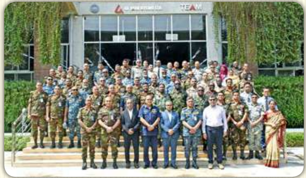
4A Yarn Dying Limited 17 May 2023