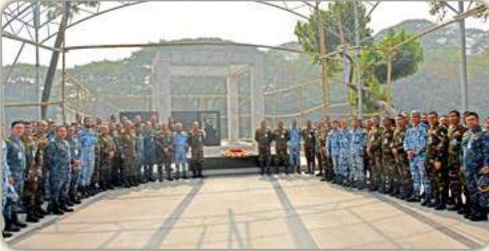
Bangabandhu Museum 24 January 2023