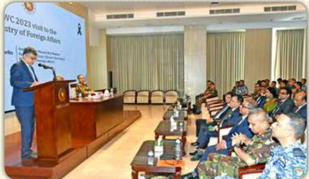
Ministry of Foreign Affairs 02 July 2023