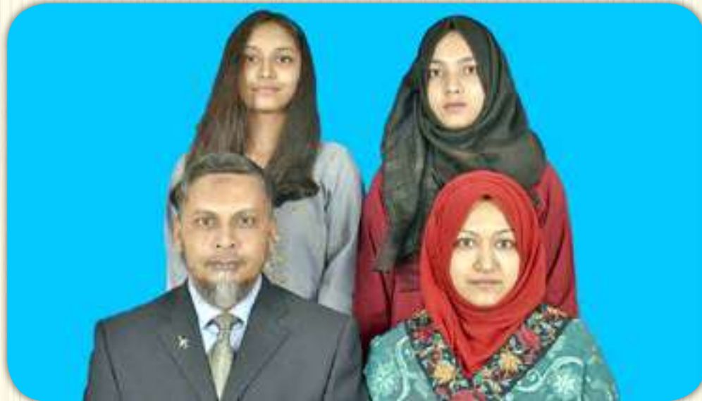
Gp Capt Sk Ashraf Hossain Bangladesh Air Force