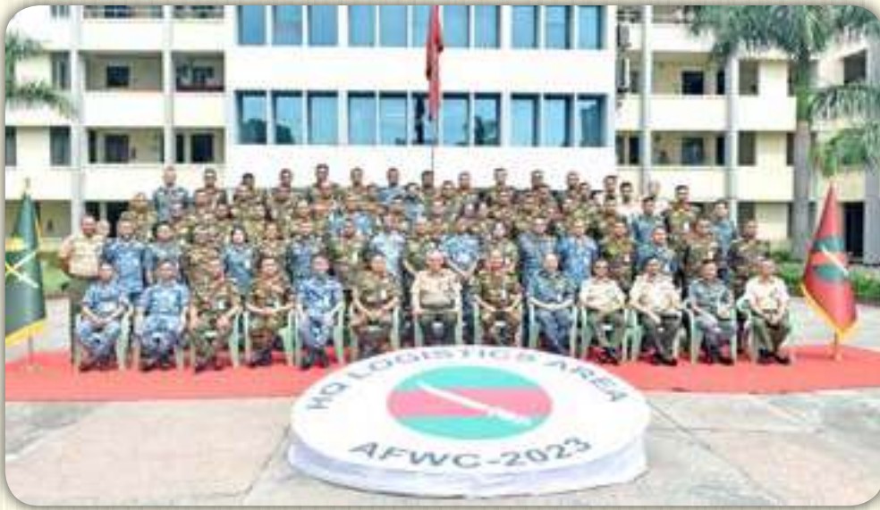
Headquarters Logistics Area 20 July 2023