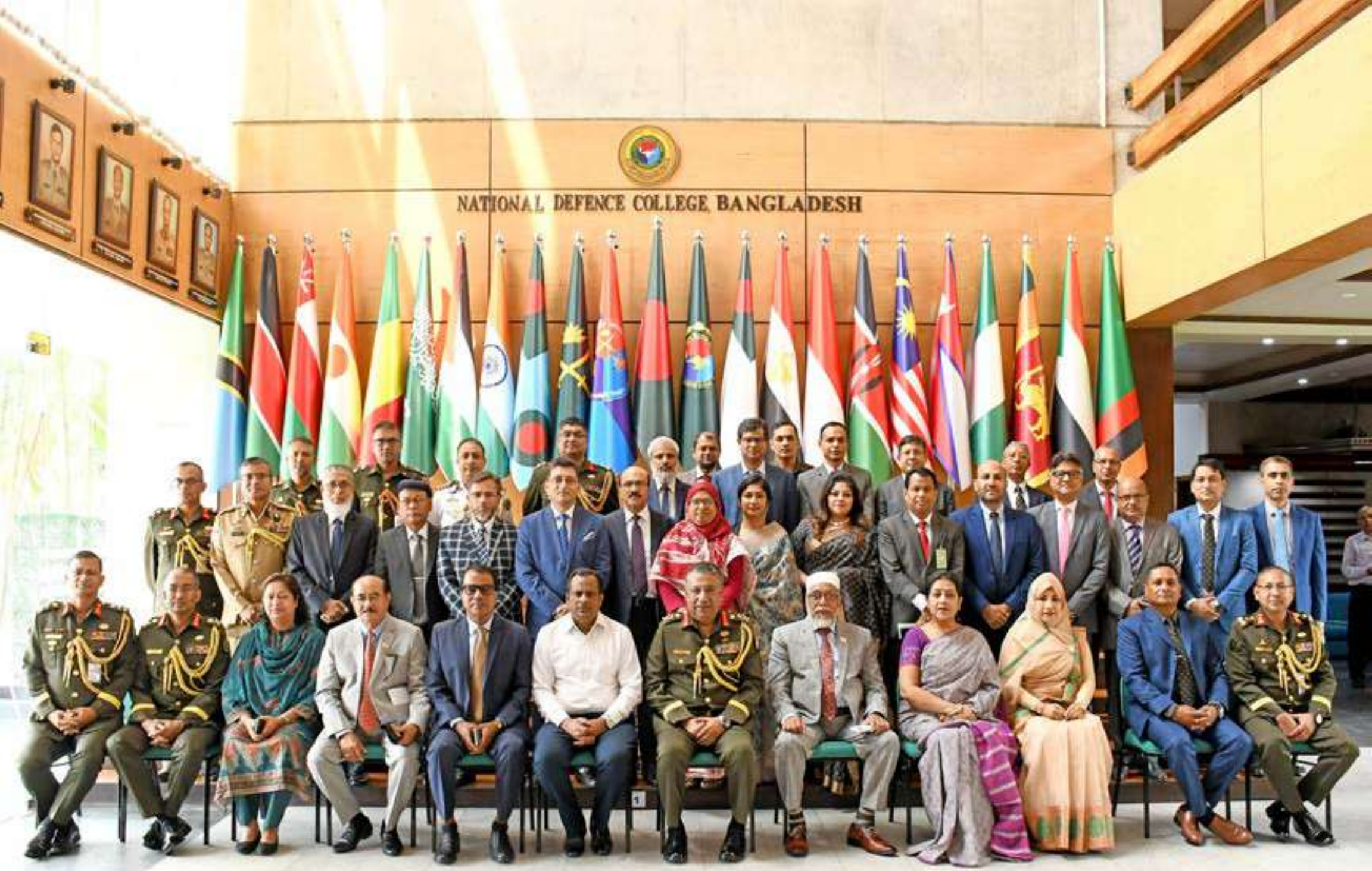
Capstone Course 2023/2 on 03 September 2023