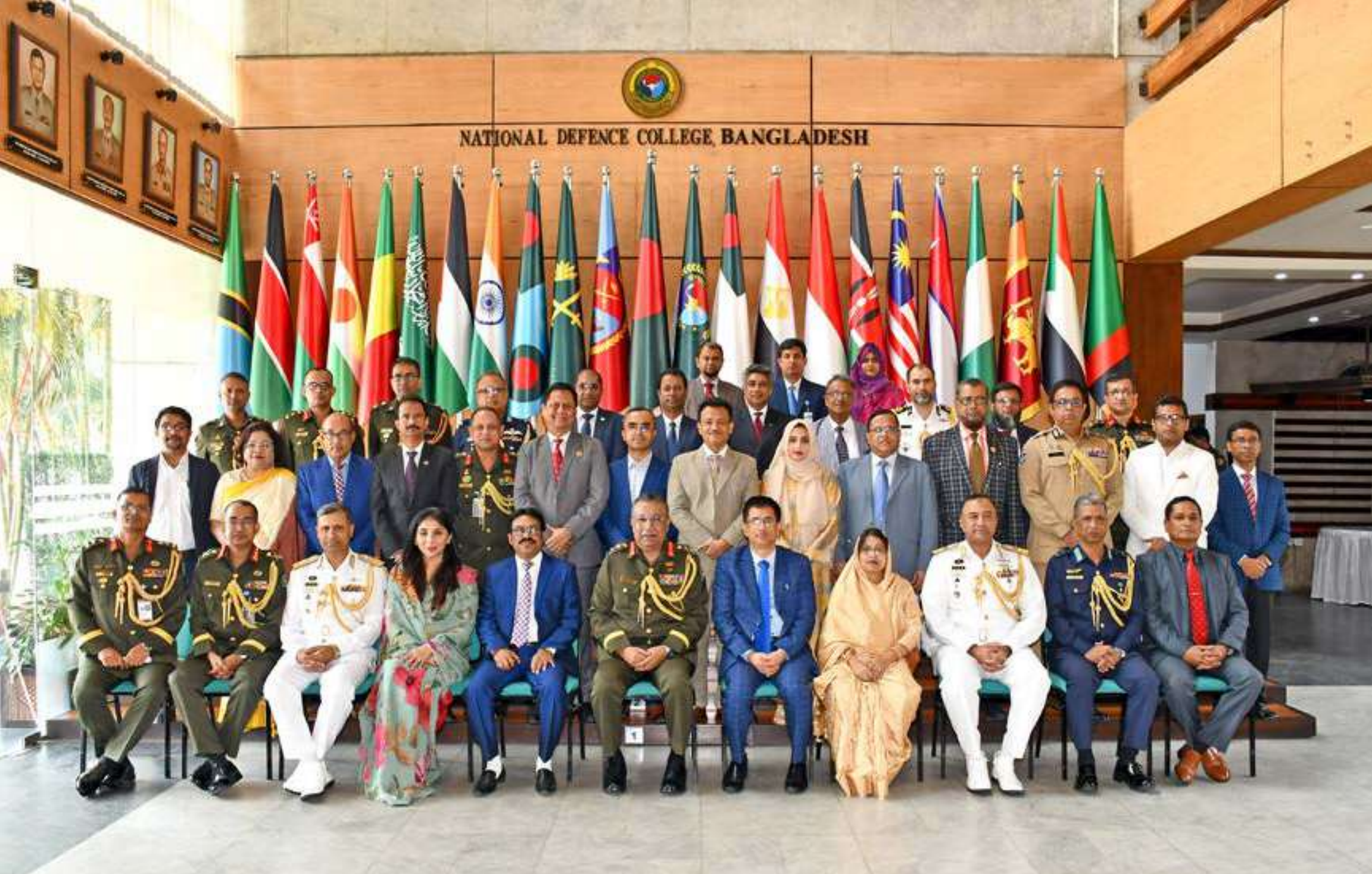
Capstone Course 2023/1 on 07 May 2023