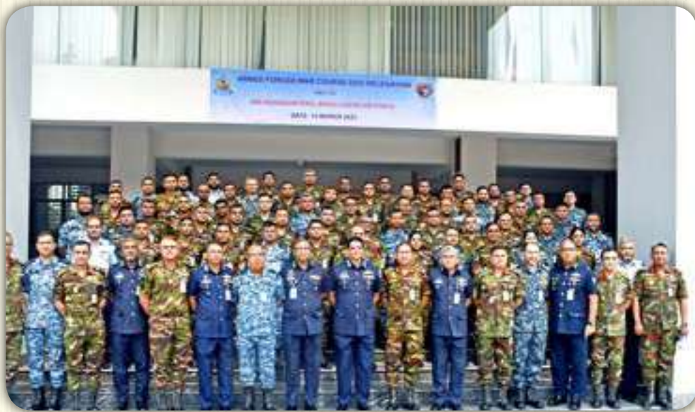
Air Headquarters 14 March 2023