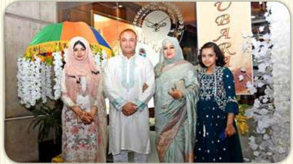
Maj Gen Syed Tareq Hussain SDS (Army) (Outgoing)