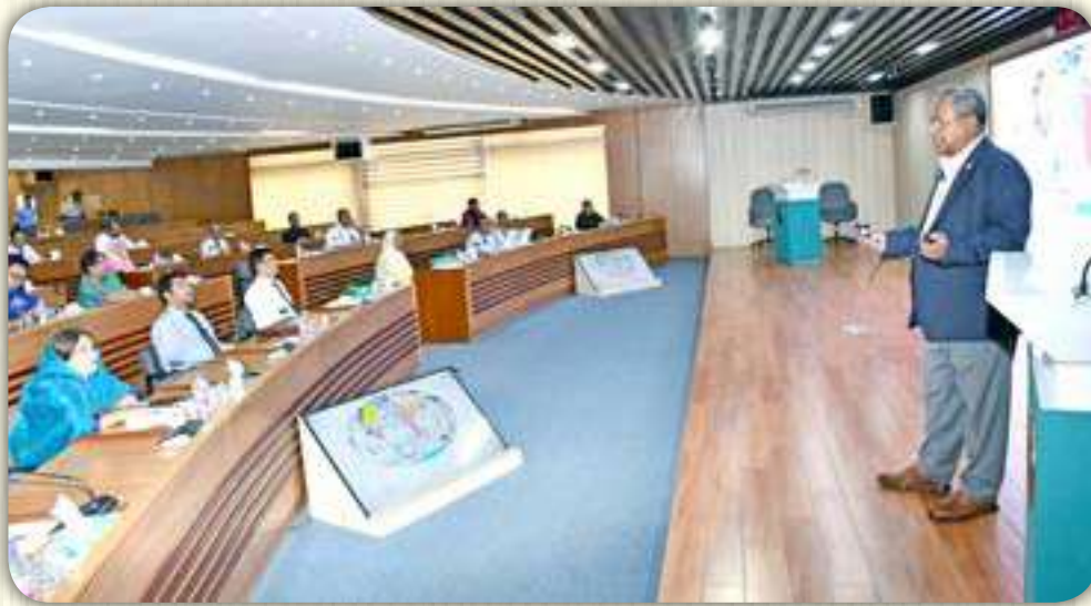
Rear Admiral Md Khurshed Alam, ndc, psc, BN (Retd) Secretary, Maritime Affairs Unit, Ministry of Foreign Affairs 'Managing a Sustainable and Equitable Blue Economy: Exploring Opportunities for South East Asian Regions'