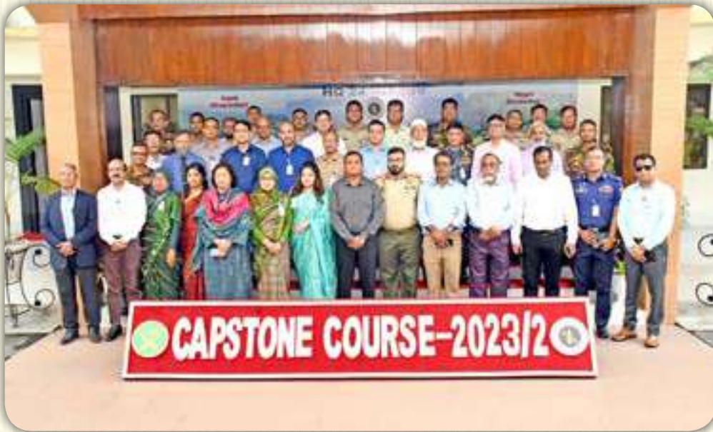
Headquarters 24 Infantry Division 11 September 2023