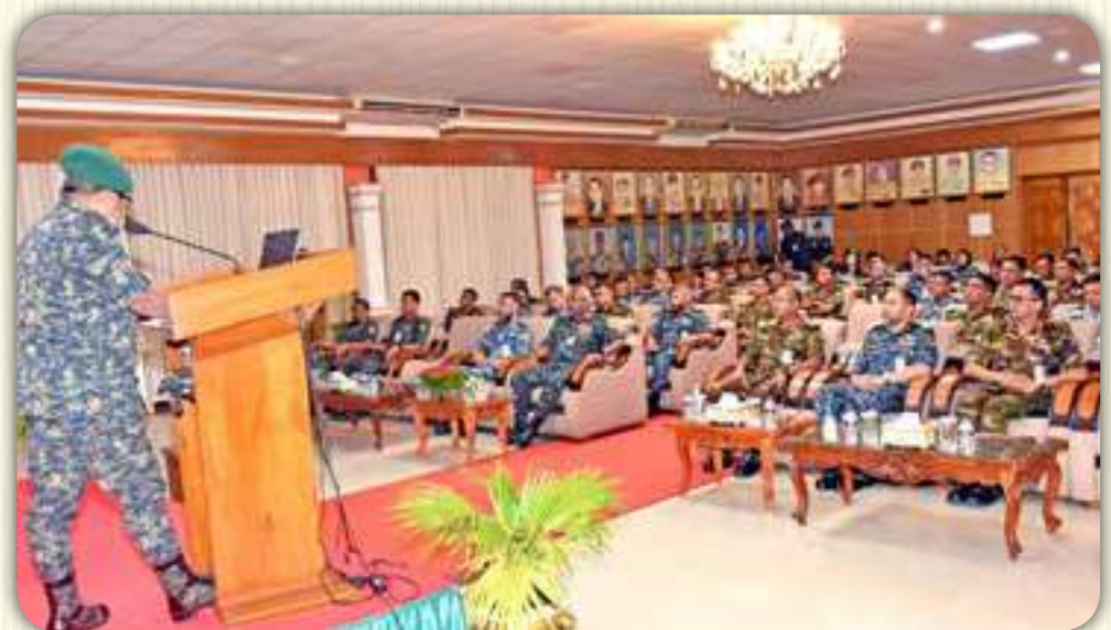
Ansar Training Centre, Shafipur 16 July 2023