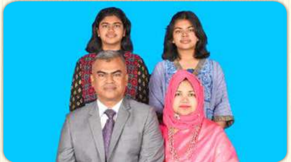
Gp Capt Md Monzur-E-Alam Bangladesh Air Force