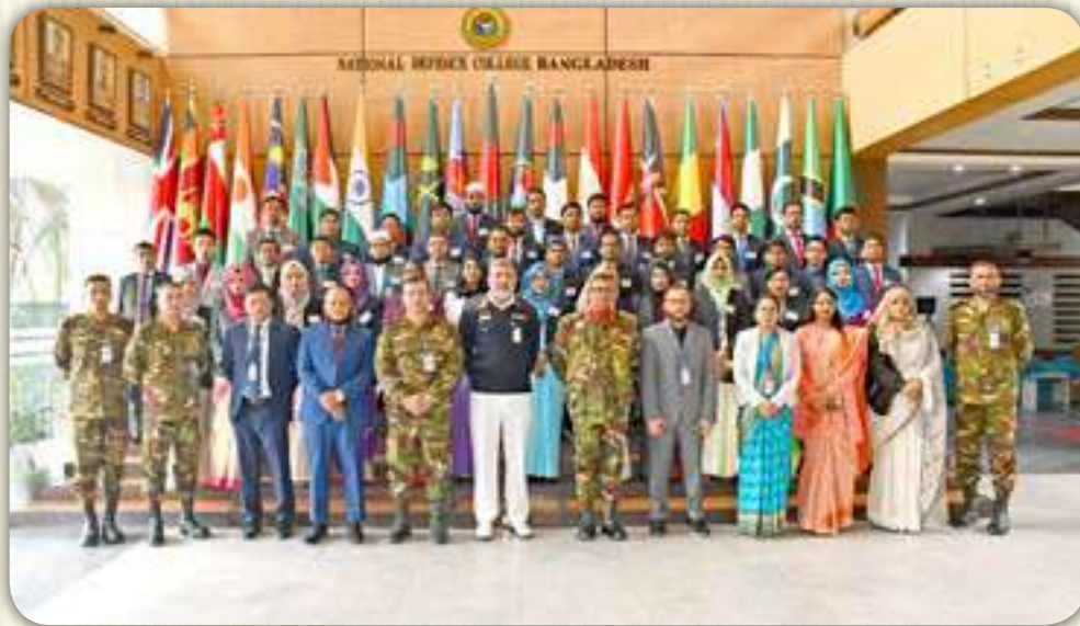
40th BCS Audit & Accounts Cadre 03 January 2023