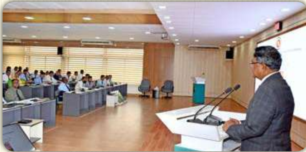
Dr. Muhammad Abdur Razzaque, MP Hon'ble Minister, Ministry of Agriculture 'Agriculture Sector in Bangladesh Economy - The Traditional Backbone'