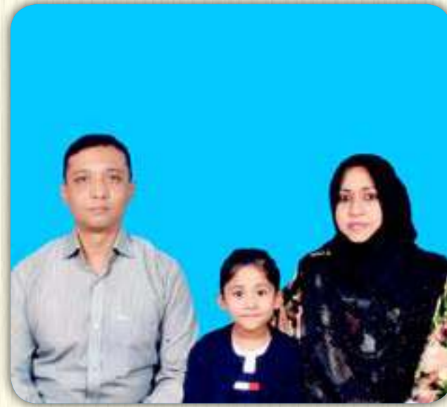
Lt Col Muhammad Faheem Alam Basunia Bangladesh Army