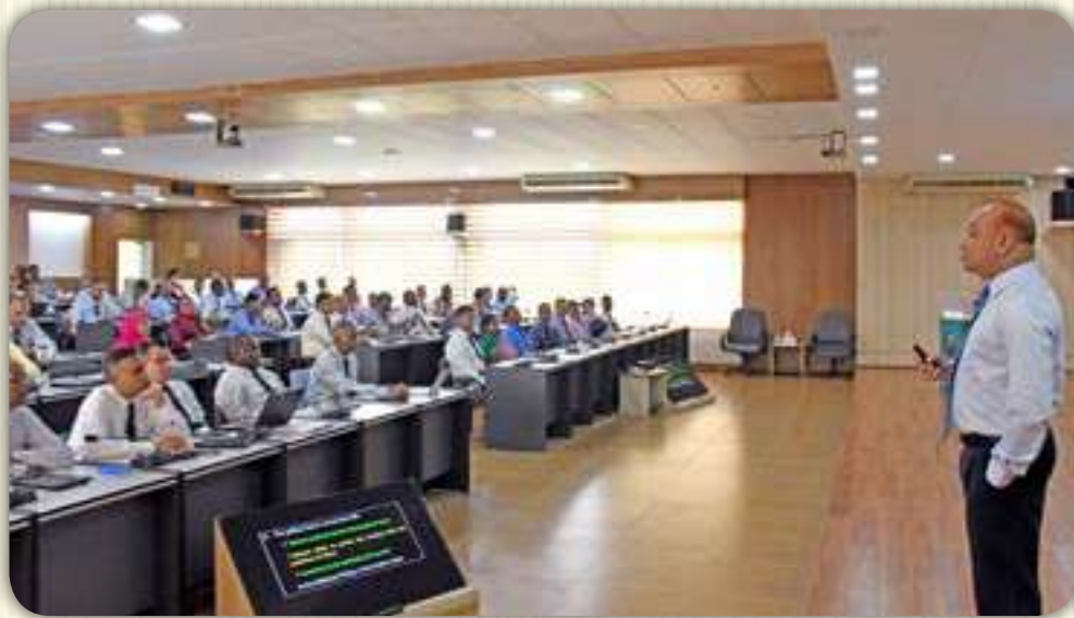
Major General Syed Tareq Hussain, OSP, awc, psc Ambassador, Ministry of Foreign Affairs 'Defence Policy Making - Theory and Practice'