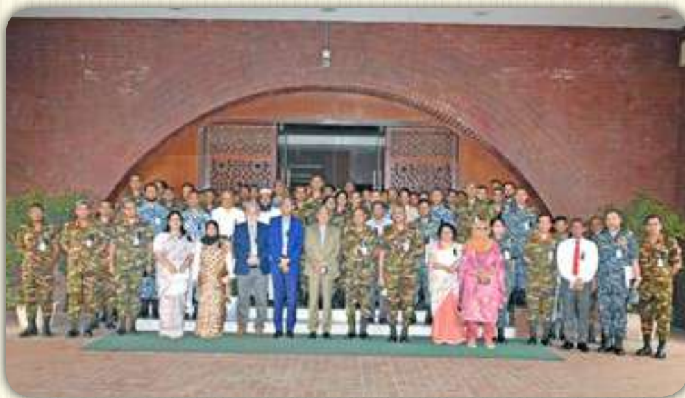
Ministry of Planning 10 August 2023