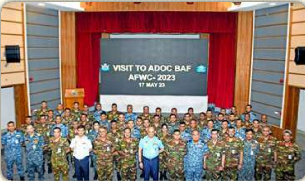
Air Defense Operations Center 17 May 2023