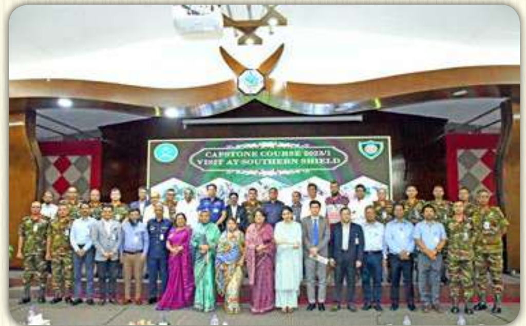
Headquarters 10 Infantry Division 18 May 2023