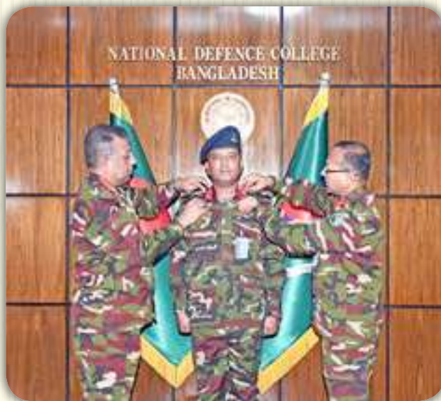
Col Omar Bin Masud