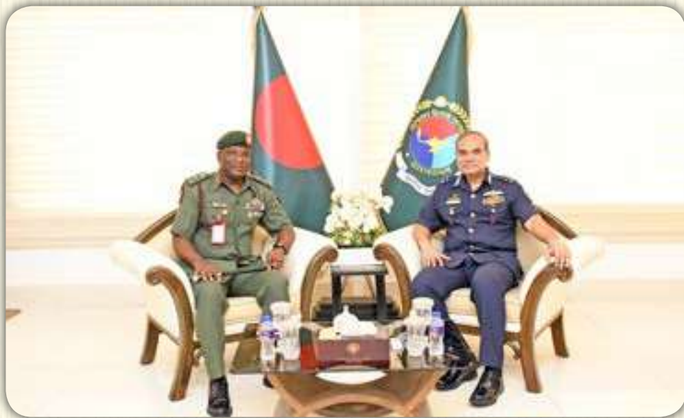
Delegation from Nigeria 19 October 2023