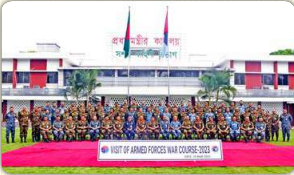
Armed Forces Division 16 March 2023