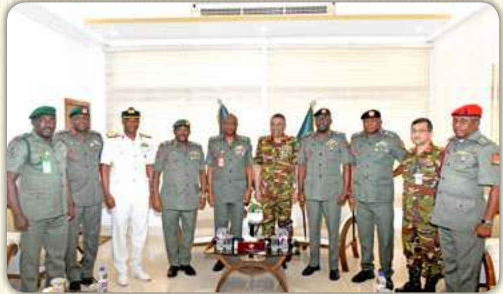
Delegation from Nigeria 13 June 2023