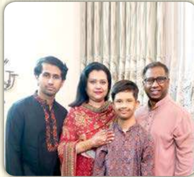
Air Cdre Sitwat Nayeem Bangladesh Air Force