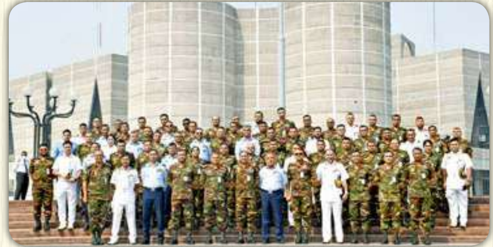
Bangladesh National Parliament 28 January 2023