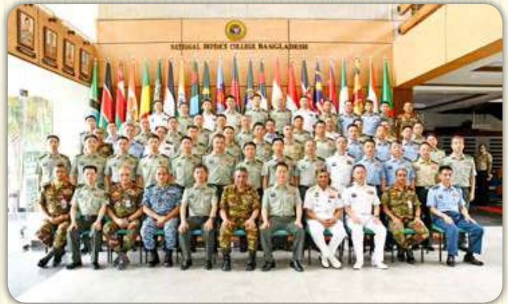
Delegation from NDU, China 22 June 2023