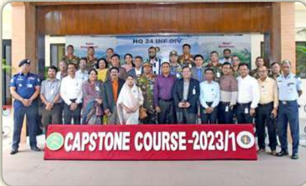
Headquarters 24 Infantry Division 17 May 2023