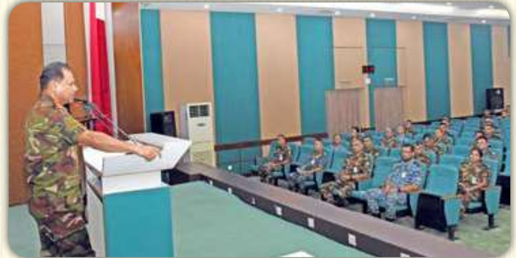
General S M Shafiuddin Ahmed, SBP (BAR), OSP, ndu, psc, PhD Chief of Army Staff, Bangladesh Army 'Keynote Speech on Bangladesh Army'