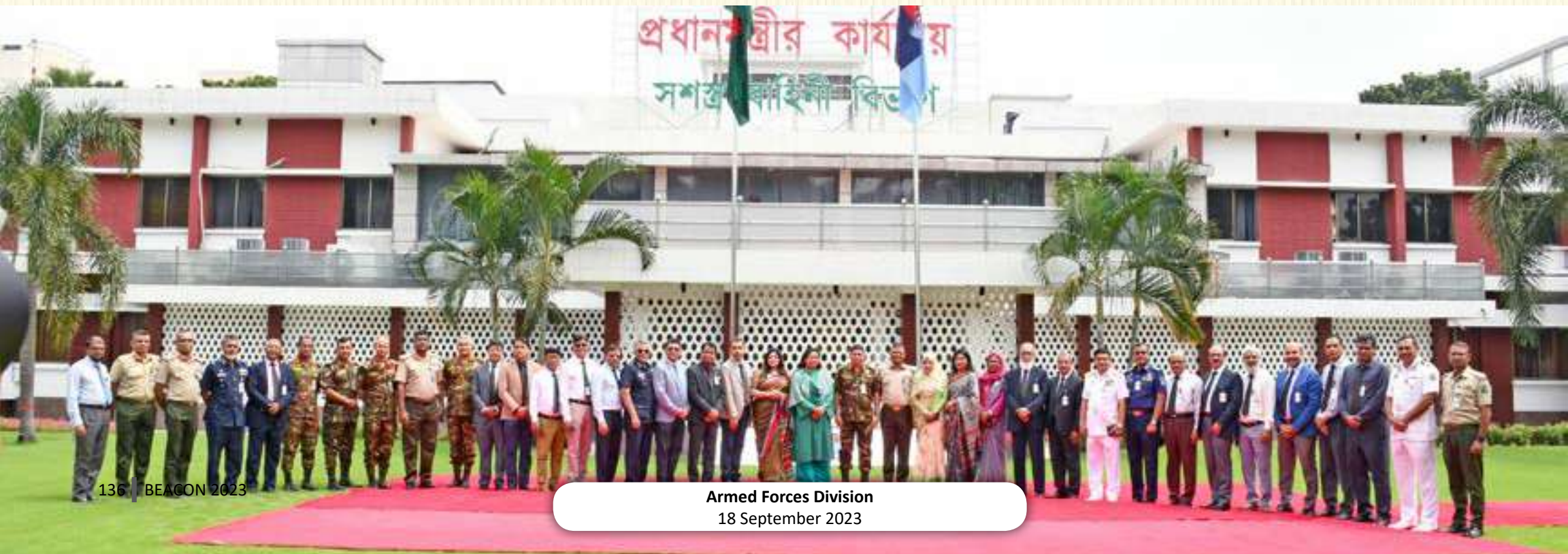
Armed Forces Division 18 September 2023