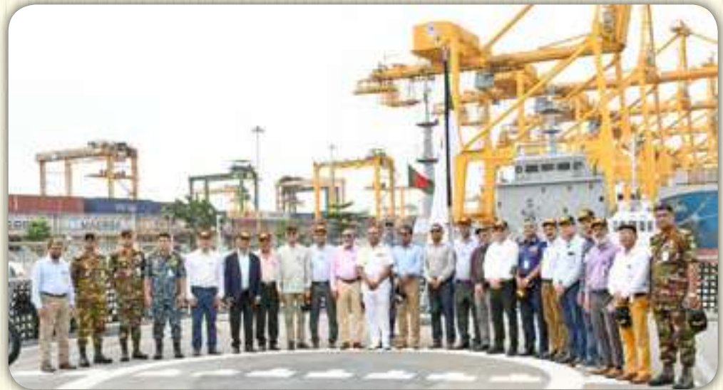
BNS Bangabandhu 11 September 2023