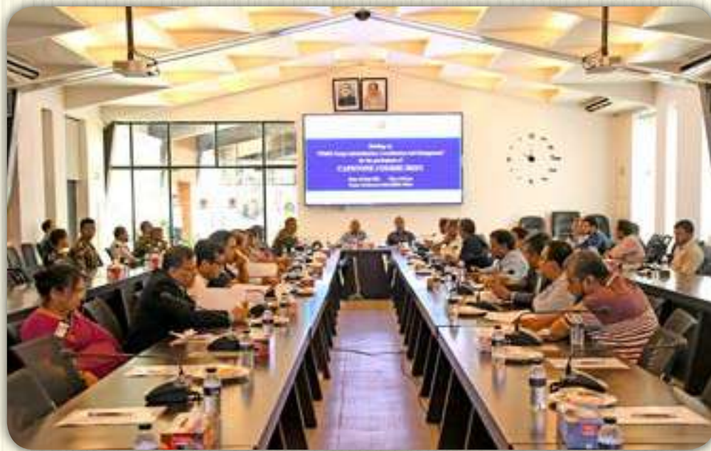
Office of the Refugee Relief and Repatriation Commissioner 18 May 2023