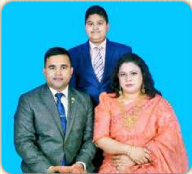
Cdr Mohammad Monzurul Islam Bangladesh Navy