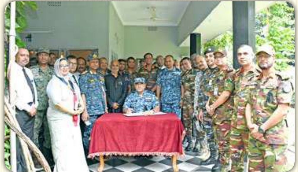
Bangabandhu Memorial Museum 17 August 2023