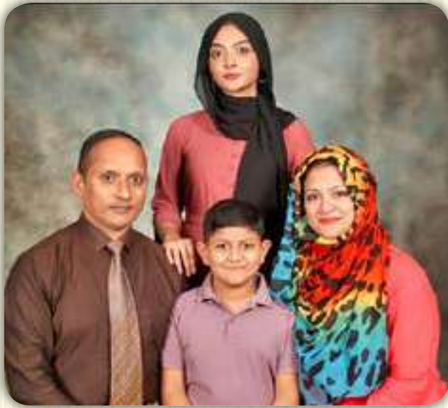
Air Cdre Md. Zahir Uddin Bangladesh Air Force