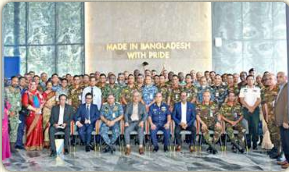
Bangladesh Garment Manufacturers and Exporters Association 17 May 2023