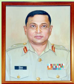
Lt Gen Sina Ibn Jamali, awc, psc 14 May 2009 to 31 Oct 2009