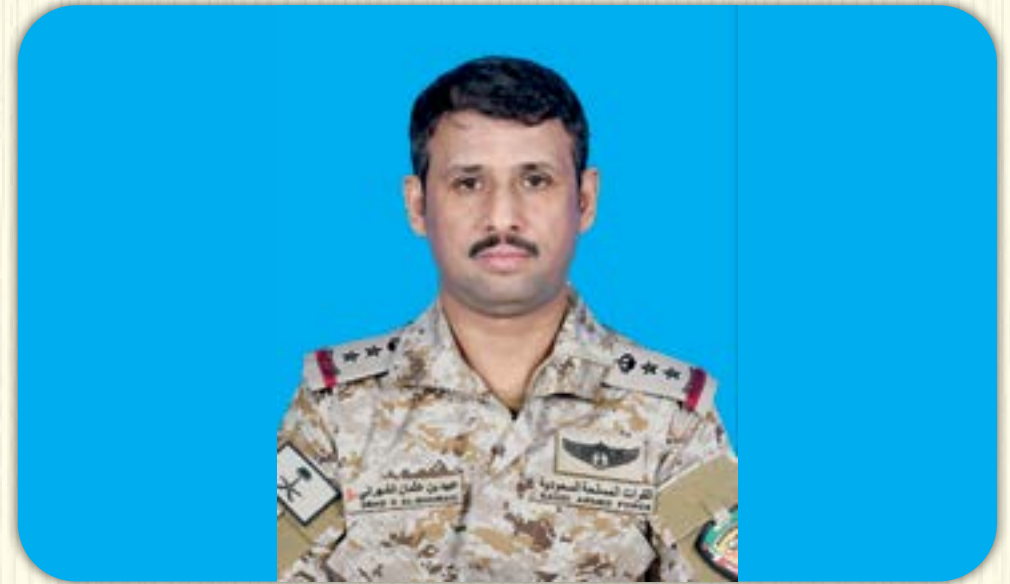
Staff Col (Pilot) Obaid Othman Alshahrani Royal Saudi Armed Force