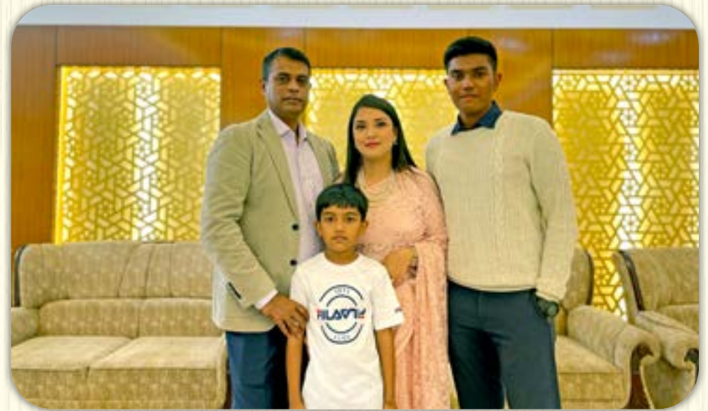
Gp Capt Toyobur Rahman Bangladesh Air Force