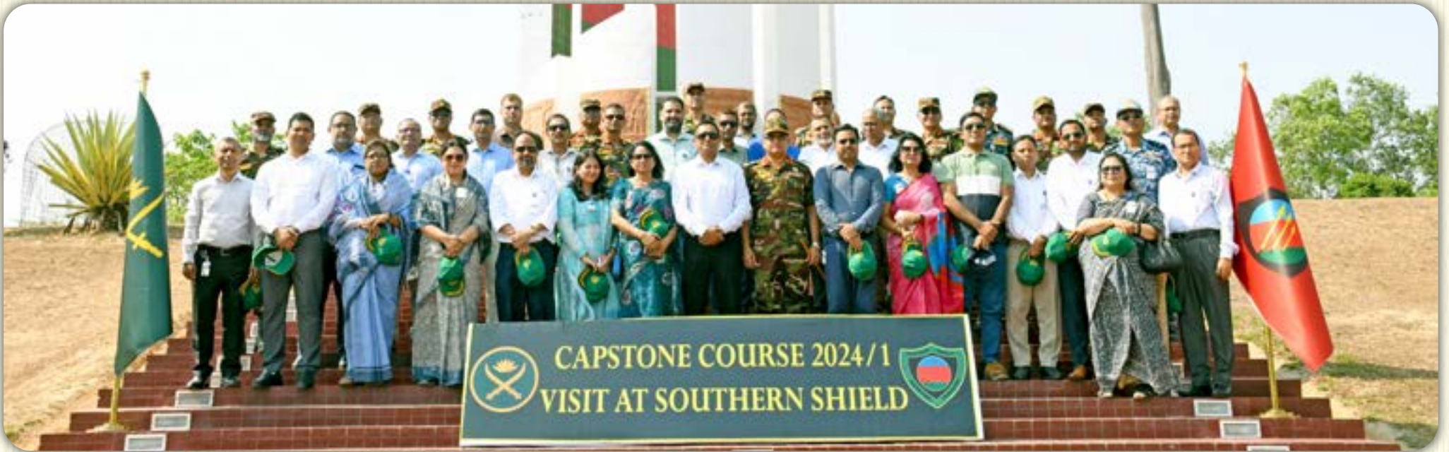
Headquarters 10 Infantry Division 24 April 2024