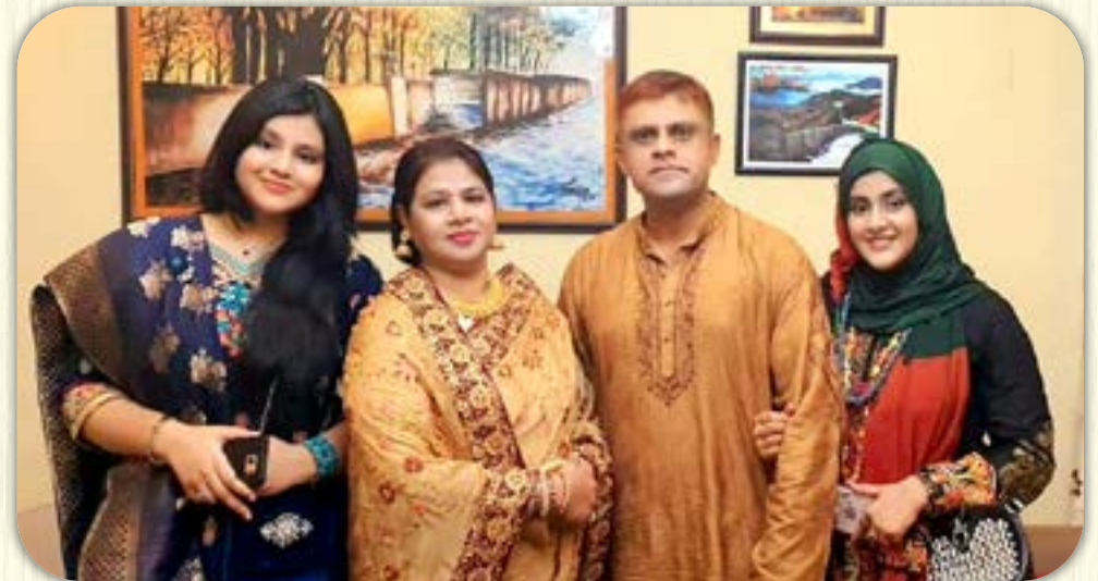
Brig Gen A K M Sazedul Islam DS (Army)