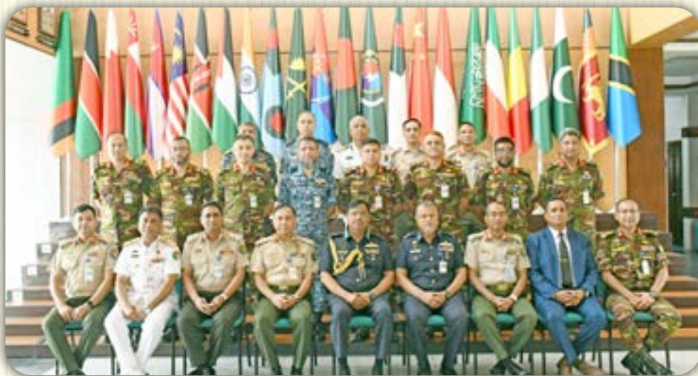
Air Chief Marshal Shaikh Abdul Hannan, BBP, BUP, nswc, fawc, psc, GD(P) Chief of Air Staff, Bangladesh Air Force 30 May 2024