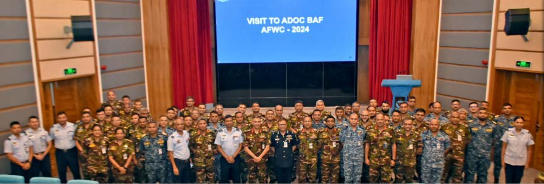
Air Defence Operation Center 02 July 2024