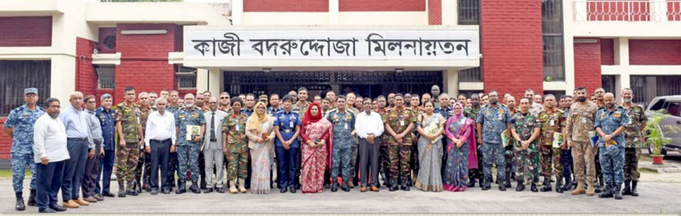
Bangladesh Agricultural Research Institute 13 June 2024