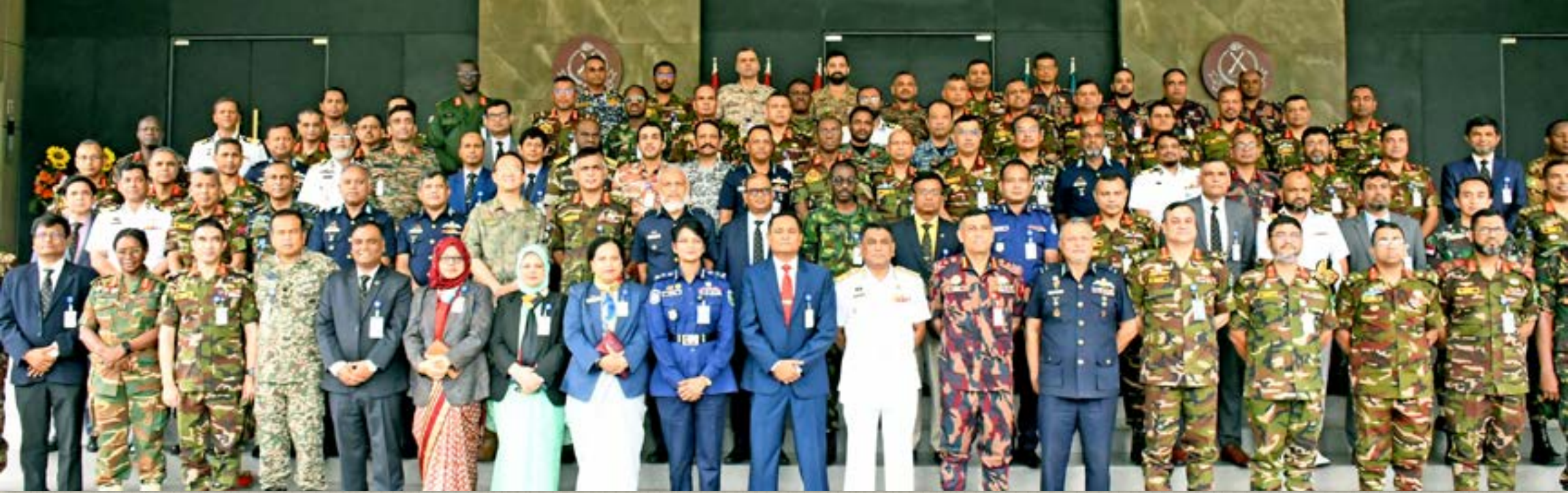
Headquarters Border Guard Bangladesh 28 March 2024