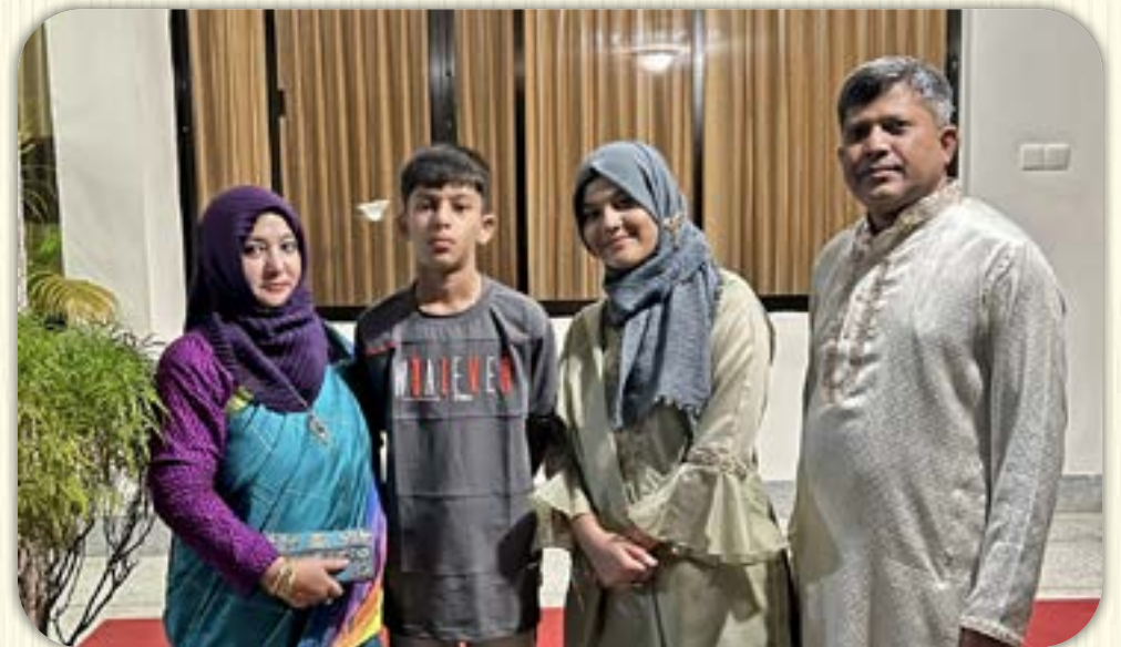
Air Cdre Kazi Iqbal Karim Bangladesh Air Force