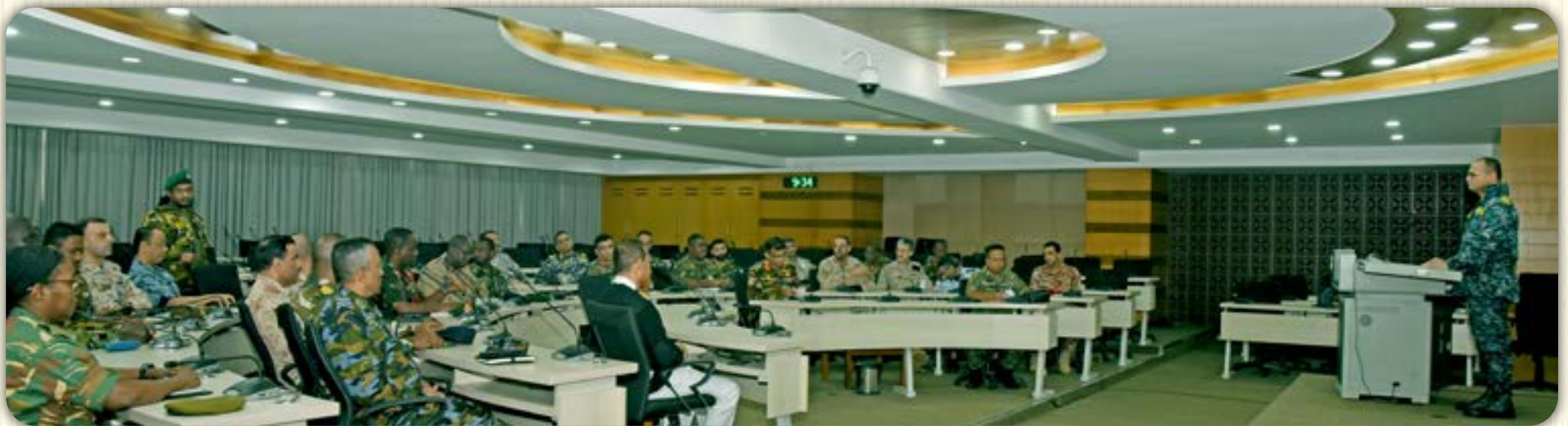
Orientation Visit to Defence Services Command and Staff College (International Course Members) 21 January 2024