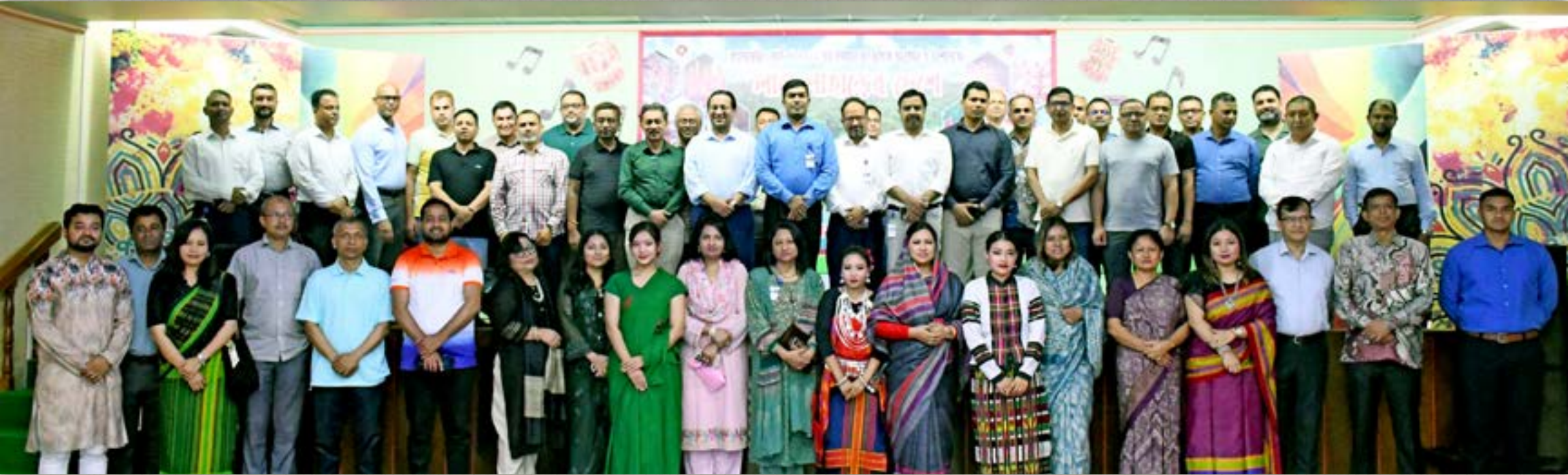
Headquarters 305 Infantry Brigade, Rangamati 22 April 2024