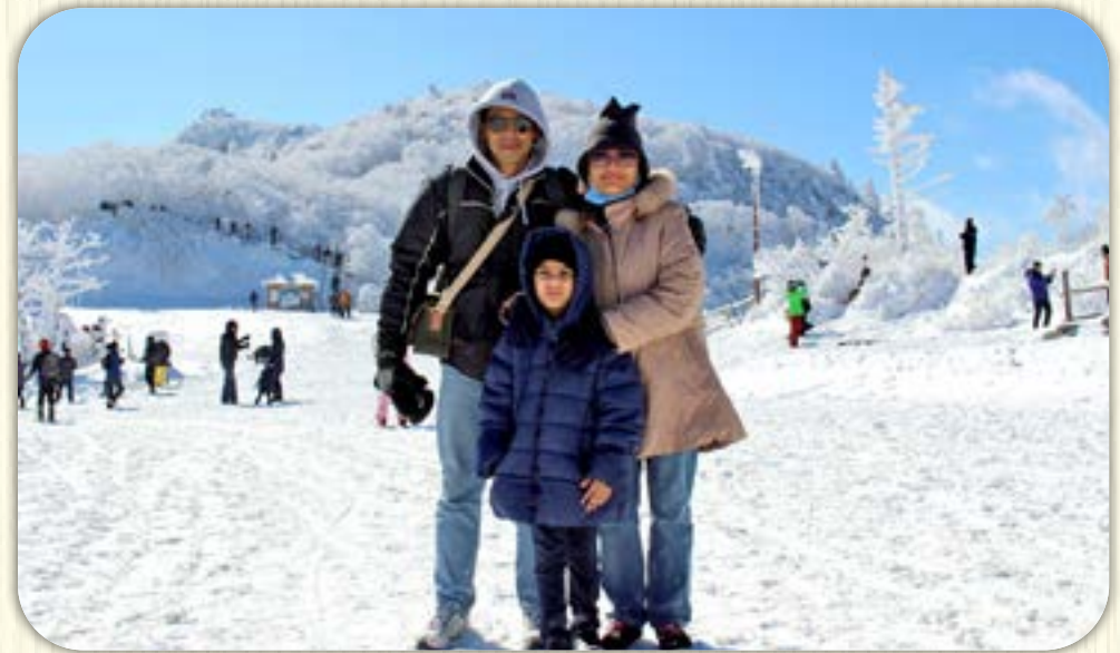
Capt Zaynal Abedin Mahbub Bangladesh Navy