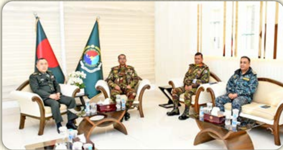
Senior Colonel Du Xinsheng

Defence Attache of the Embassy of the People's Republic of China in Bangladesh 17 January 2024