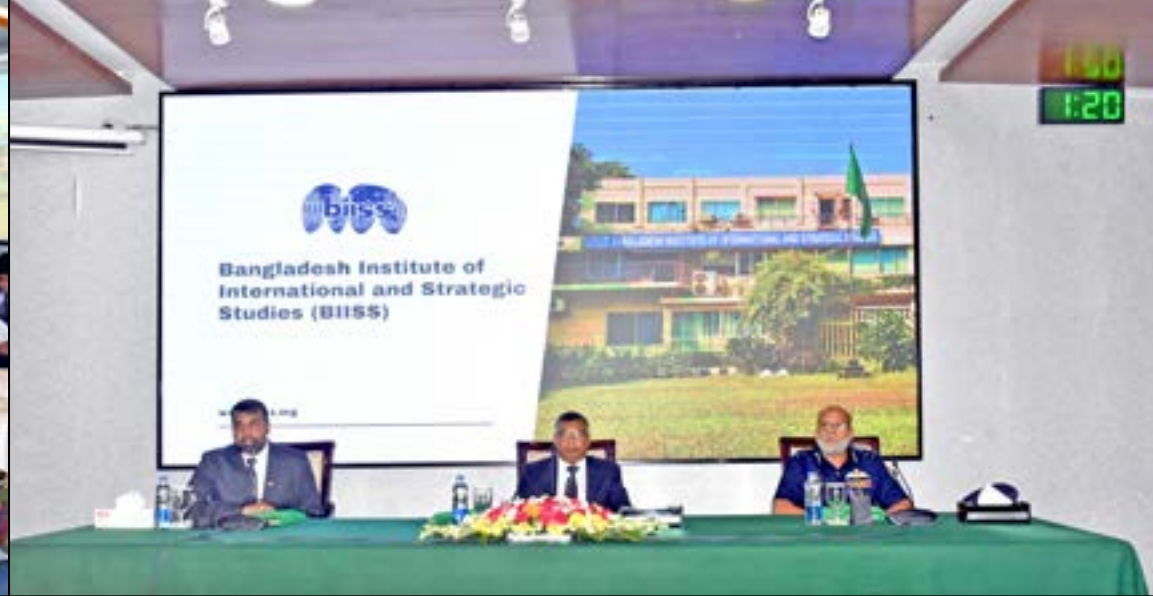
Bangladesh Institute of International and Strategic Studies (BISS) 15 July 2024