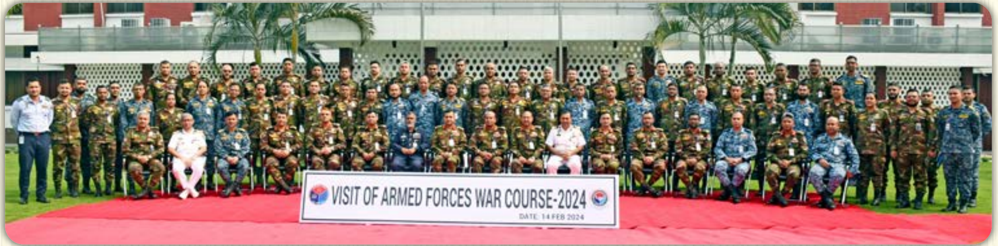
Armed Forces Division 14 February 2024