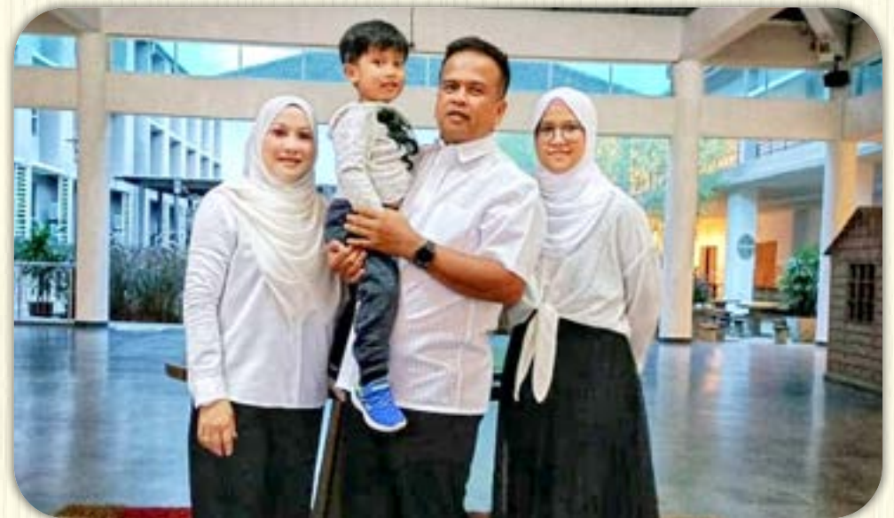
Maj Gen Dato' Rashidin Hashimi bin Ab Rashid Malaysia Army