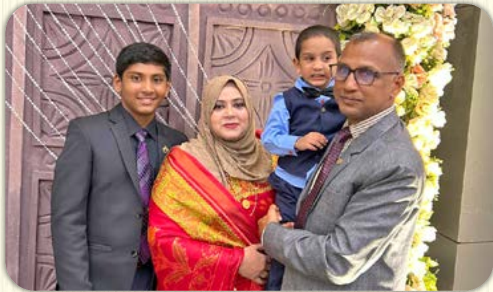
Brig Gen S M Ashraful Islam Bangladesh Army