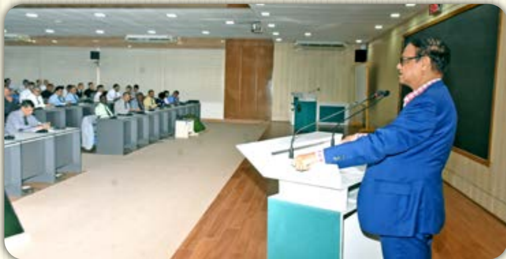
Dr. Ahsan H. Mansur Governor, Bangladesh Bank 'Infrastructure Development and Connectivity (Land, Water and Air) Key to Development of Bangladesh'