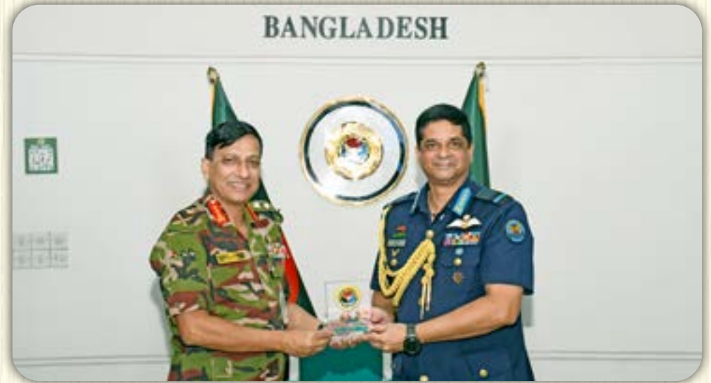
Air Chief Marshal Hasan Mahmood Khan, BBP, OSP, GUP, nswc, psc, GD(P) Chief of Air Staff, Bangladesh Air Force 04 November 2024