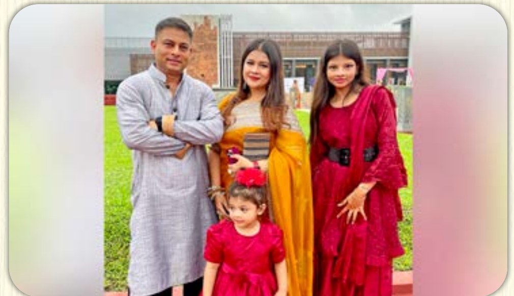
Lt Col Montasir Rahman Chowdhury Bangladesh Army