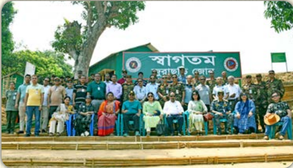
Rajmonipara Army Camp 23 April 2024