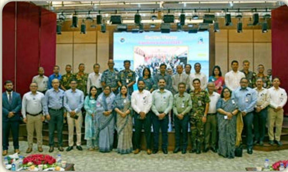
Cox's Bazar Development Authority 25 April 2024