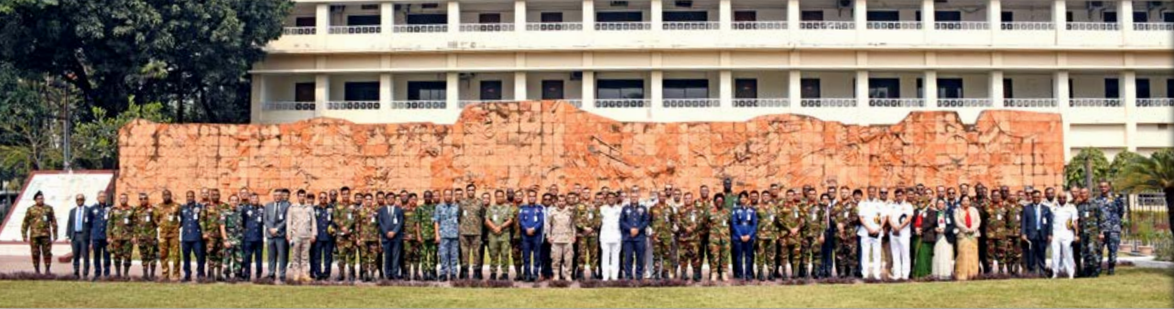
Bijoy Keton Museum 18 February 2024