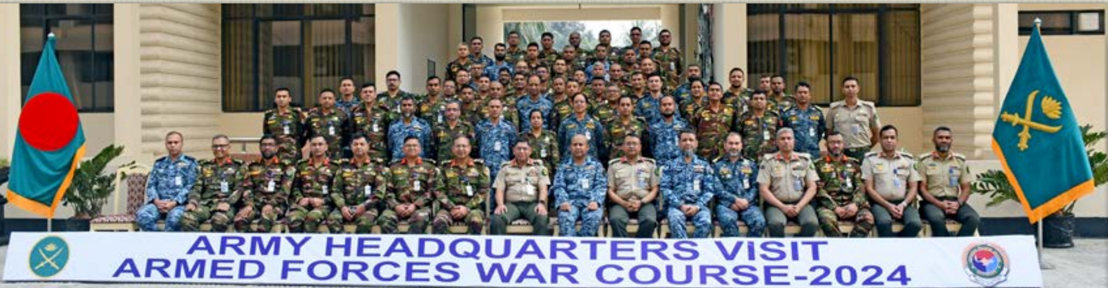
Army Headquarters 15 February 2024