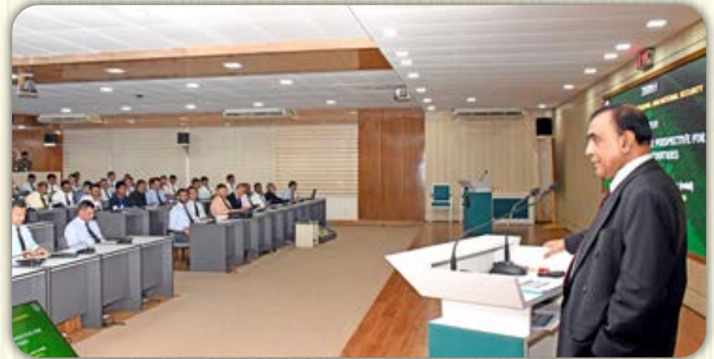
Rear Admiral A.S.M.A Awal, ndc, psc (Retd) Former High Commissioner of Maldives 'Maritime/Sea Power: Perspective for Developing Countries'