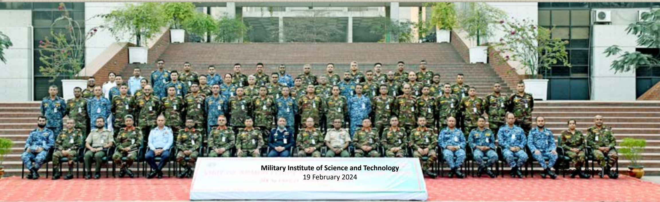
Military Institute of Science and Technology 19 February 2024