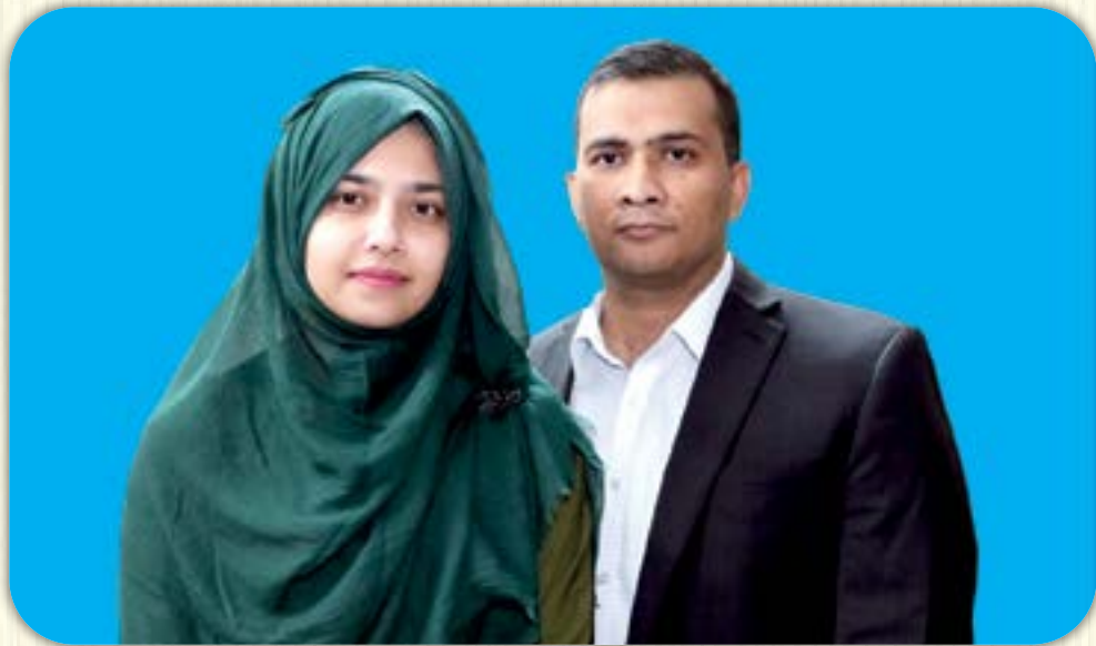
Lt Col Md Tauhidul Islam Bangladesh Army