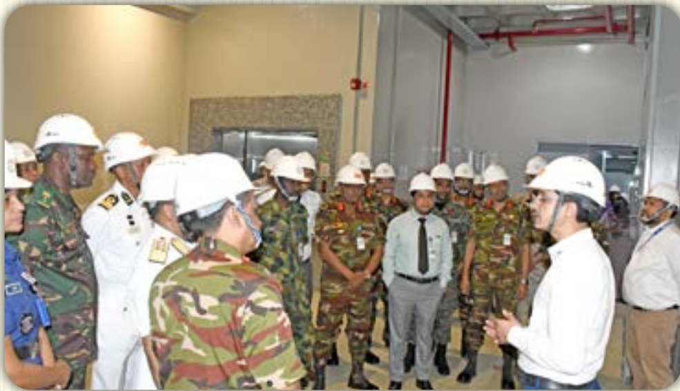
Incepta Pharmaceuticals Limited 20 May 2024