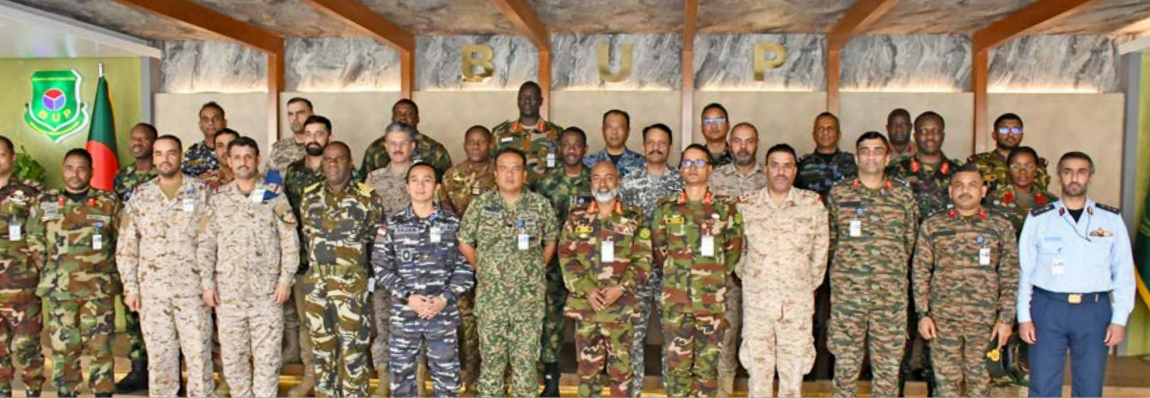
Orientation Visit to Bangladesh University of Professionals (International Course Members) 21 January 2024