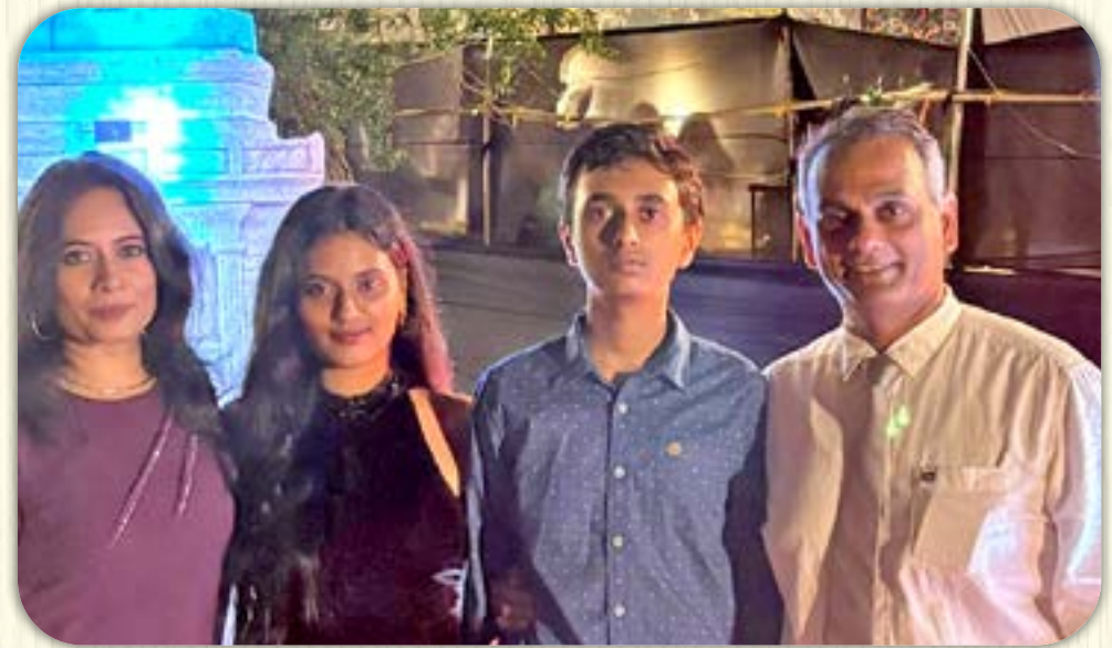
Cmde K Shankar Indian Navy