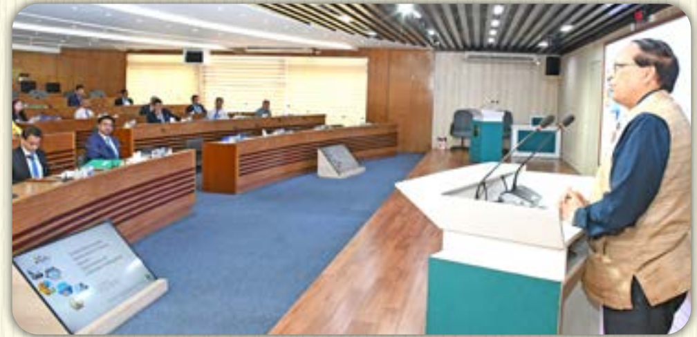
Dr. Atiur Rahman Former Governor, Bangladesh Bank 'Sustainable Economic Development in Present Scenario: Opportunities and Challenges for Bangladesh'