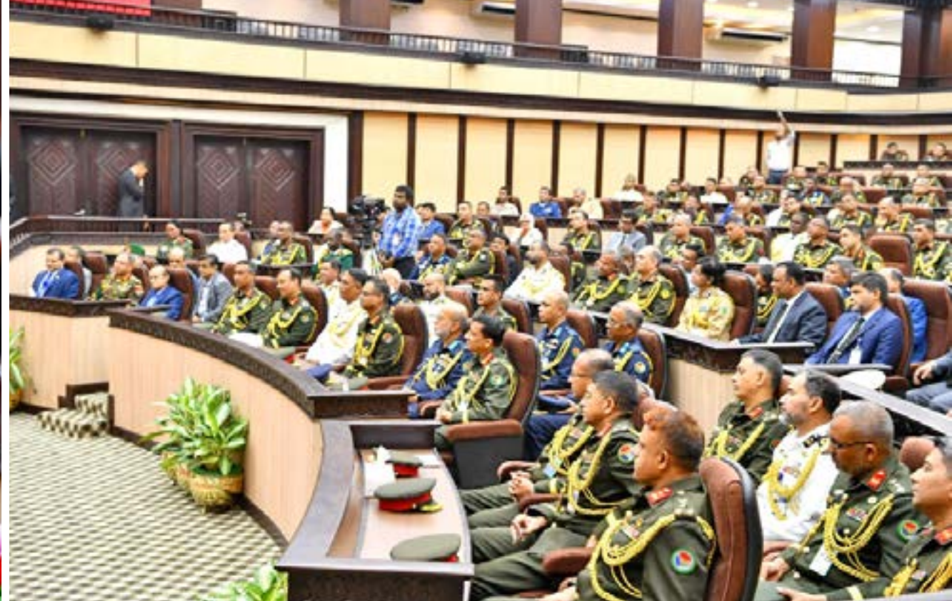
Visit to Chief Advisor's Office on 03 November 2024