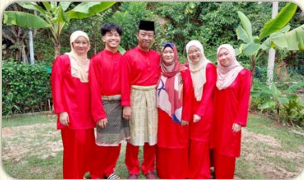
Col Narulnizam bin Razali Malaysia Air Force