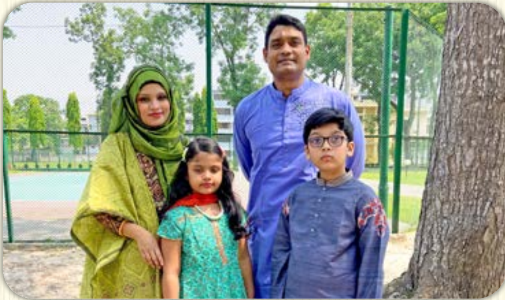
Lt Col Mohammad Akhtaruzzaman Faysal Bangladesh Army