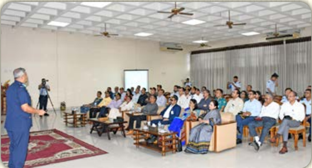
BAF Base Zahurul Haque, Chattogram 21 April 2024