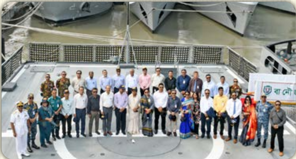
BNS Somudro Bijoy 21 April 2024