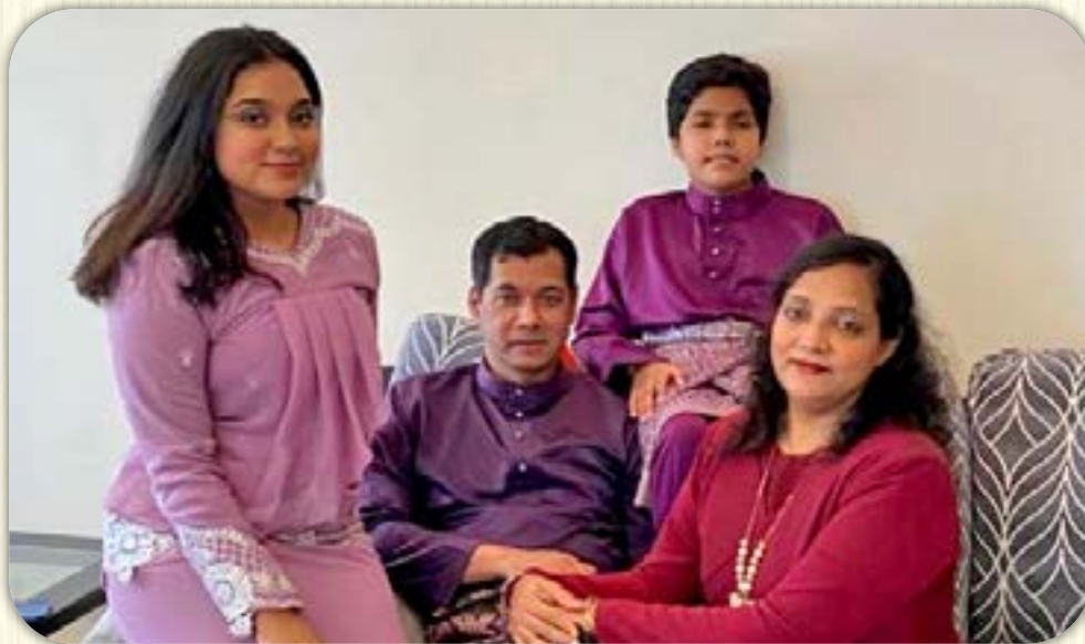
Cdre Mustaque Ahmed Bangladesh Navy