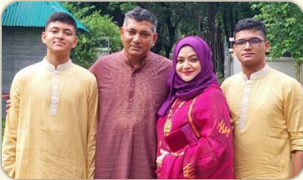
Brig Gen Nishadul Islam Khan Bangladesh Army