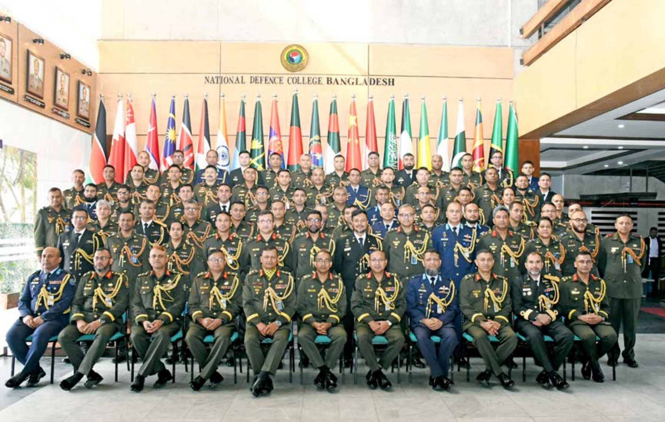
Armed Forces War Course 2024 on 28 January 2024