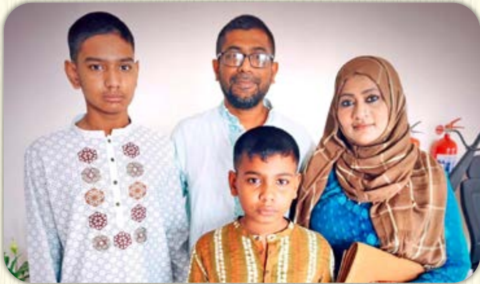
Brig Gen Muhammad Azharul Islam DS (Army) (Outgoing)