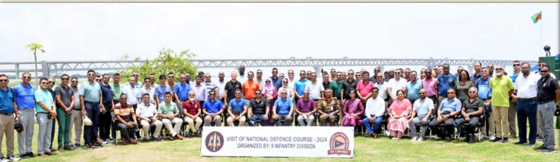
Headquarters 99 Composite Brigade 24 June 2024