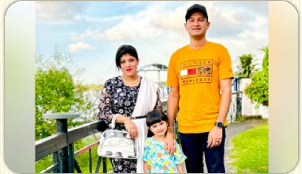
Cdr Tanvir Alam Khan Bangladesh Navy