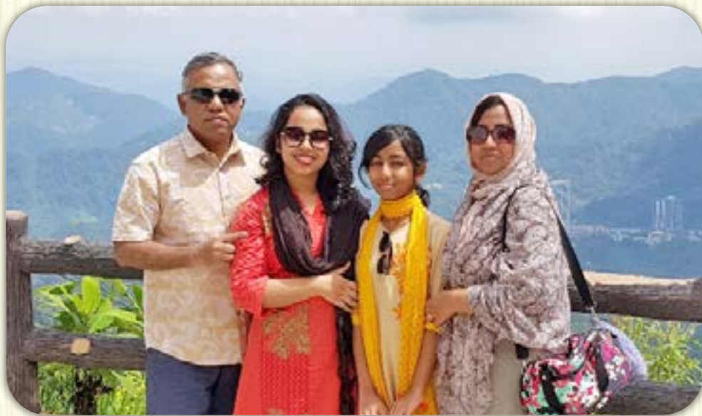
Air Cdre Mahmud Mehedi Hussain Bangladesh Air Force