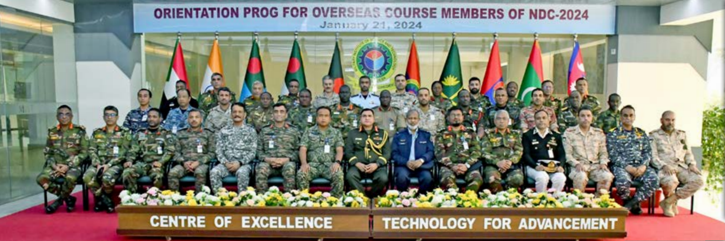
Orientation Visit to Military Institute of Science & Technology (International Course Members) 21 January 2024