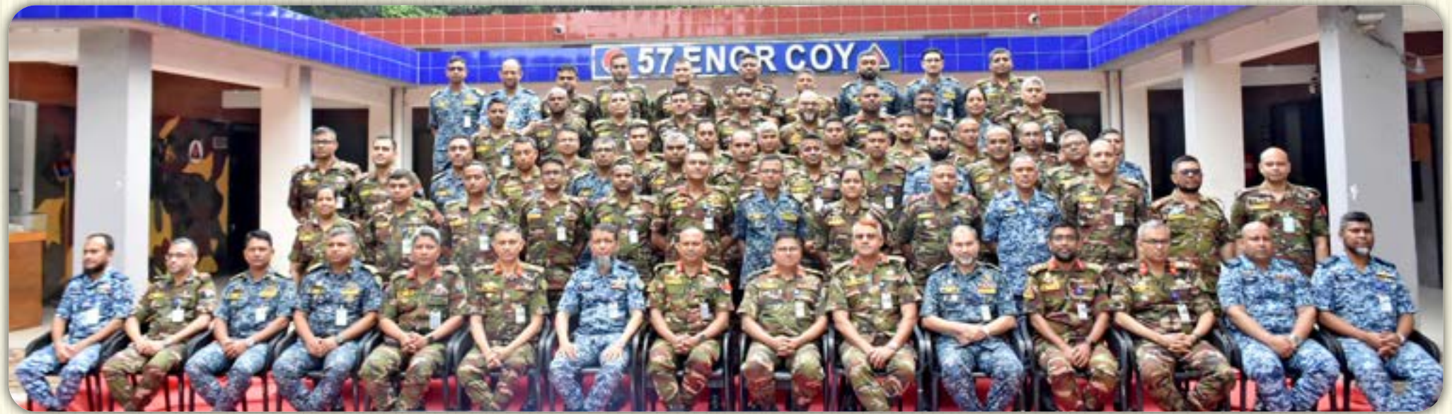
Headquarters 14 Independent Engineering Brigade 19 May 2024