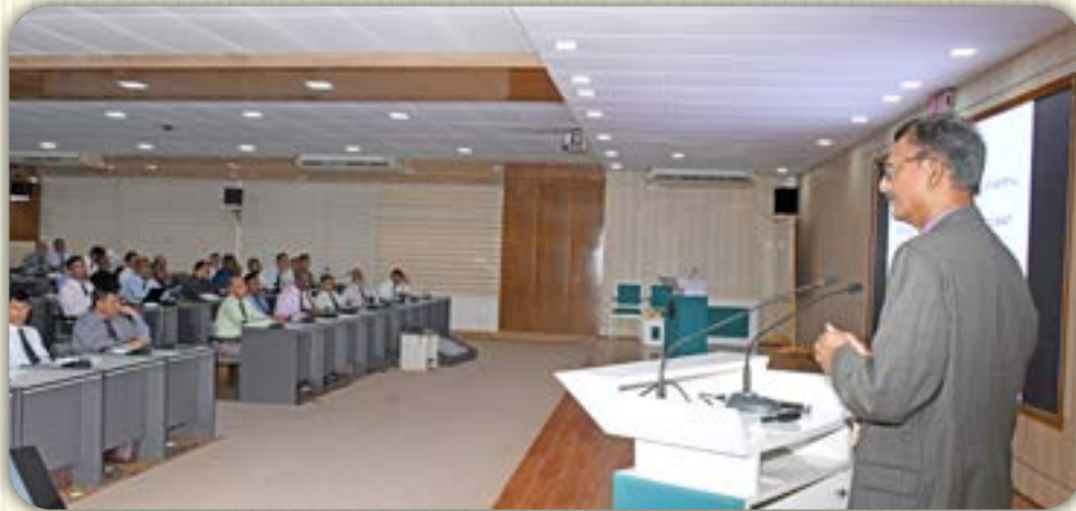
Ambassador Md Touhid Hossain, ndc Former Foreign Secretary (Now Foreign Affairs Adviser to the Interim Government) 'South Asia: Regional and International Security Setting and Its impact on Bangladesh'