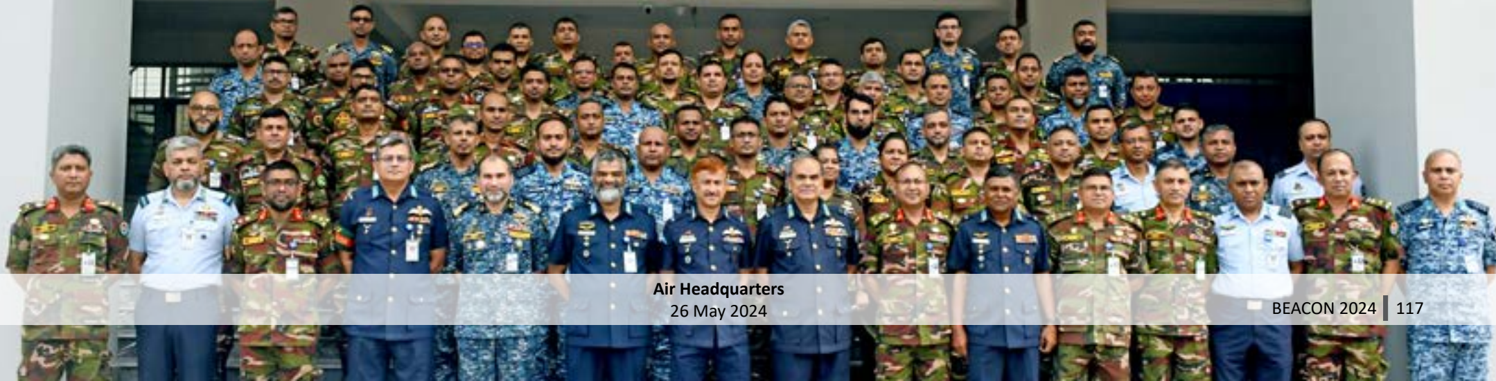
Air Headquarters 26 May 2024