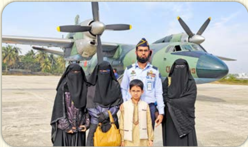
Gp Capt Md Haroon-ur-Rashid Bangladesh Air Force