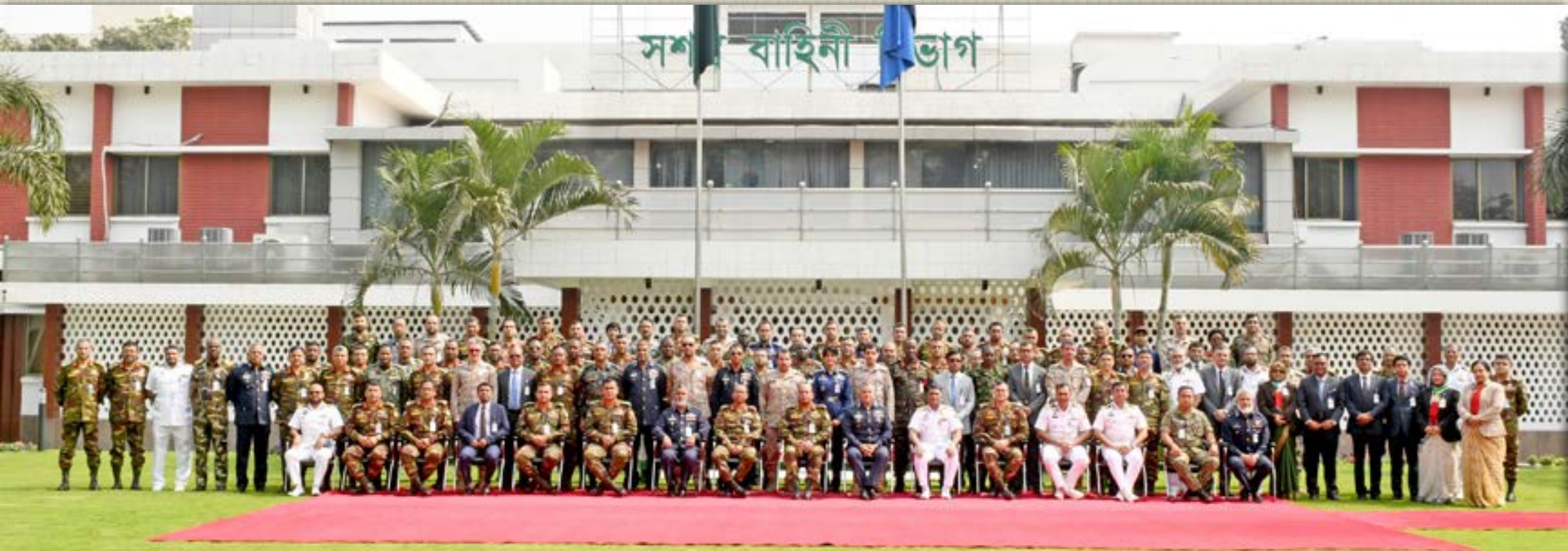
Armed Forces Division 18 February 2024