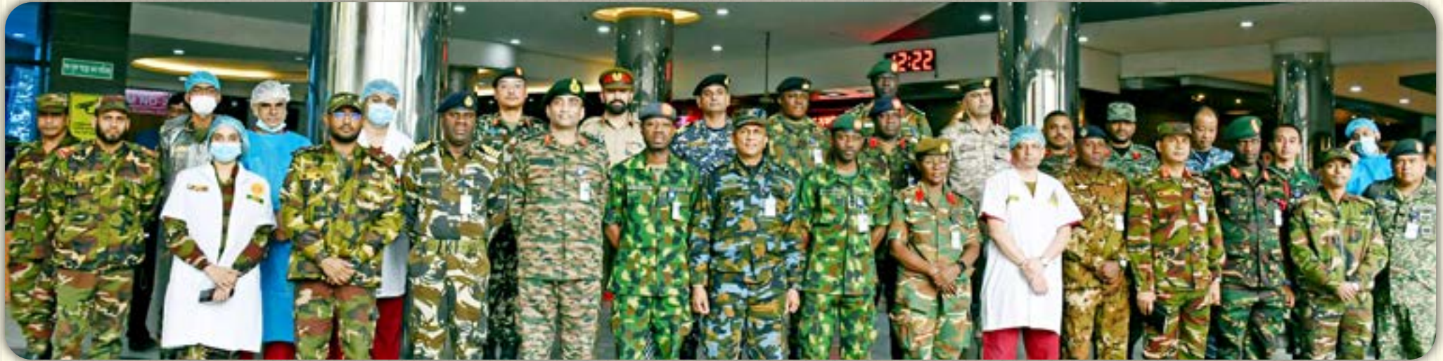
Orientation Visit to Combined Military Hospital (International Course Members) 15 January 2024