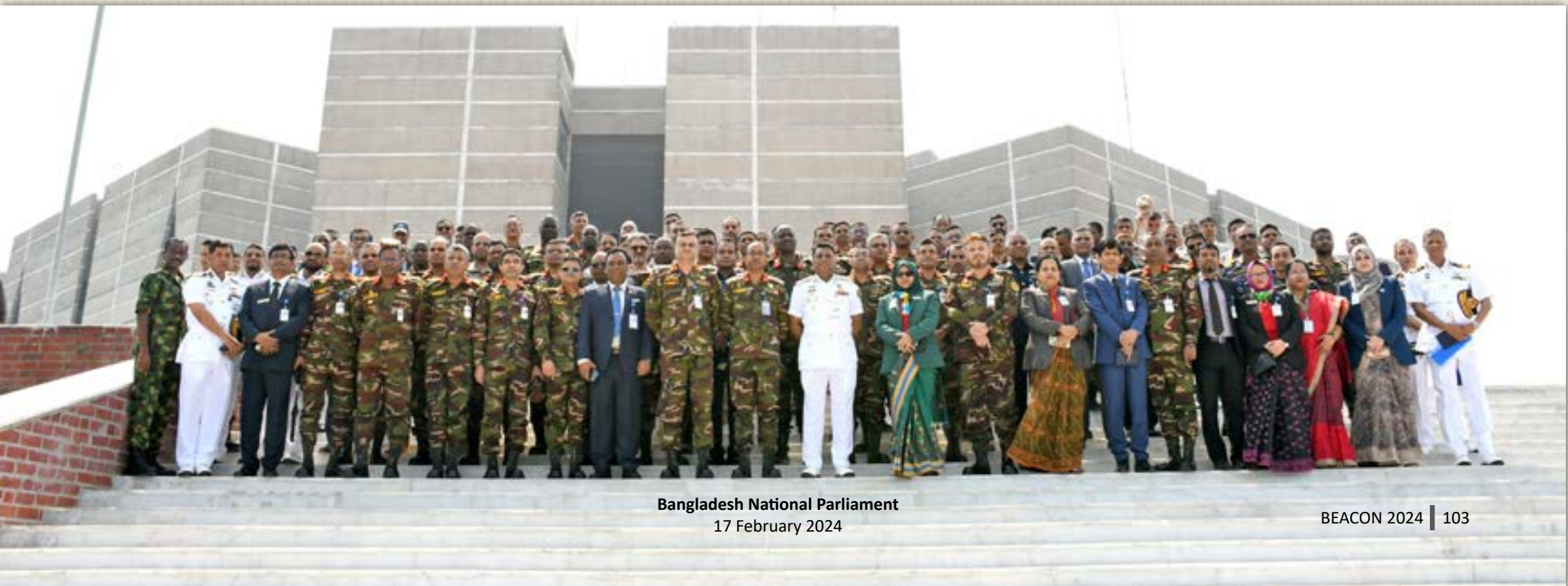
Bangladesh National Parliament 17 February 2024