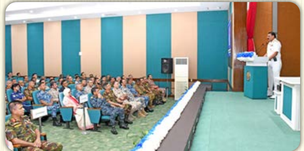
Admiral Dinesh Tripathi, PVSM, AVSM, NM Chief of Naval Staff, Indian Navy 'An Opportunity Lecture'