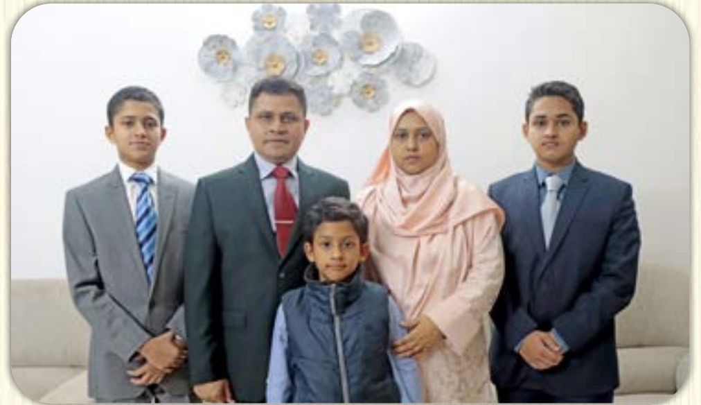
Brig Gen Sahidur Rahman Osmani Bangladesh Army