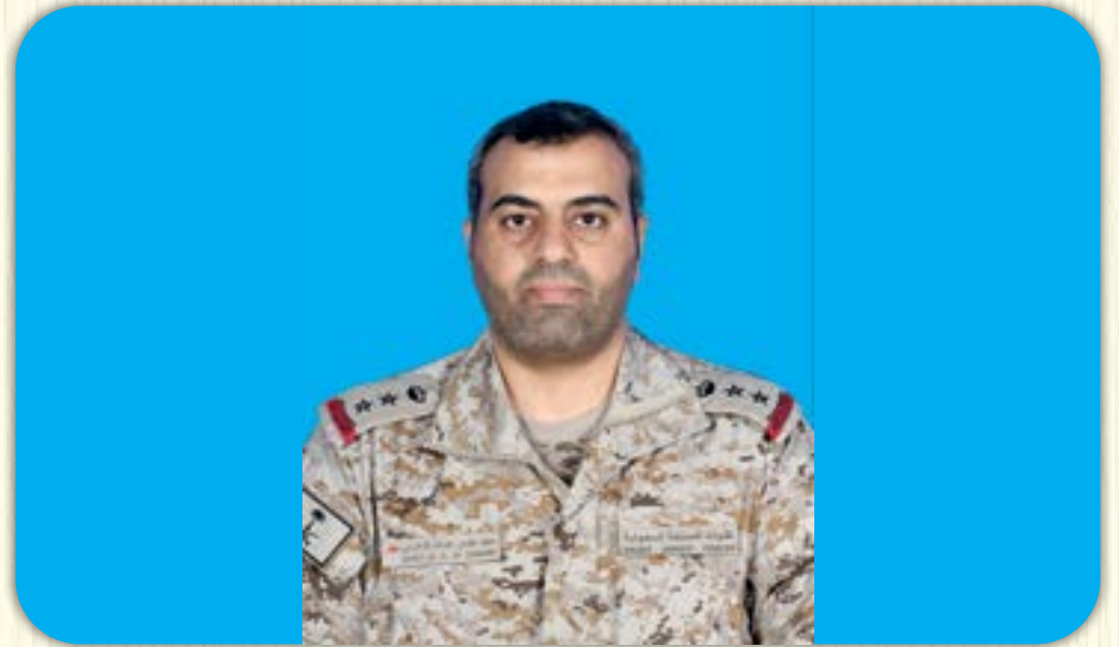
Staff Col Saeed Othman Al-Darami Royal Saudi Armed Forces