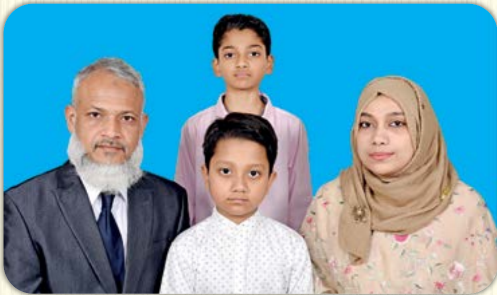
Air Cdre M Neyamul Kabir Bangladesh Air Force