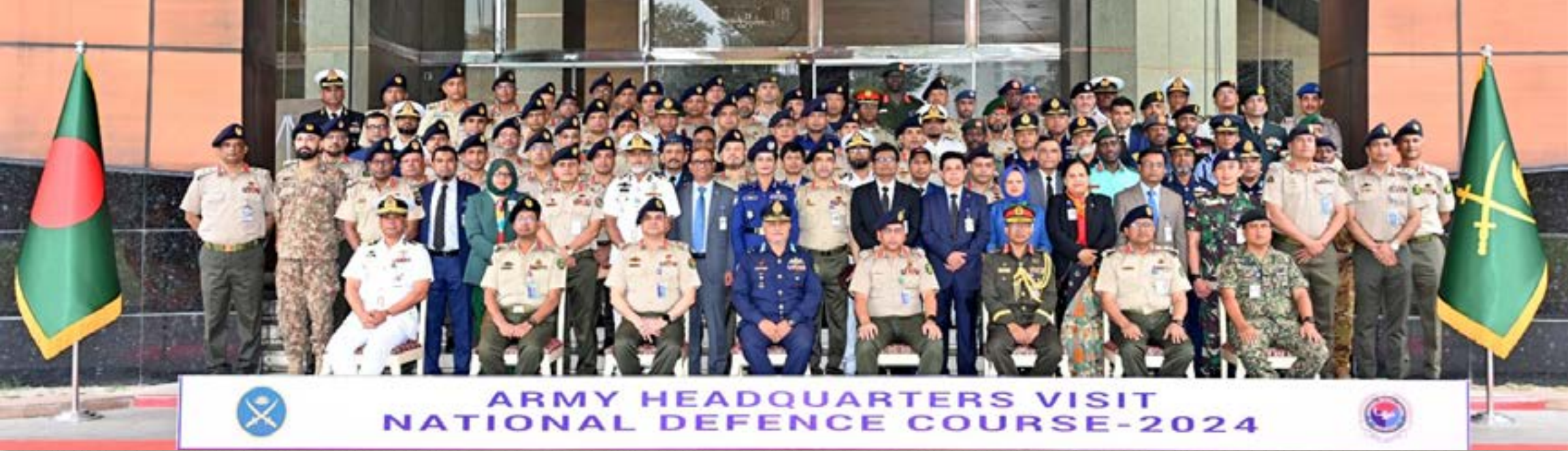
Army Headquarters 22 February 2024