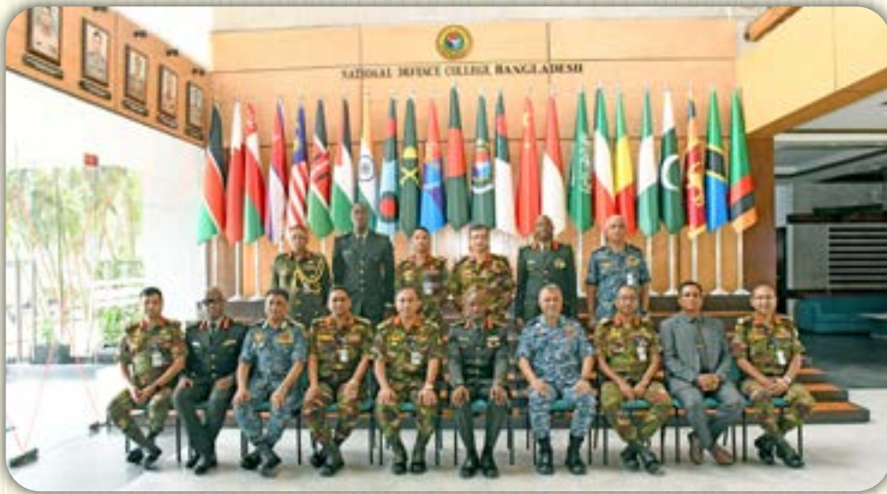
General MK Mubarakh , fndu, psc (Z) Chief of Defence Staff, Rwanda Defence Forces 12 June 2024