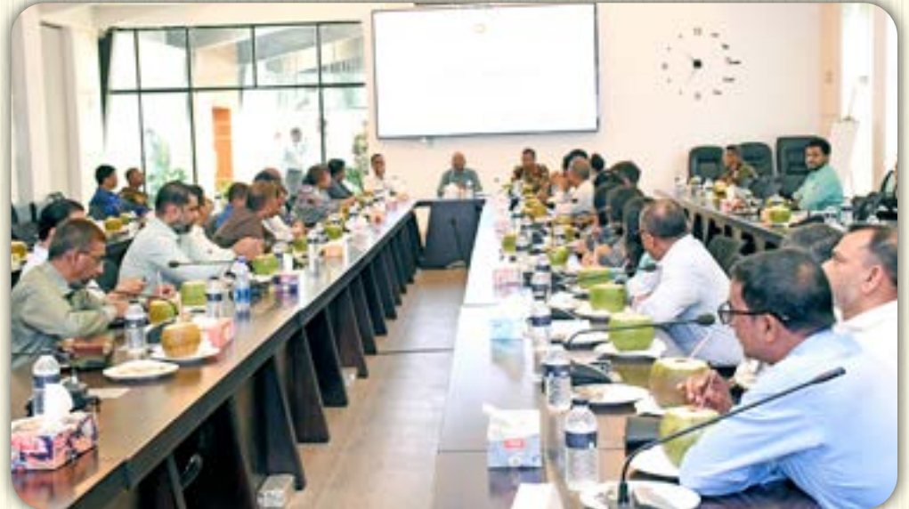
Office of the Refugee Relief and Repatriation Commissioner (RRRC) 24 April 2024