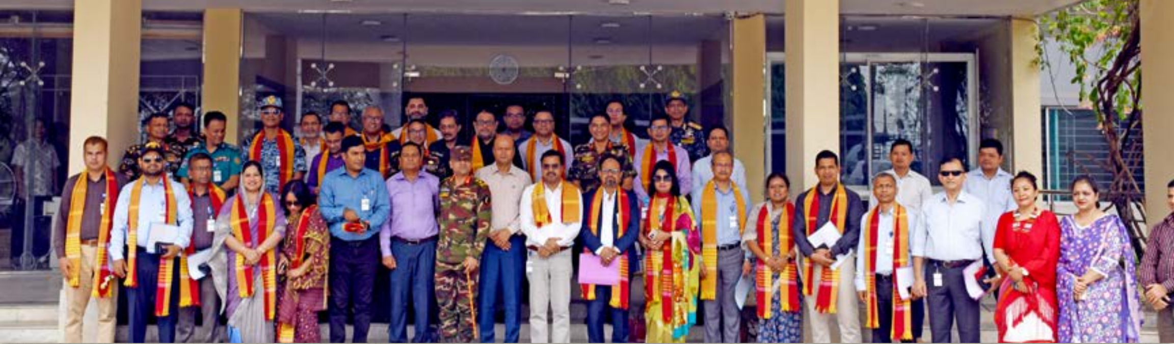
Chittagong Hill Tracts Development Board 22 April 2024