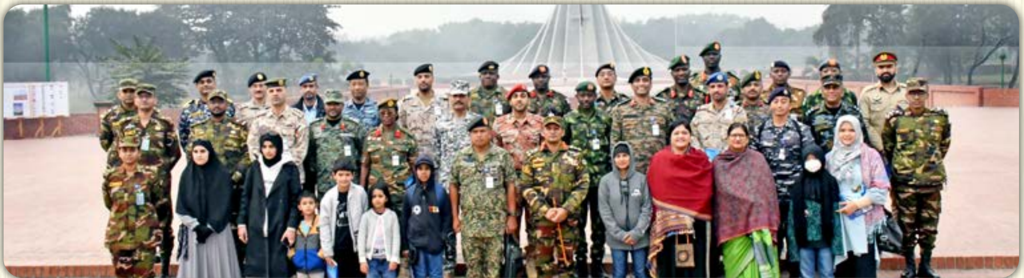
Orientation Visit to National Memorial at Savar (International Course Members) 18 January 2024