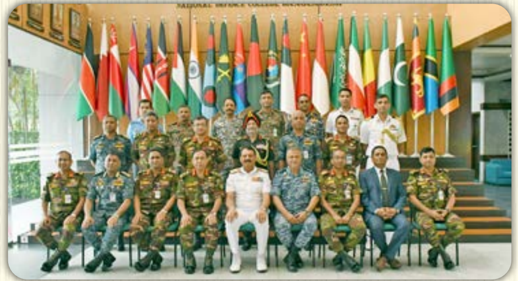
Admiral Dinesh Tripathi , PVSM, AVSM, NM Chief of Naval Staff, Indian Navy 02 July 2024