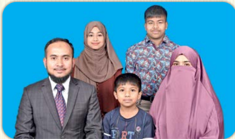
Gp Capt Salahuddin Ahmed Bangladesh Air Force