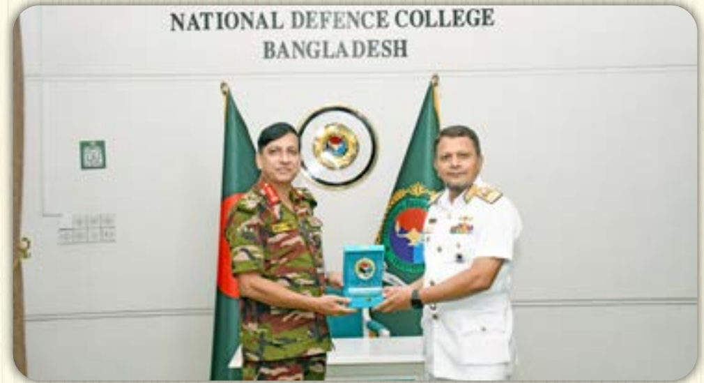
Admiral M Nazmul Hassan, OSP, NPP, ndc, ncc, psc Chief of Naval Staff, Bangladesh Navy 20 October 2024