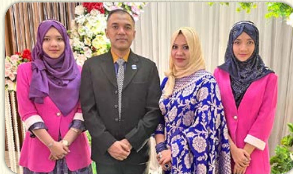
Wg Cdr A K M Solaiman Bangladesh Air Force