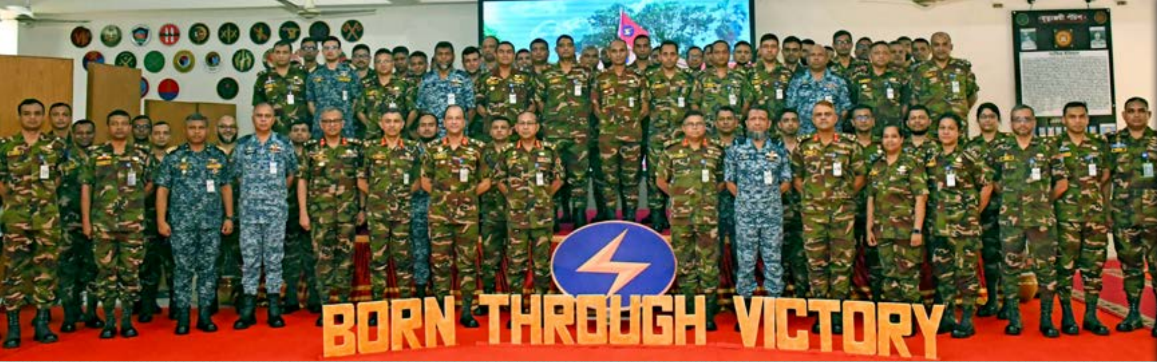
Headquarters 46 Independent Infantry Brigade 15 May 2024