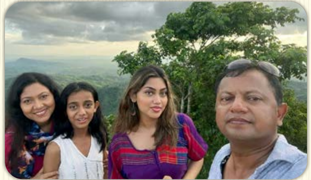
Air Cdre Md Enamul Karim Bangladesh Air Force