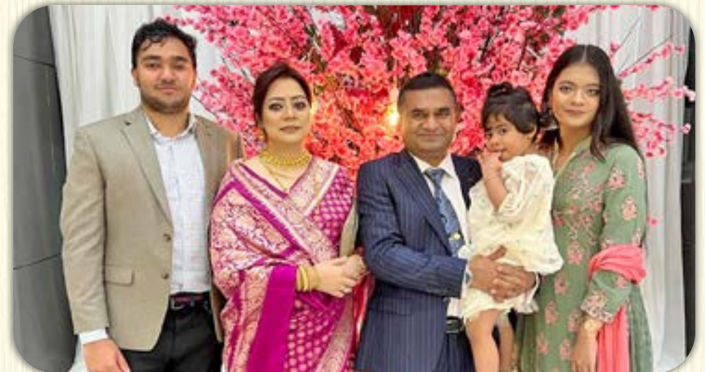
Maj Gen AKM Aminul Haque SDS (Army) (Outgoing)