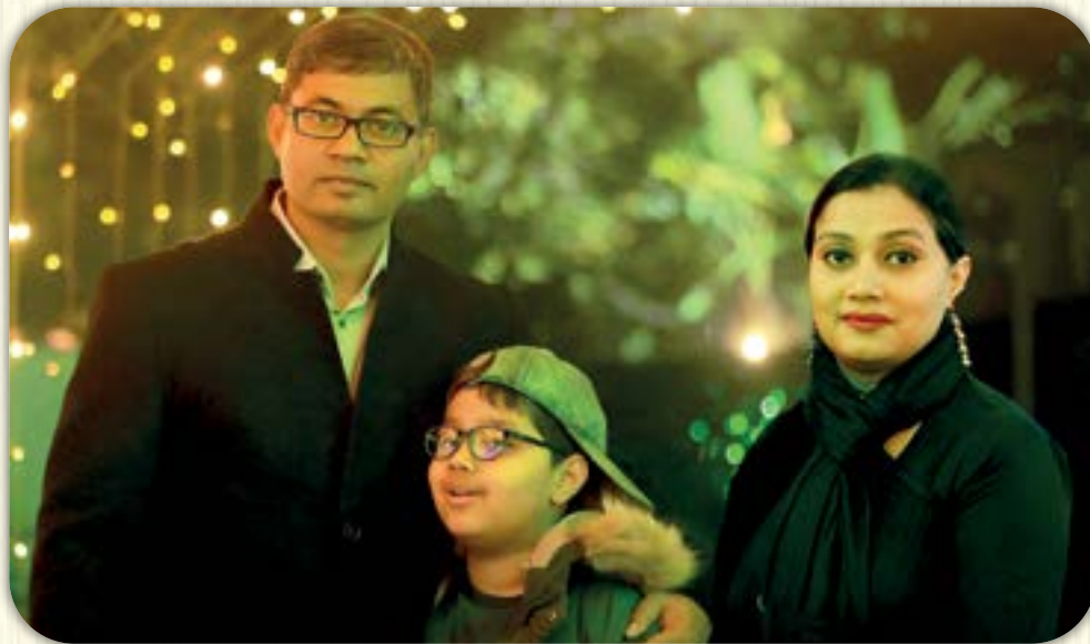
Lt Col Muhammad Rashedul Islam Bangladesh Army