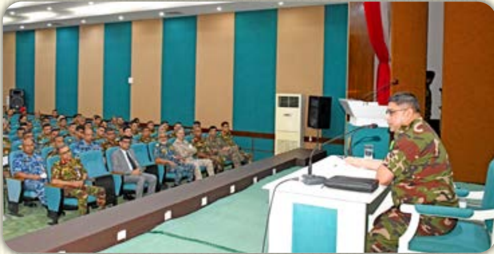
General Waker-Uz-Zaman, SBP, OSP, SGP, psc Chief of Army Staff, Bangladesh Army 'Keynote Speech on Bangladesh Army'