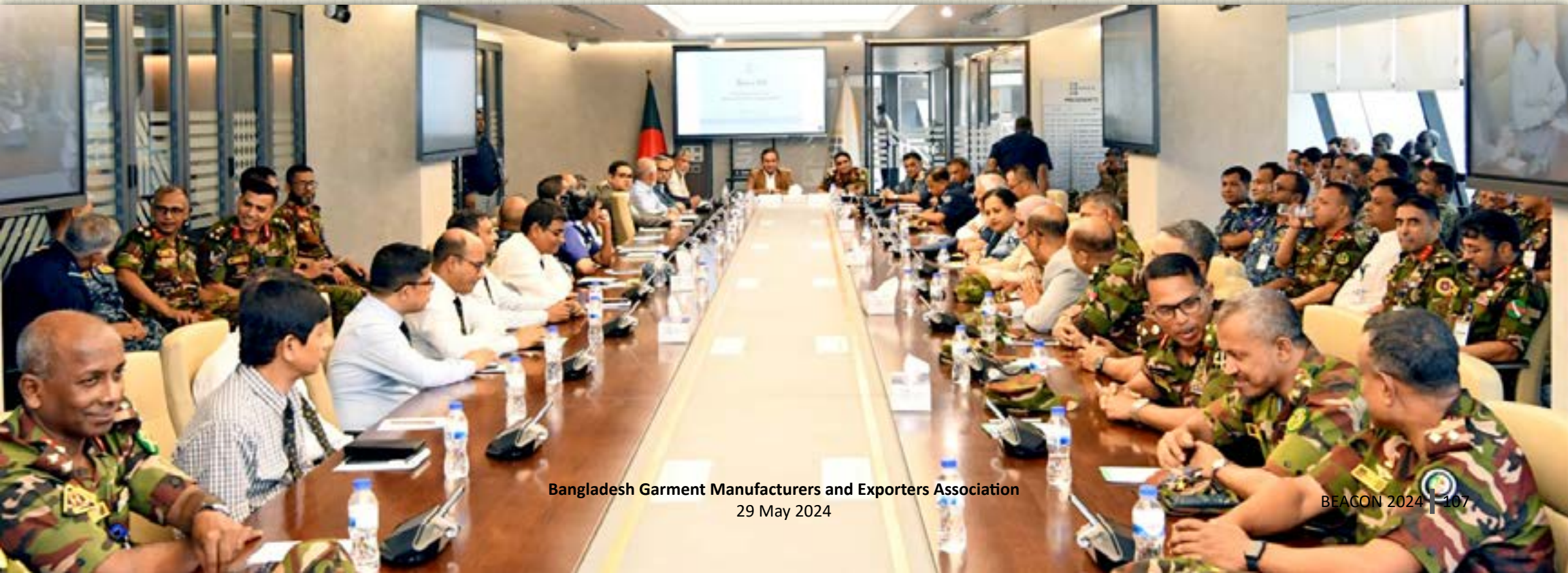
Bangladesh Garment Manufacturers and Exporters Association 29 May 2024