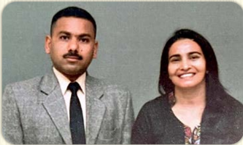
Brig Alok Dash Indian Army