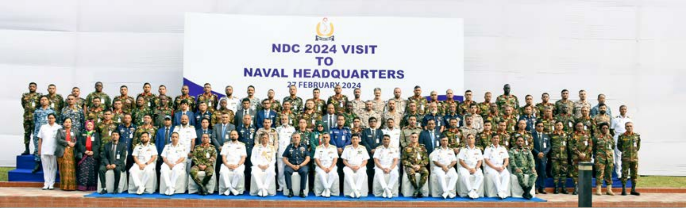
Naval Headquarters 17 February 2024