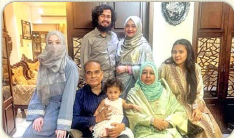
AVM Muhammad Kamrul Islam SDS (Air) (Outgoing)