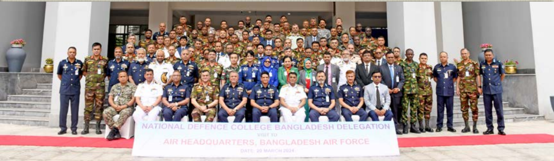
Air Headquarters 20 March 2024