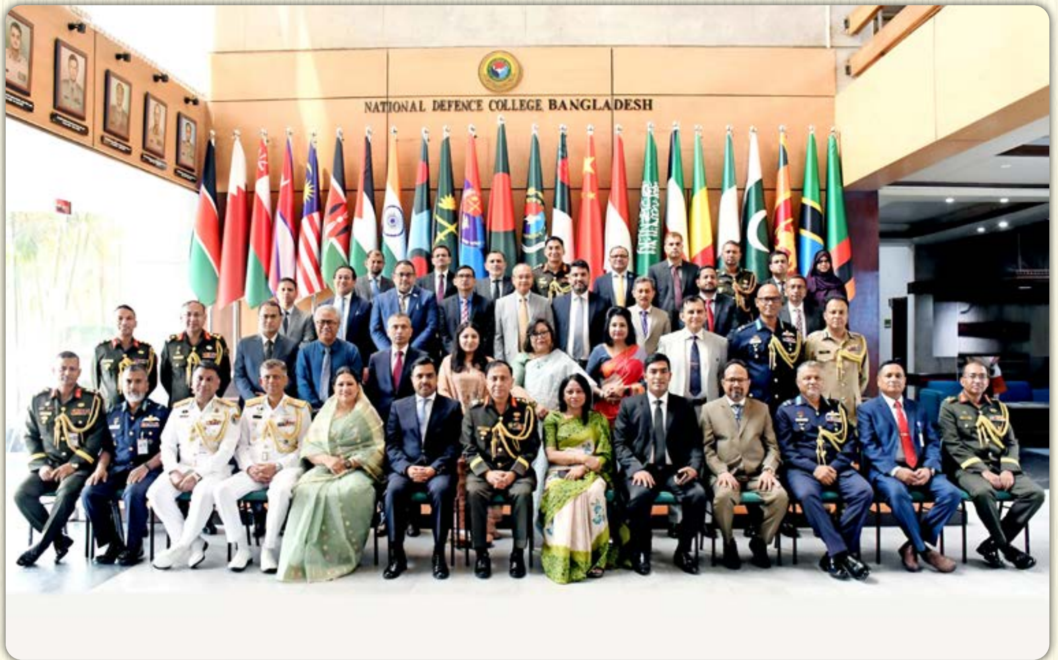
Capstone Course 2024-1 on 22 April 2024