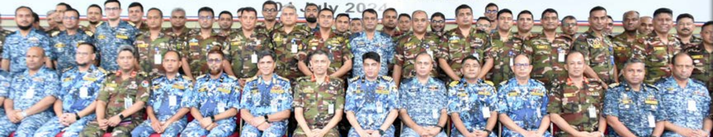
Bangladesh Coast Guard Headquarters 04 July 2024