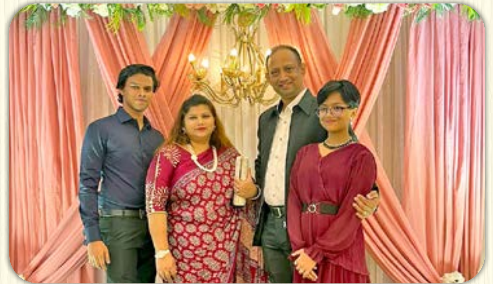
Gp Capt Mirza Nazmul Kabir Bangladesh Air Force