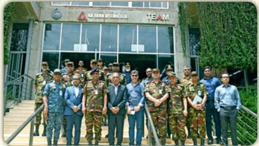
4A Yarn Dyeing Limited 29 May 2024