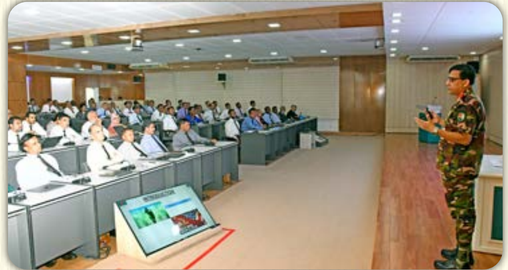
Lieutenant General Mohammad Shaheenul Haque, OSP, BSP, ndc, hdmc, psc Commandant NDC 'Land Power: Developing Country's Perspective'