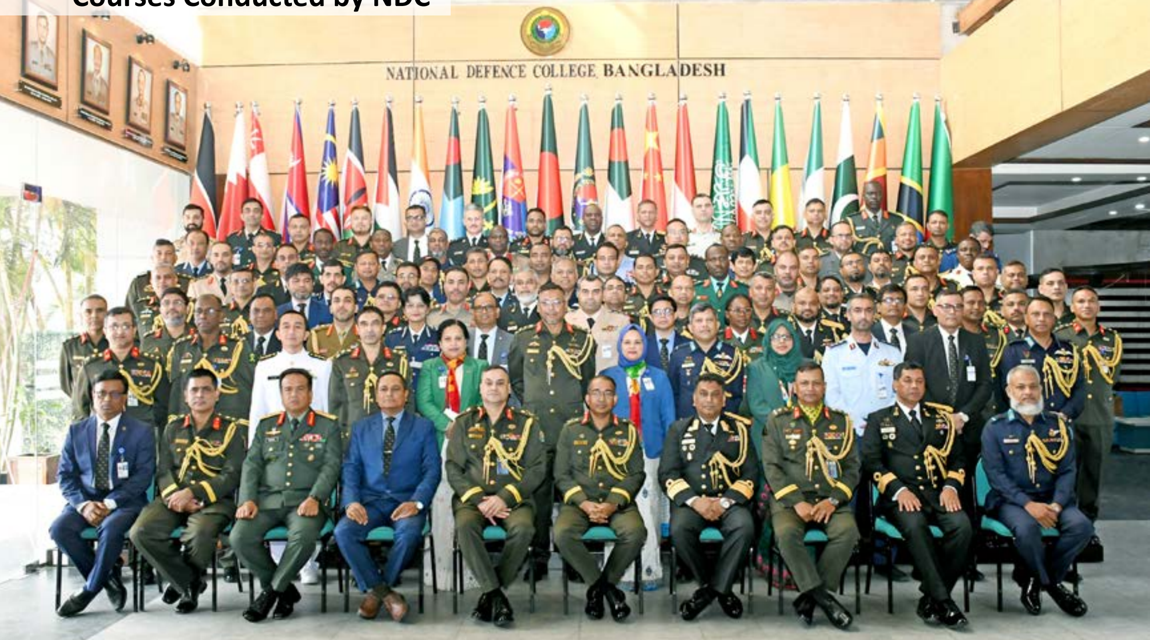
National Defence Course 2024 on 28 January 2024