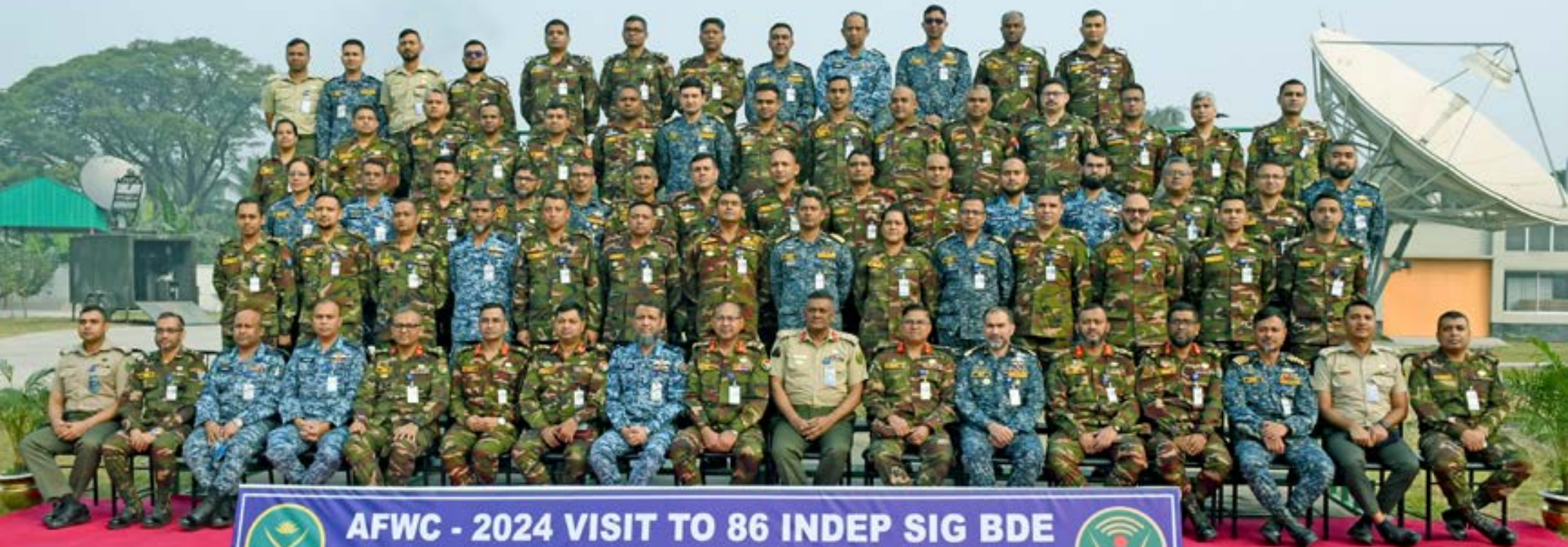
Headquarters 86 Independent Signal Brigade 15 February 2024