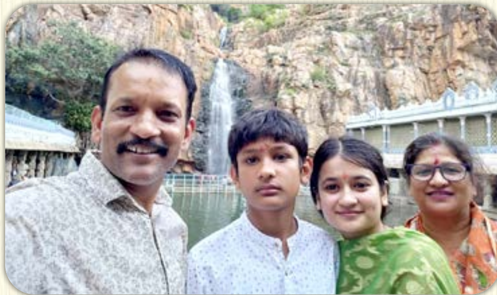
Air Cmde Suresh Kumar Tiwari Indian Air Force