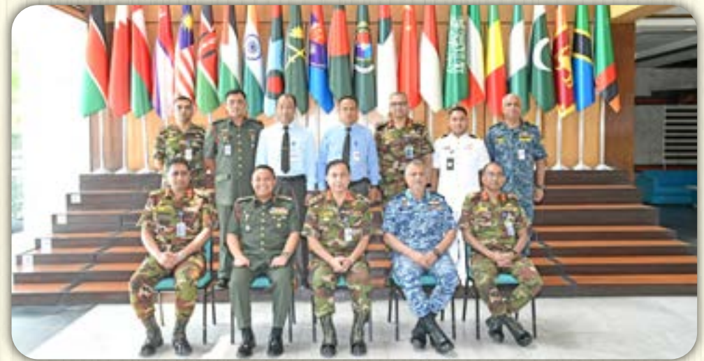
Major General Dato Haji Noorul Bin Azril Areffin, ndc Delegation of Malaysian Armed Forces 23 April 2024