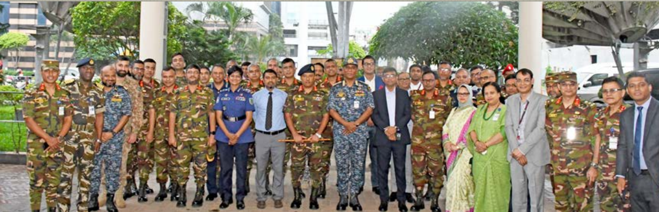
Jamuna Television 24 October 2024