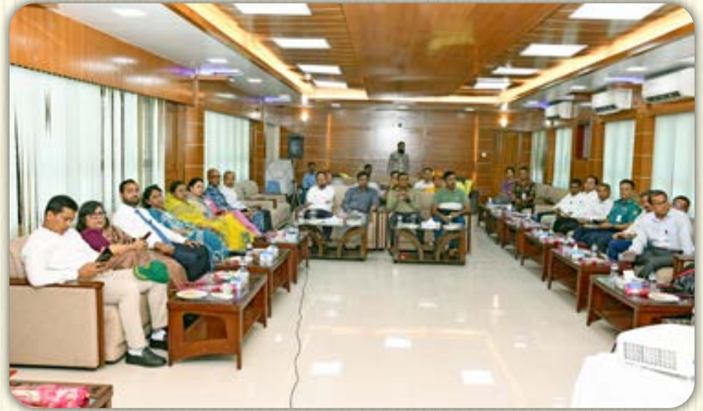
Office of the Deputy Commissioner, Cox's Bazar 25 April 2024