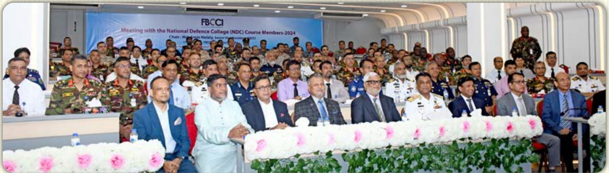
Federation of Bangladesh Chambers of Commerce and Industry 17 April 2024