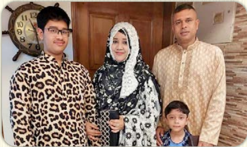
Brig Gen Syed Fazle Gaus Bangladesh Army