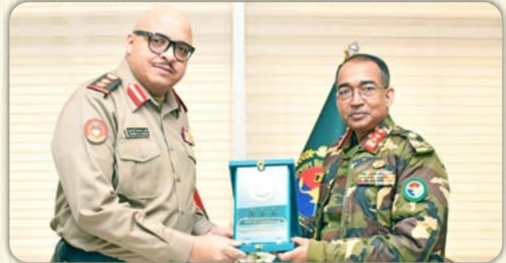
Colonel Thameer Mohammed Al-Saeed

Defence Attache of the Embassy of the People's Republic of China in Bangladesh 17 January 2024