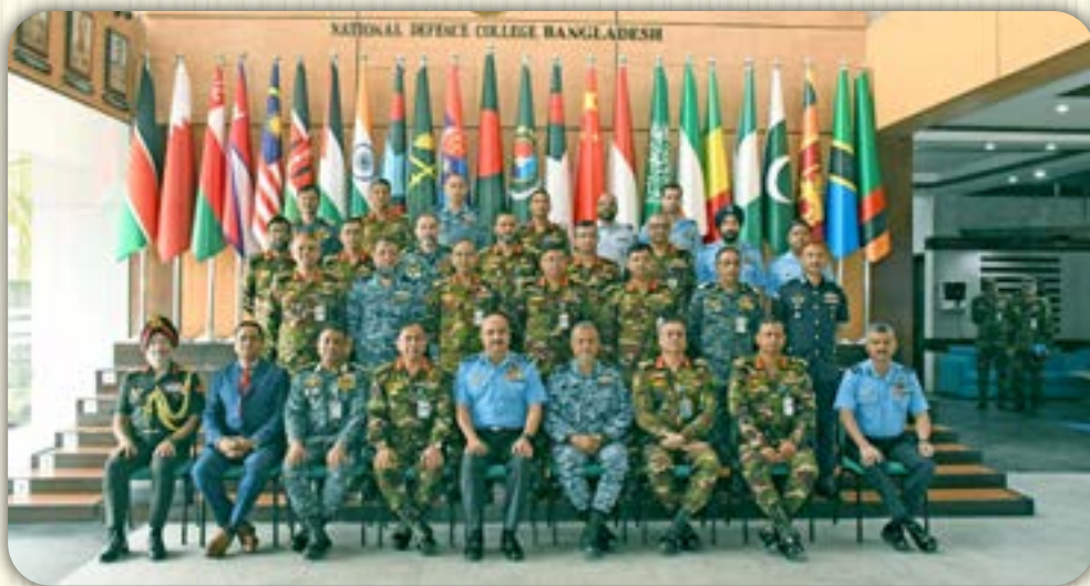
Air Chief Marshal VR Chaudhari, PVSM, AVSM, VM, ADC

Assistant Defence Attache, Embassy of the State of Kuwait in Bangladesh 24 January 2024