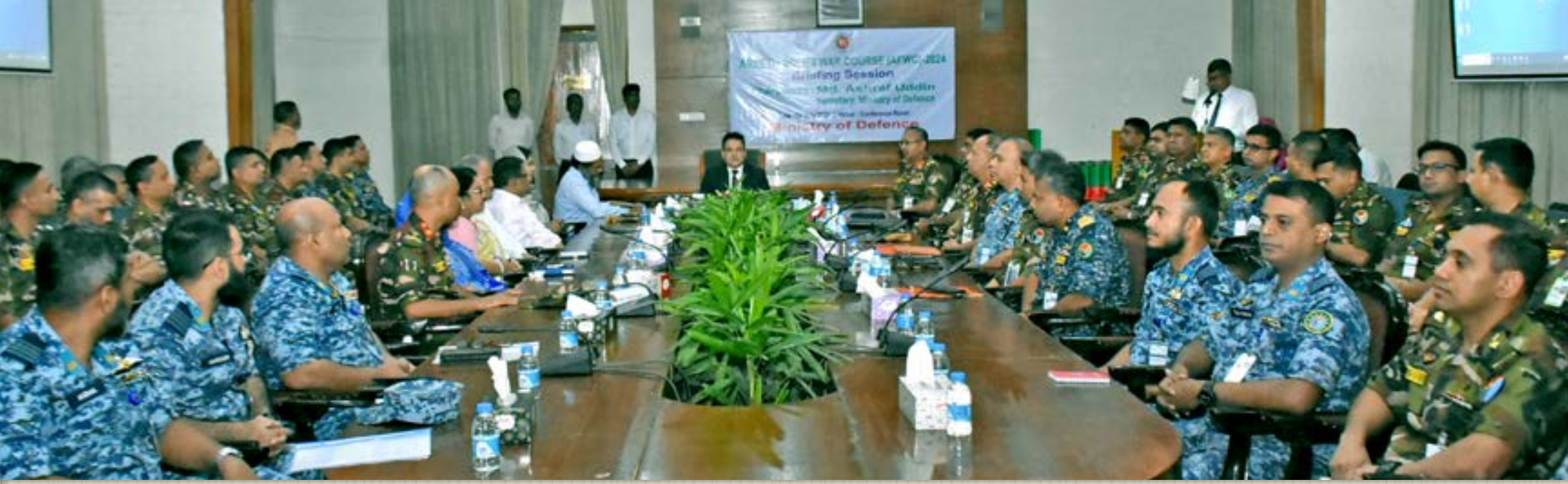
Ministry of Defence 04 July 2024