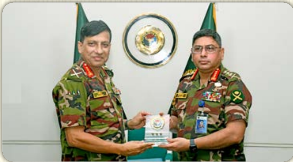
General Waker-Uz-Zaman, SBP, OSP, SGP, psc Chief of Army Staff, Bangladesh Army 06 November 2024