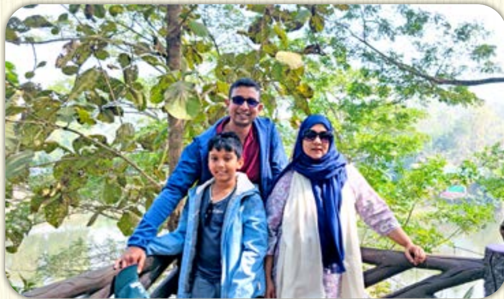
Capt A K M Bodrul Qadir Bangladesh Navy