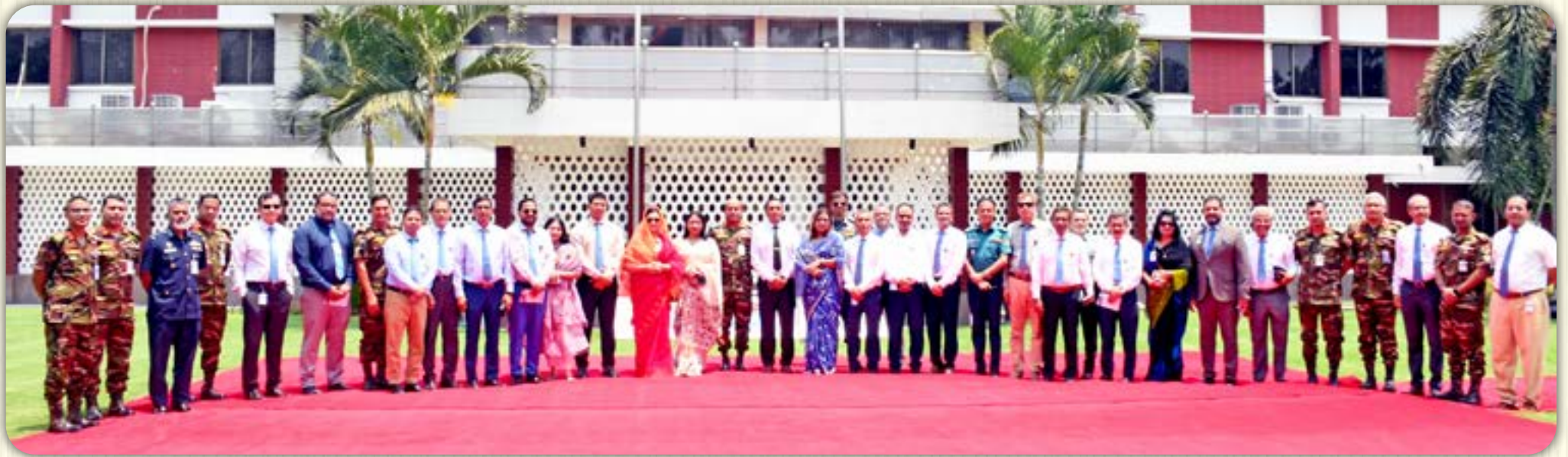
Armed Forces Division 30 April 2024