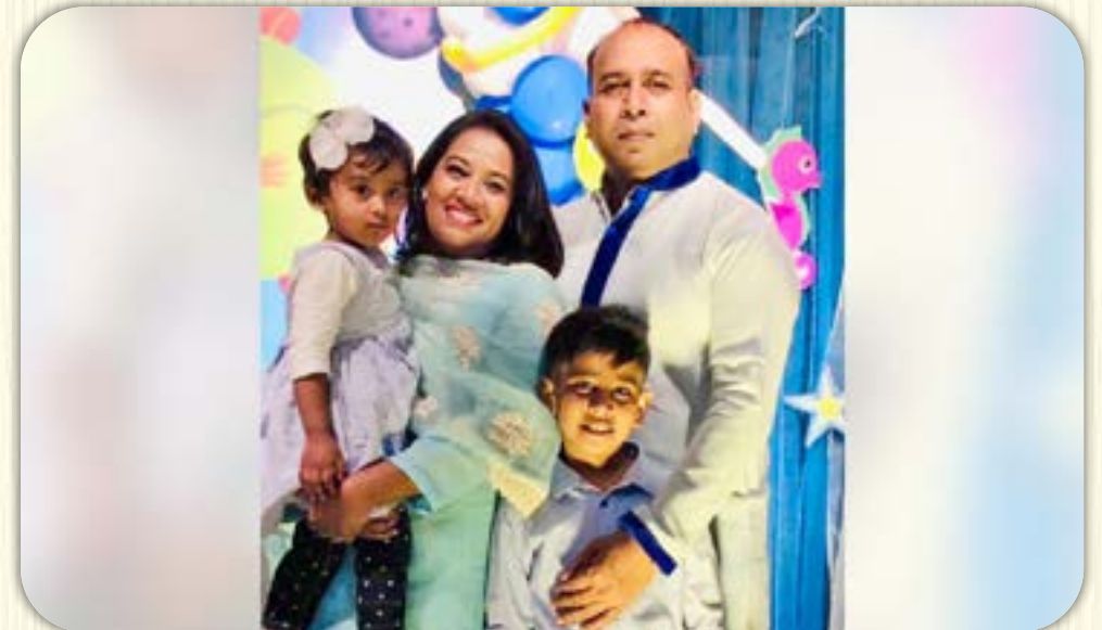
Lt Col Farzana Shakil Bangladesh Army