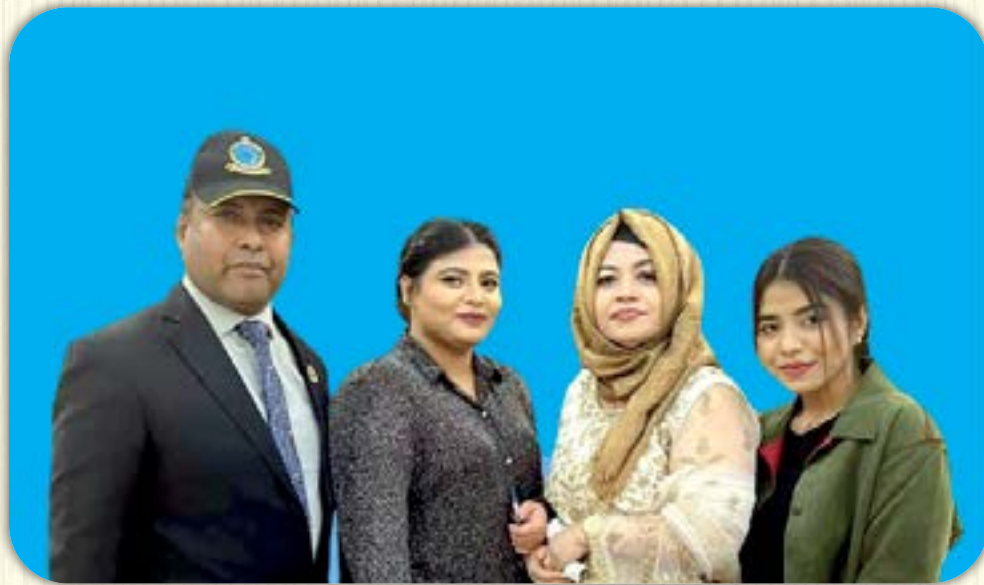
Gp Capt Mohammad Rabiul Islam Bangladesh Air Force