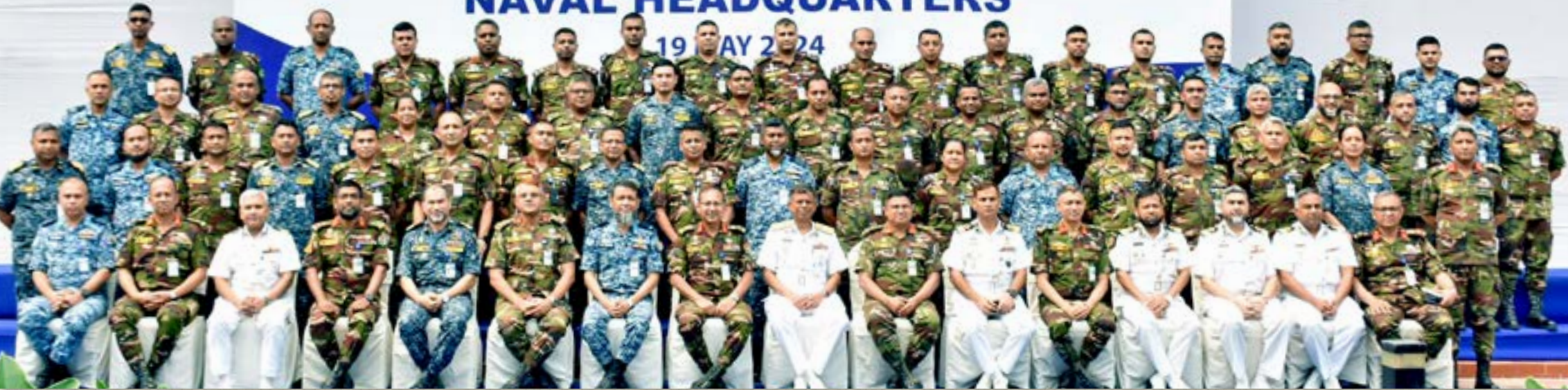
Naval Headquarters 19 May 2024