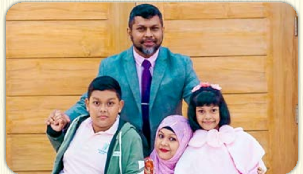
Gp Capt Nazmul Huda Bangladesh Air Force