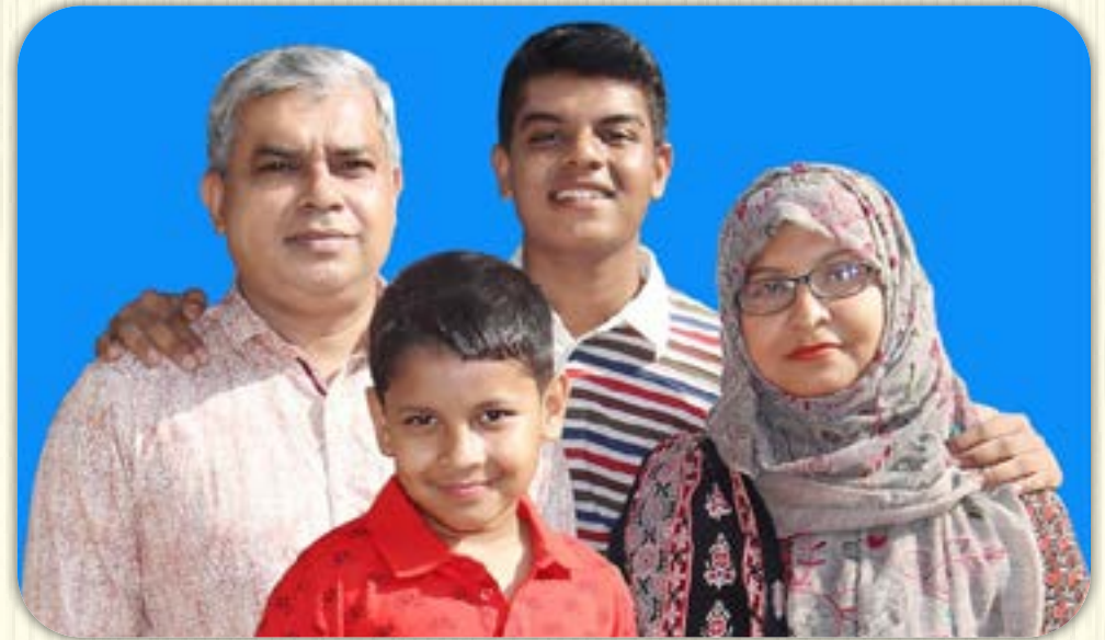
Brig Gen K M Azad Bangladesh Army