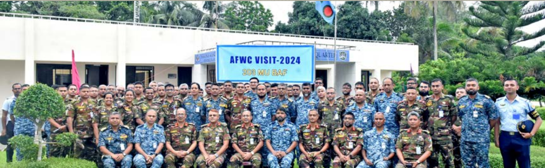
203 Maintenance Unit, BAF 16 July 2024