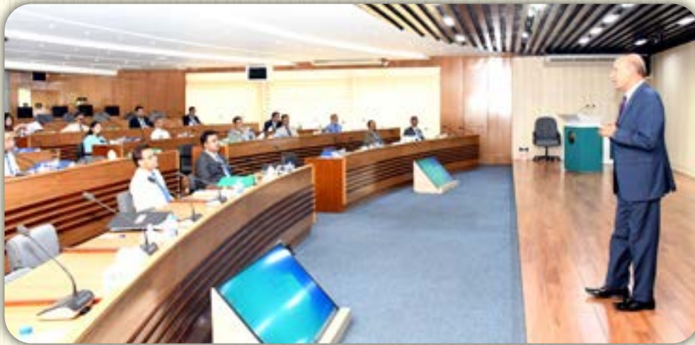
Lieutenant Colonel Quazi Sajjad Ali Zahir, BP (Retd) 'Liberation War of Bangladesh 1971: Resistance, Resilience and Redemption'