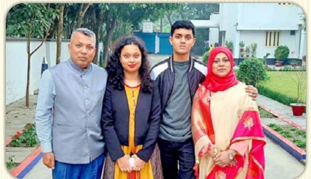
Brig Gen Mozammel Hossain Bangladesh Army