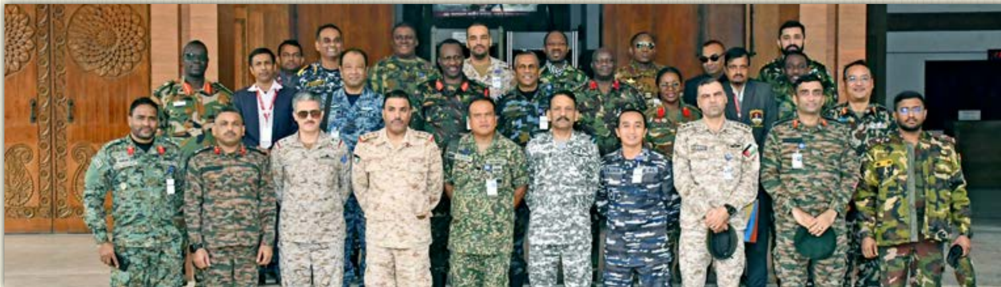
Orientation Visit to Bangladesh National Museum (International Course Members) 23 January 2024