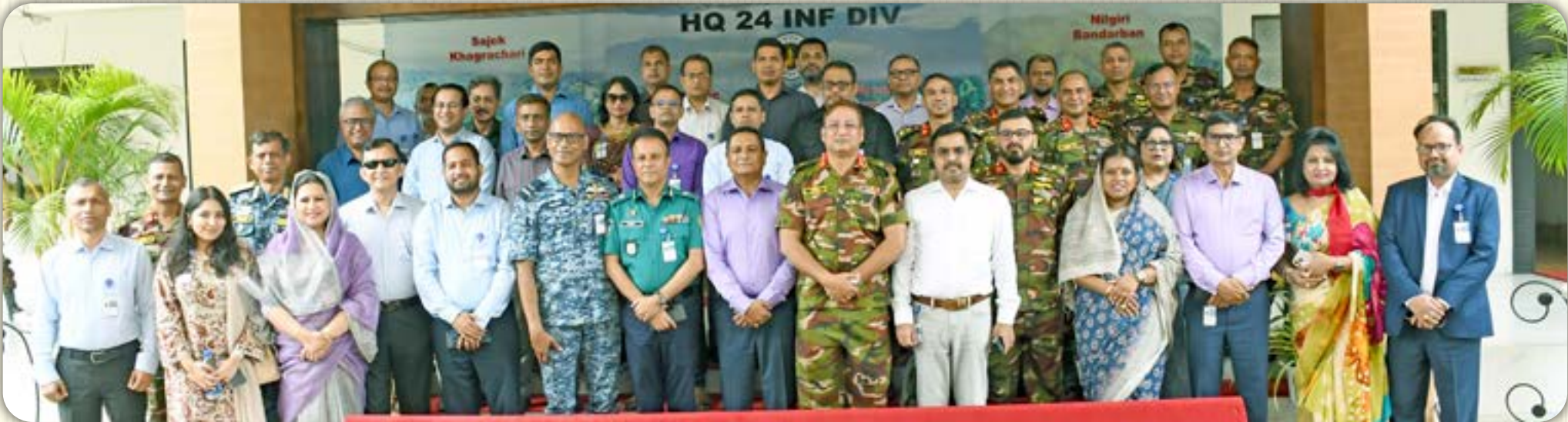
Headquarters 24 Infantry Division 22 April 2024