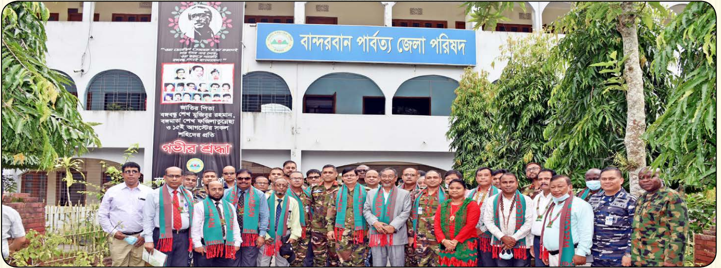
Course Members of National Defence Course 2021 visited Bandarban Hill District Council.