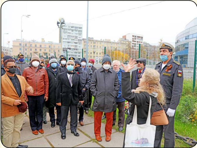
ND Course-2021 visiting delegation (Group-1) at Russia during Overseas Study Tour.