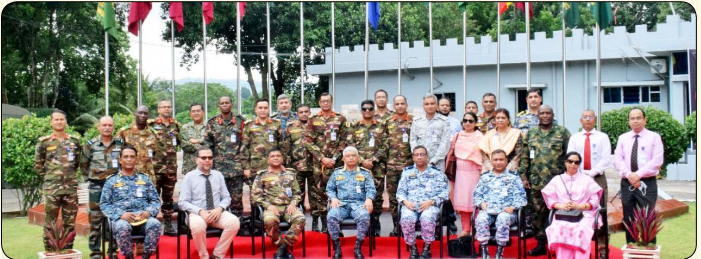
Course Members of National Defence Course 2021 visited HQ 69 Infantry Brigade at Khagrachari.