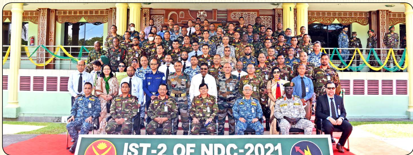
Course Members of National Defence Course 2021 visited HQ 24 Infantry Division at Chattogram.

As part of course curricula Course Members of ND Course 2021, Faculty Members & Staff Officers visited various Armed Forces and Civil installations during the study tour (21-26 August 2021). The visit included Chattogram Area, Bandarban, Khagrachari & Rangamati Hill District and Cox's Bazar Area.