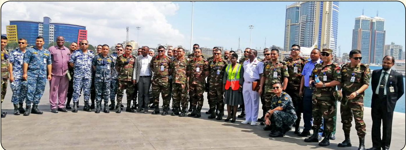
Armed Forces War Course-2021 visiting delegation (Group-1) at Tanzania during Overseas Study Tour.