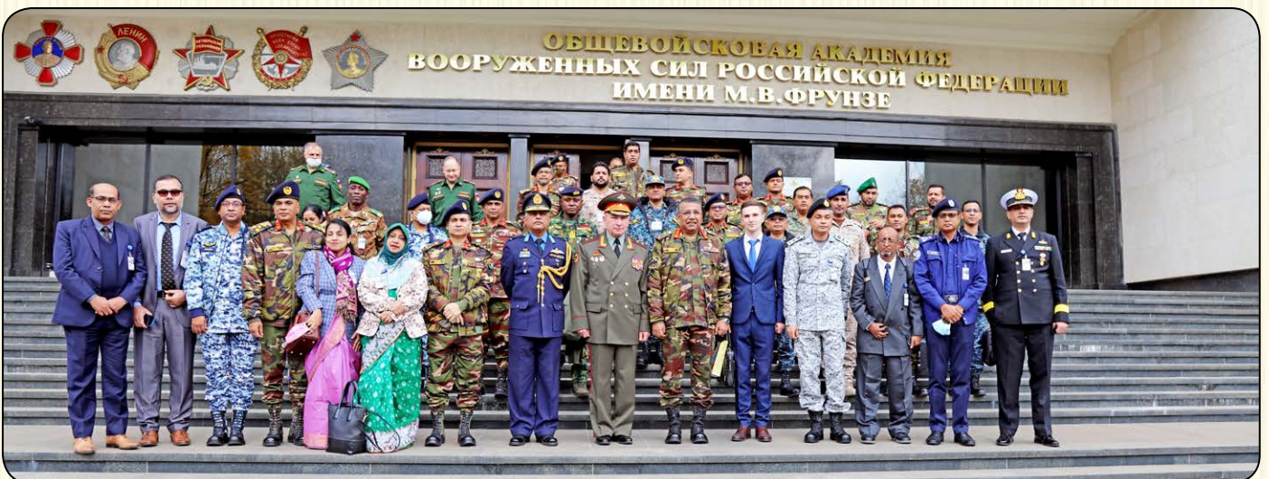
ND Course-2021 visiting delegation (Group-1) at Russia during Overseas Study Tour.