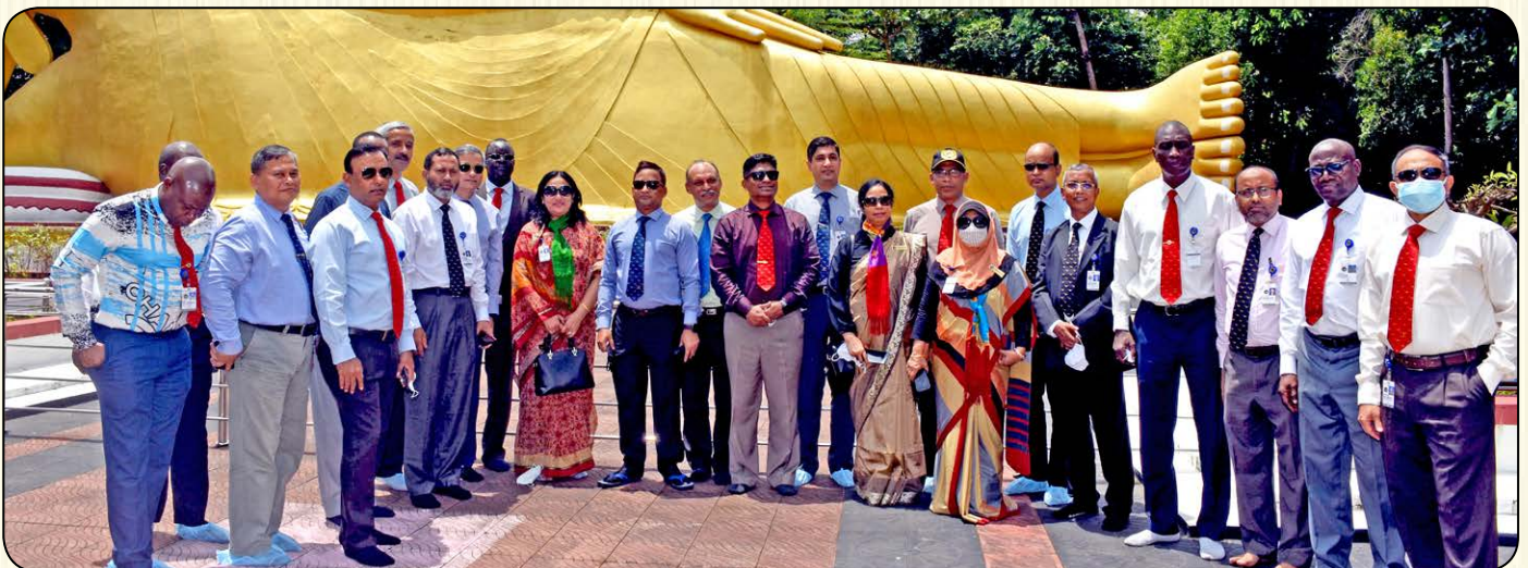
Course Members of National Defence Course 2021 visited Vubanshanti Temple at Cox's Bazar.