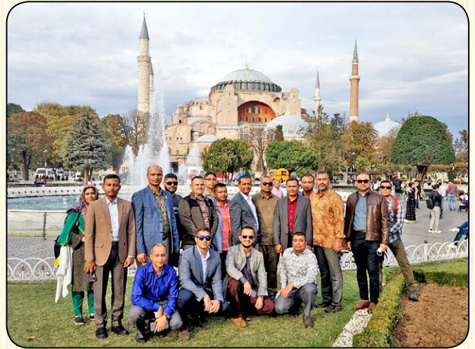
Armed Forces War Course-2021 visiting delegation (Group-2) at Turkey during Overseas Study Tour.