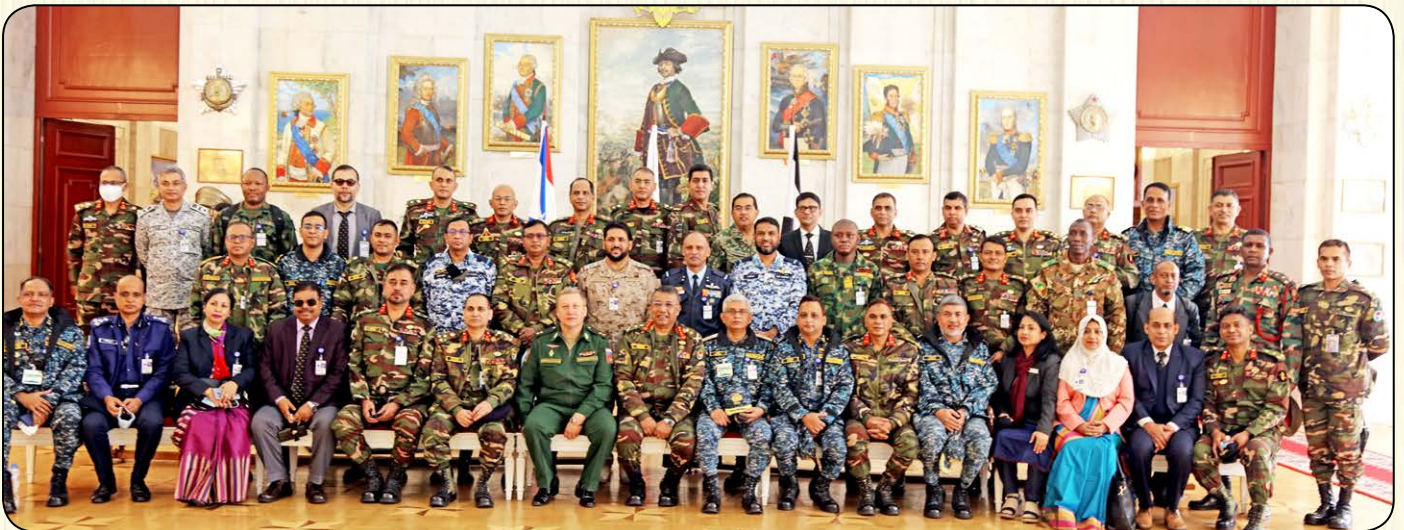
ND Course-2021 visiting delegation (Group-1) at Russia during Overseas Study Tour.