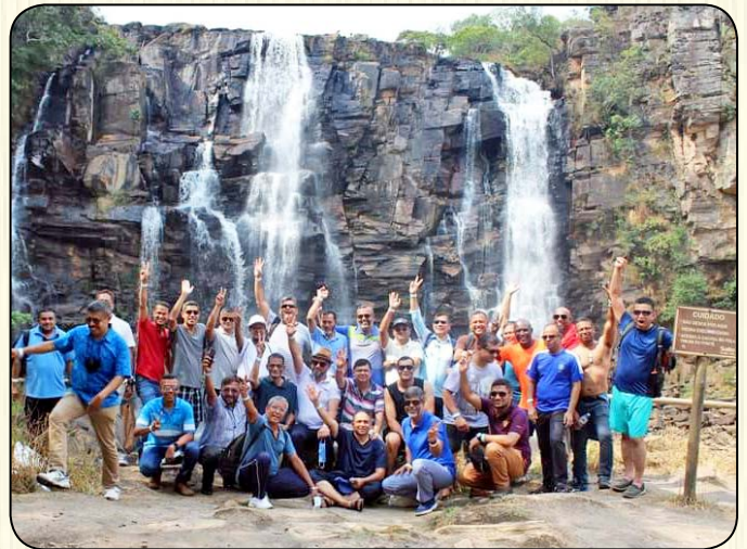
ND Course-2021 visiting delegation (Group-2) at Brazil during Overseas Study Tour.