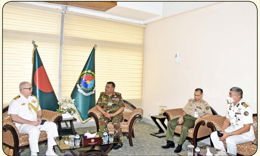
Defence Attache of Australia to Bangladesh visited NDC and called on Commandant NDC on 28 October 2021.