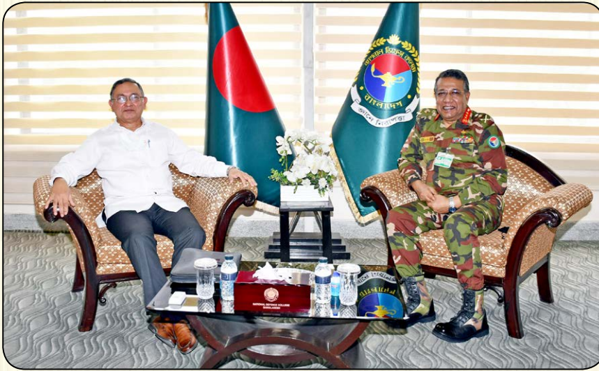
Former Chief of Army Staff, Bangladesh Army General Md Abdul Mubeen, SBP, ndc, psc (Retd) visited NDC and called on Commandant NDC on 04 August 2021.