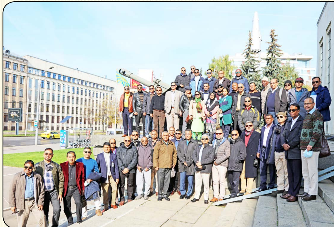
ND Course-2021 visiting delegation (Group-1) at Russia during Overseas Study Tour.

The overseas study tour include visits to neighbouring, developing and developed countries. The aim of these tours is to examine the social, political, economic and military systems of those countries. The course members meet high-ranking civil and military officials and visit government, military and industrial establishments to exchange views and opinions. The visits also promotes good relation between those countries and Bangladesh. This year Course Members of National Defence Course 2021 along with Faculty and Staff Officers visited 2 countries in two groups. Group - 1 visited Russia and Group - 2 visited Brazil.