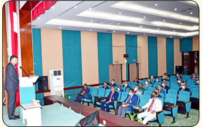
H. E. Vikram Doraiswami, High Commissioner of India delivered a lecture on “Contemporary India: Its Foreign Policy, Security and Development Strategy” to the Course Members of ND Course-2021 on 28 October 2021.