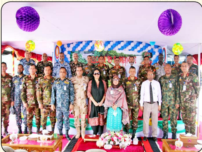
Course Members of National Defence Course 2021 visited HQ 305 Infantry Brigade at Rangamati.