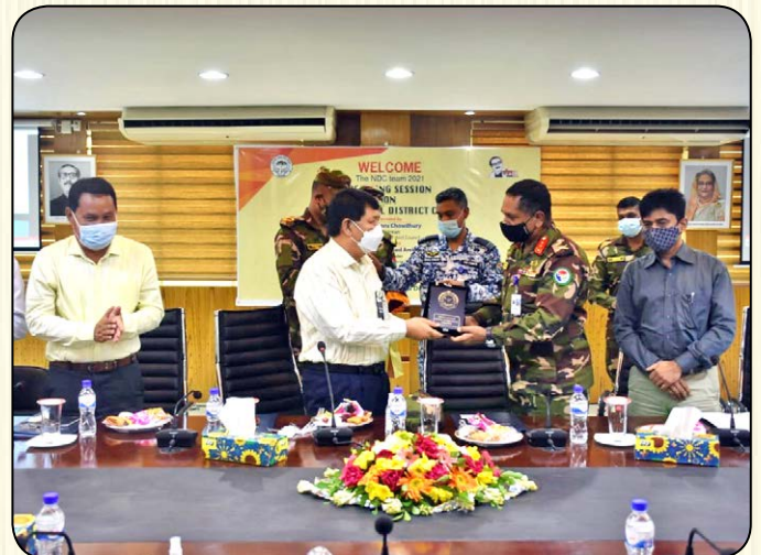
Course Members of National Defence Course 2021 visited Rangamati Hill District Council.