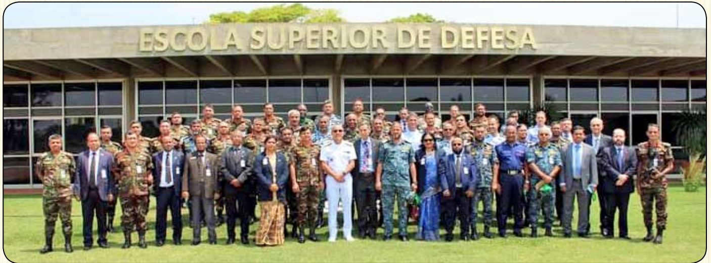
ND Course-2021 visiting delegation (Group-2) at Brazil during Overseas Study Tour.