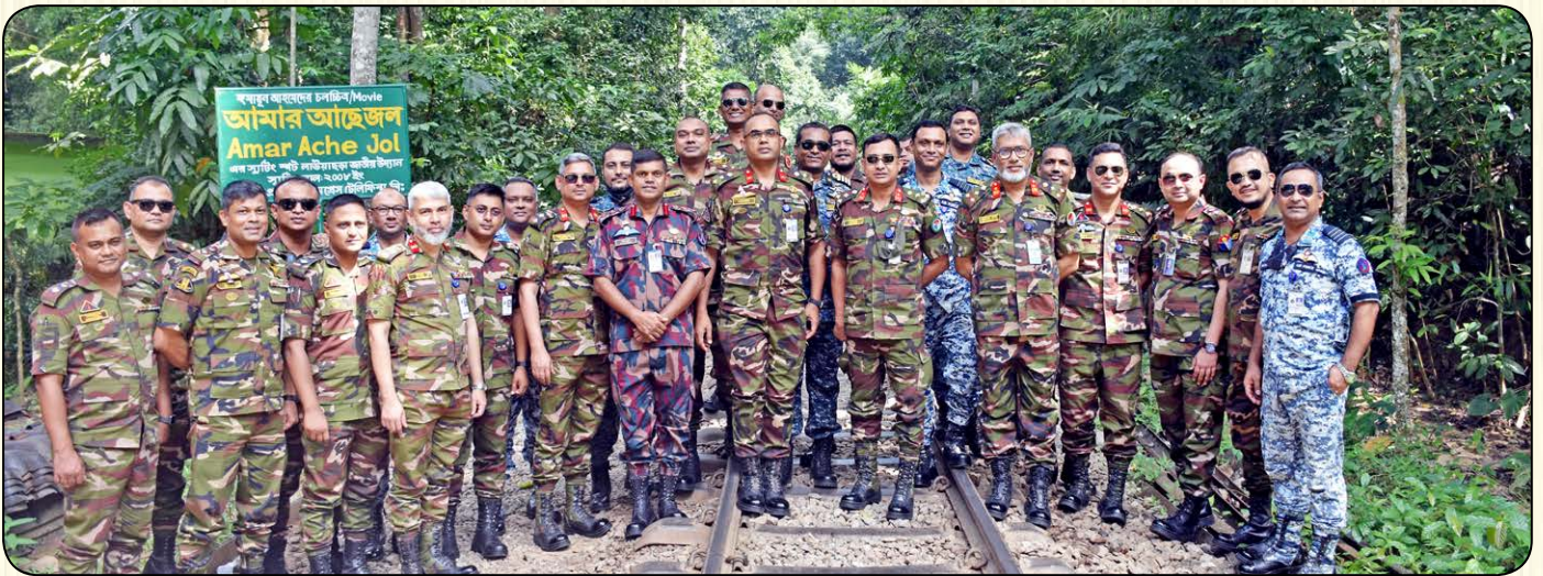
Course Members of Armed Forces War Course 2021 visited Sylhet Area.