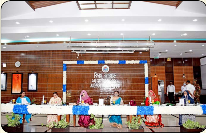
Farewell Programme organized by NDC Ladies Club on 14 October 2021.