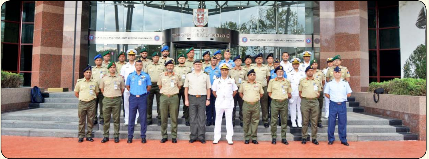
Armed Forces War Course-2021 visiting delegation (Group-2) at Turkey during Overseas Study Tour.