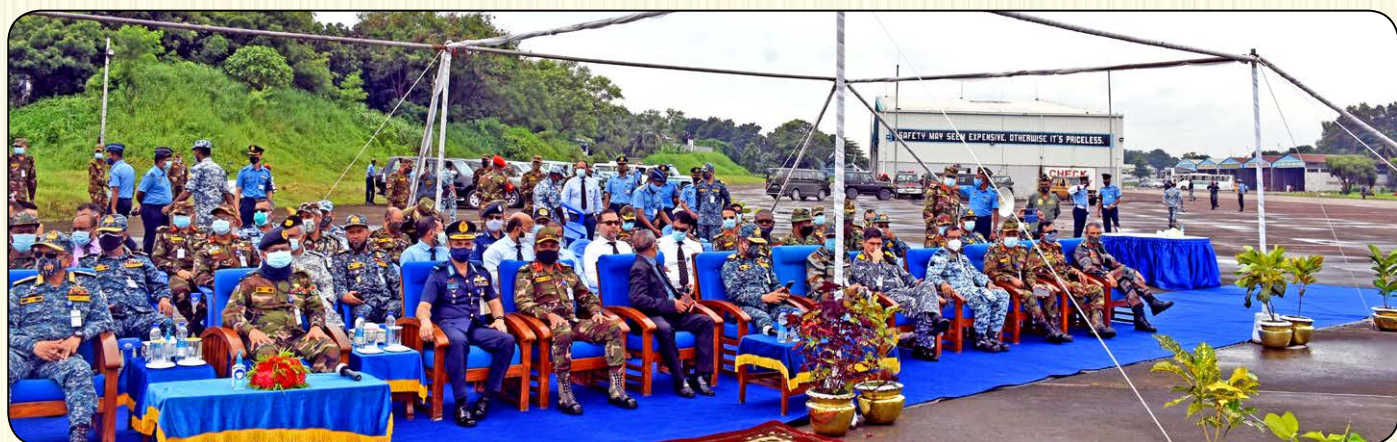
Course Members of National Defence Course 2021 visited BAF Base Zahurul Haque at Chattogram.