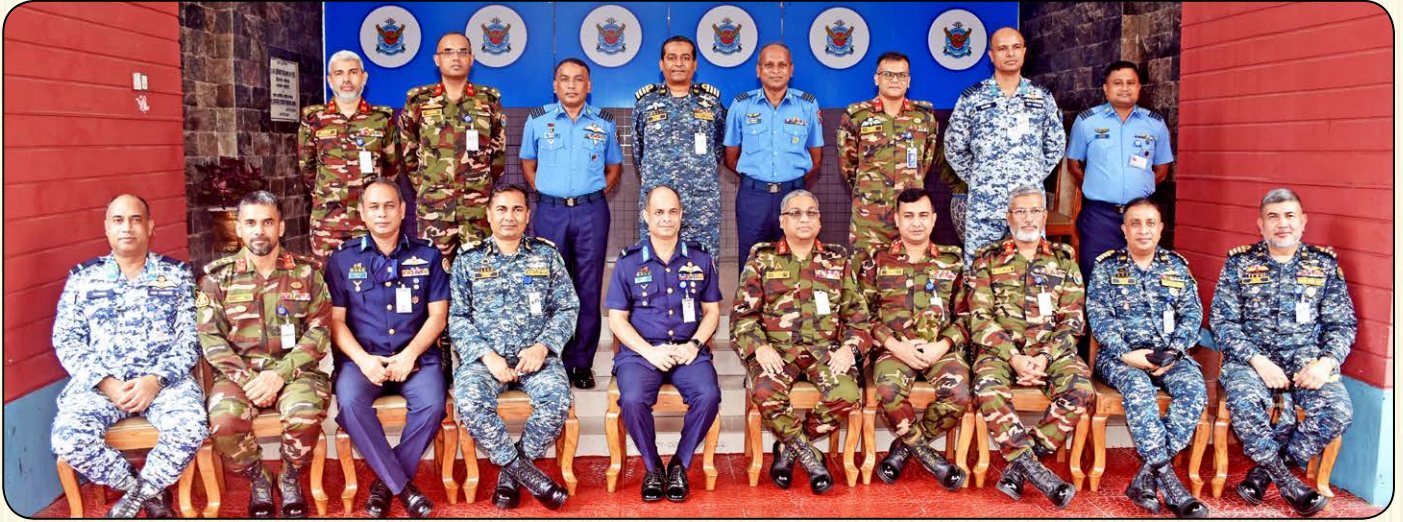
Course Members of Armed Forces War Course 2021 visited BAF Base Zahurul Haque at Chattogram.

As part of course curricula Course Members of AFWC 2021, Faculty Members & Staff Officers visited various Armed Forces installations during the study tour. The visit included Cumilla, Sylhet, Chattogram and Cox's Bazar Area.