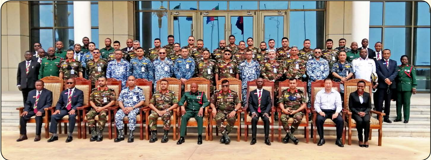
Armed Forces War Course-2021 visiting delegation (Group-1) at Tanzania during Overseas Study Tour.