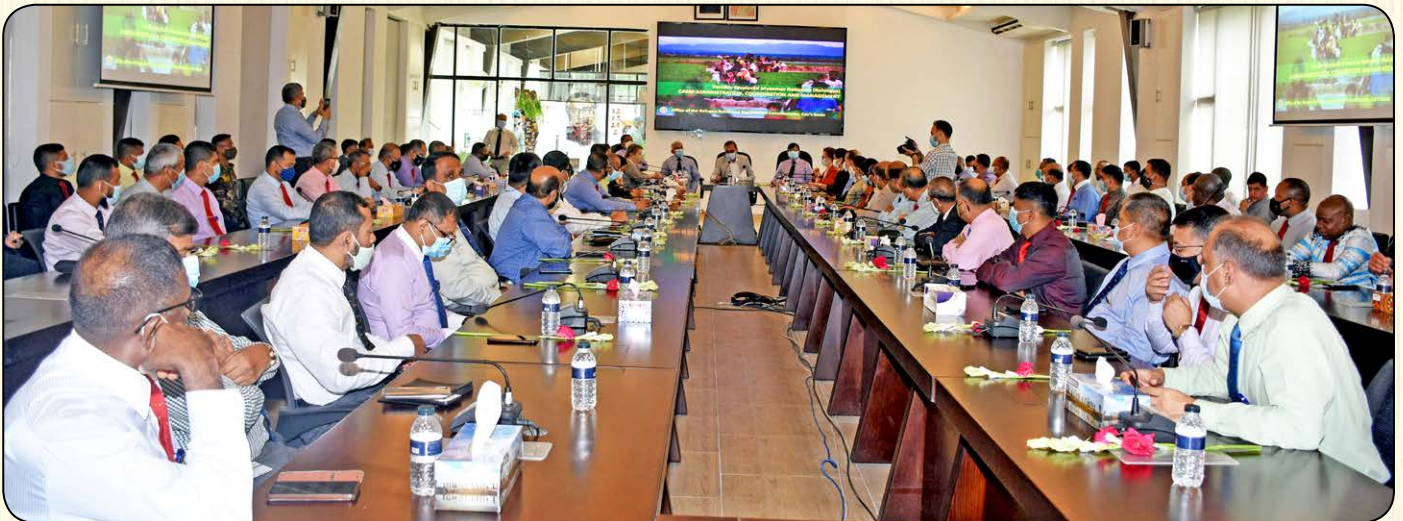
Course Members of National Defence Course 2021 visited RRRRC Office at Cox's Bazar.