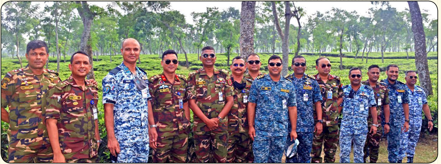
Course Members of Armed Forces War Course 2021 visited Sylhet Area.