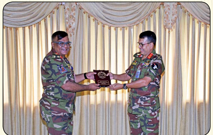
Course Members of Armed Forces War Course 2021 visited HQ 33 Infantry Division at Cumilla Cantonment.