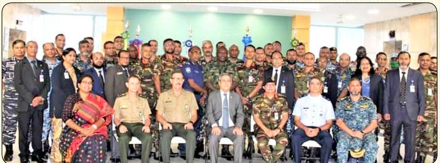
ND Course-2021 visiting delegation (Group-2) at Brazil during Overseas Study Tour.