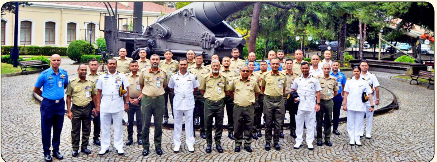
Armed Forces War Course-2021 visiting delegation (Group-2) at Turkey during Overseas Study Tour.