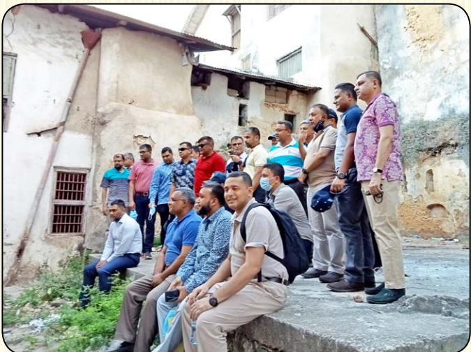
Armed Forces War Course-2021 visiting delegation (Group-1) at Tanzania during Overseas Study Tour.