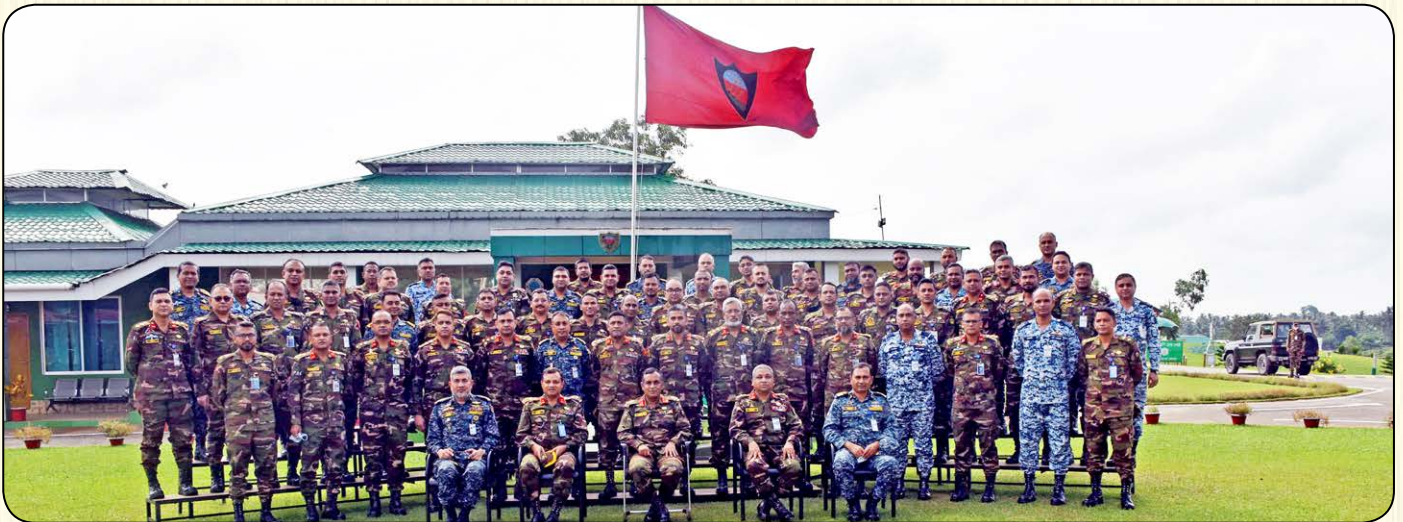
Course Members of Armed Forces War Course 2021 visited HQ 10 Infantry Division at Ramu Cantonment.