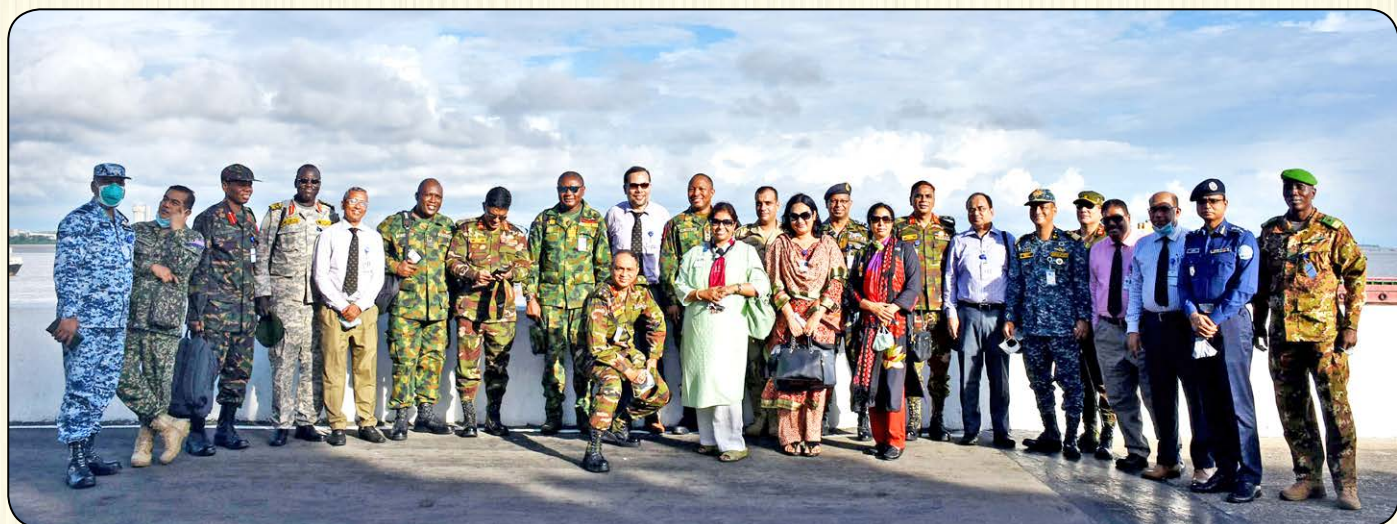
Course Members of National Defence Course 2021 visited BNA West Point at Patenga.