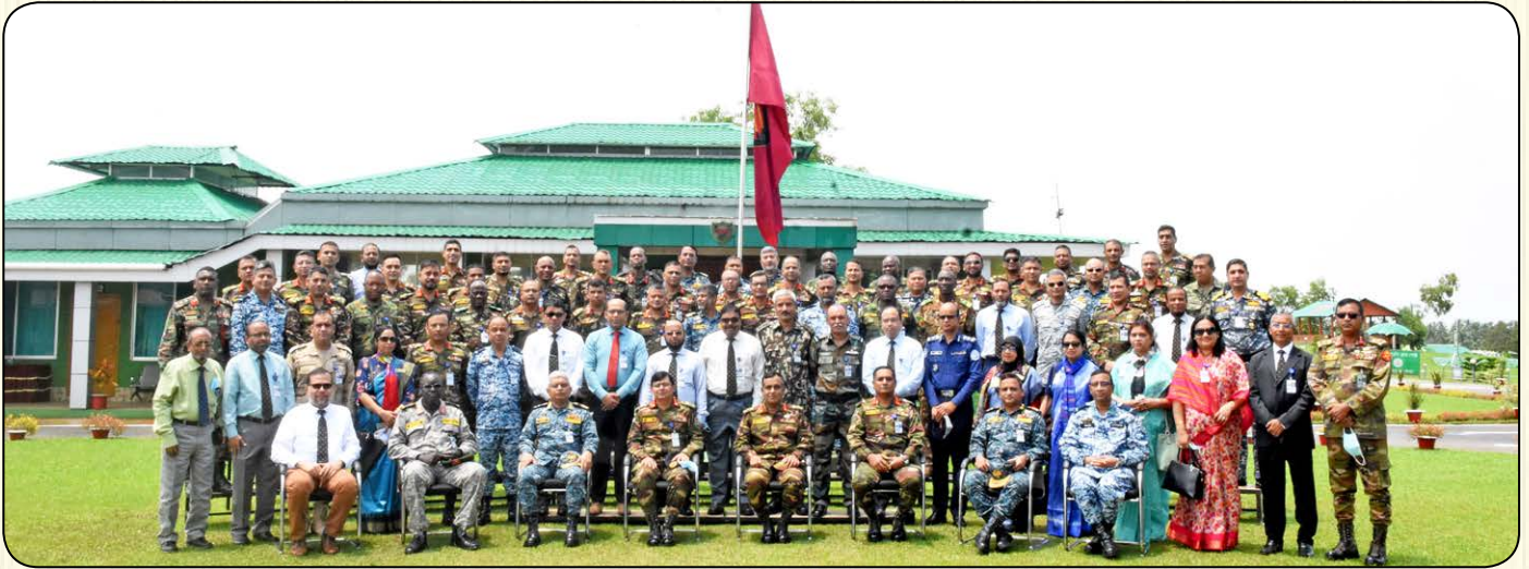
Course Members of National Defence Course 2021 visited HQ 10 Infantry Division at Ramu Cantonment.