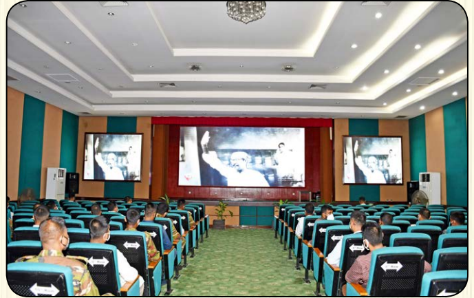
National Mourning Day observed at NDC on 15 August 2021.