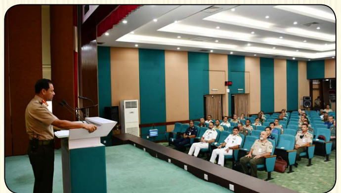
General S M Shafiuddin Ahmed, SBP, OSP, ndu, psc, PhD, Chief of Army Staff, Bangladesh Army delivered "Keynote Speech on Bangladesh Army" to the Course Members of ND Course-2022 on 26 September 2022.