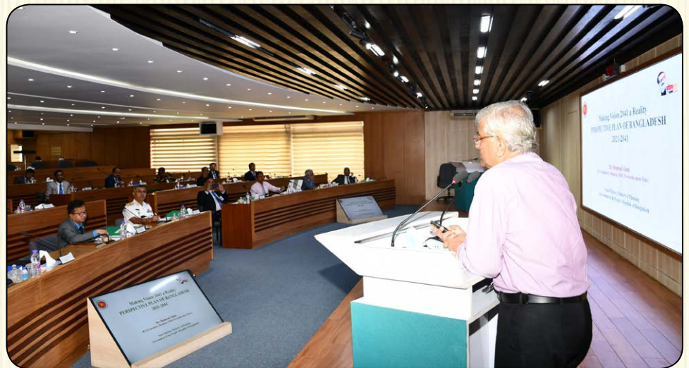
Dr. Shamsul Alam , Hon'ble State Minister, Ministry of Planning delivering a lecture on “Vision 2041 and Bangladesh Delta Plan 2100” to the Fellows of Capstone Course 2022-2 on 07 September 2022.