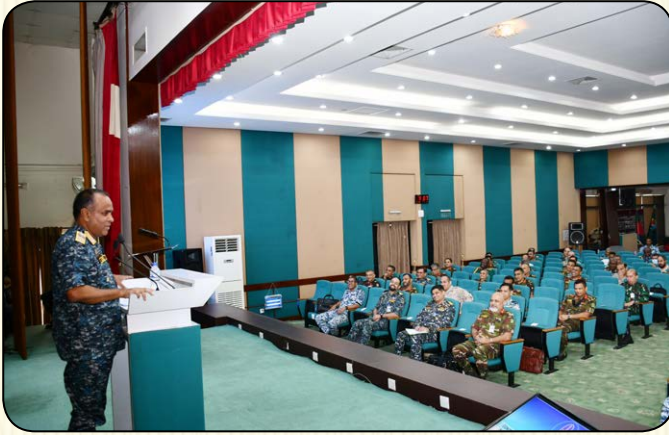
Admiral M Shaheen Iqbal , NBP, NUP, ndc, afwc, psc, Chief of Naval Staff, Bangladesh Navy delivered a lecture on “Contemporary Maritime Security Imperatives in the Indian Ocean Region (IOR): Bangladesh Perspective” to the Course Members of ND Course-2022 on 29 September 2022.