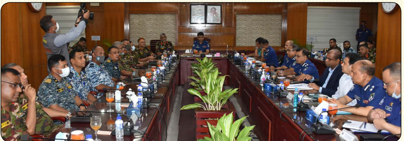
Visit to Police Headquarters on 06 September 2022.