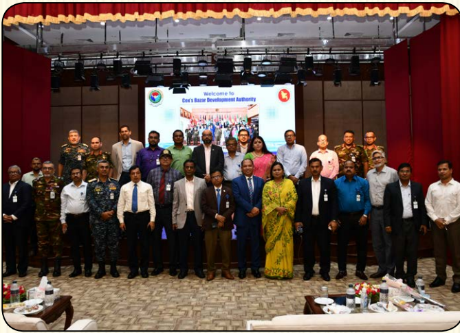
Cox's Bazar Development Authority