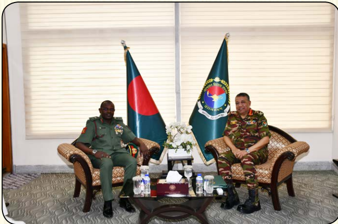
A Delegation from Nigerian Army visited NDC and called on Commandant NDC on 03 August 2022.