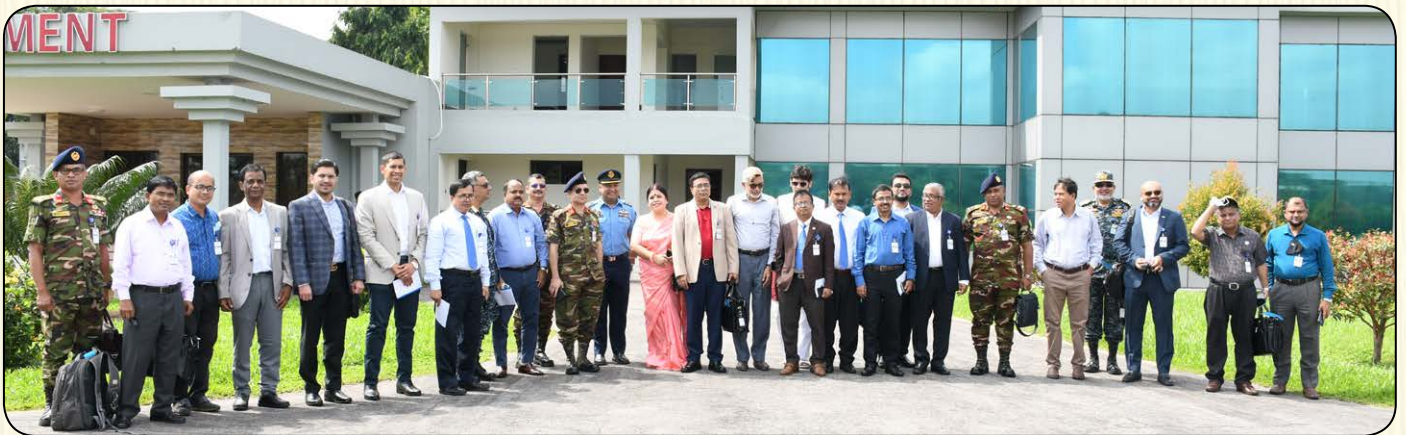
BAF Base Bangabandhu