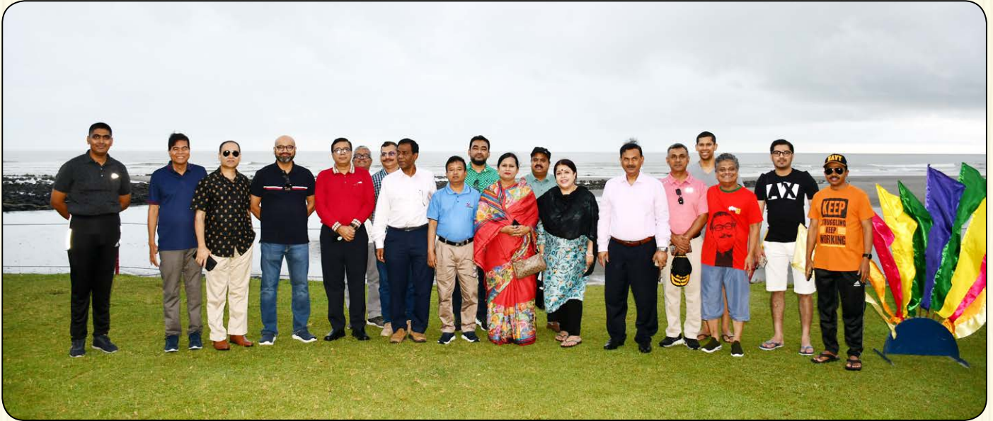
Cox's Bazar Sea Beach