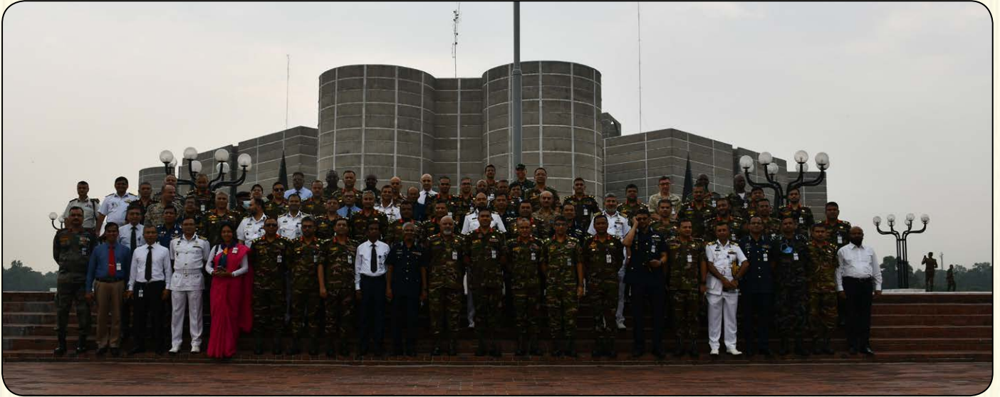
Visit to National Parliament on 02 August 2022.