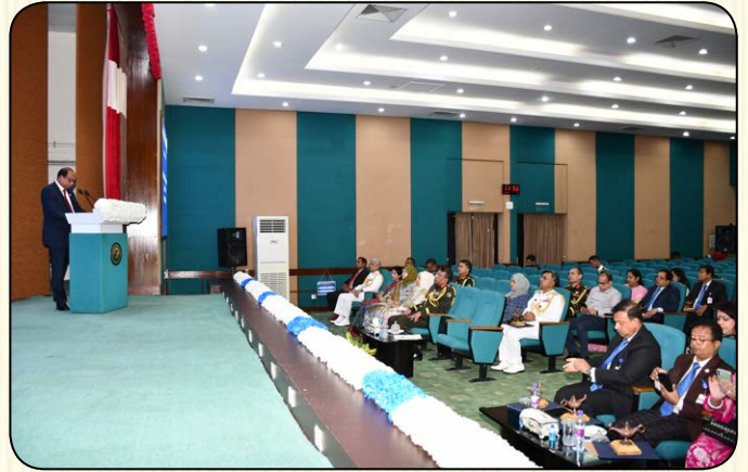
Md. Nurul Islam Sujon, MP, Hon'ble Minister, Ministry of Railways, awarded certificates among the Capstone Fellows on 21 September 2022 as Chief Guest.