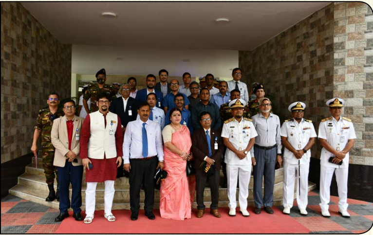
Chattogram Naval Area