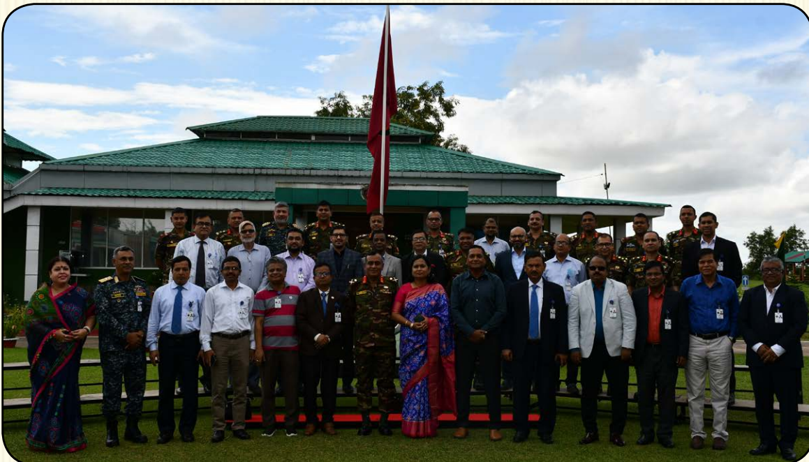
Headquarters 10 Infantry Division