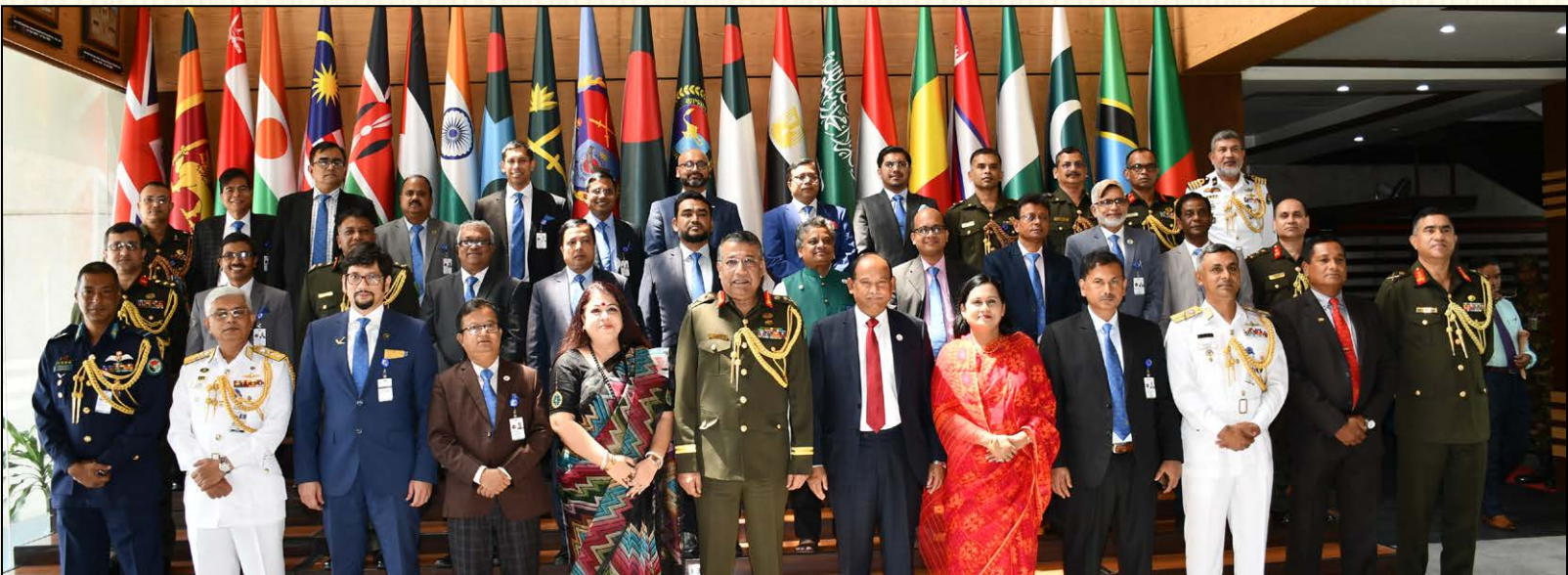
The Chief Guest along with Commandant NDC, Faculty Members and Fellows of Capstone Course 2022-2 during the closing ceremony of Capstone Course 2022-2.