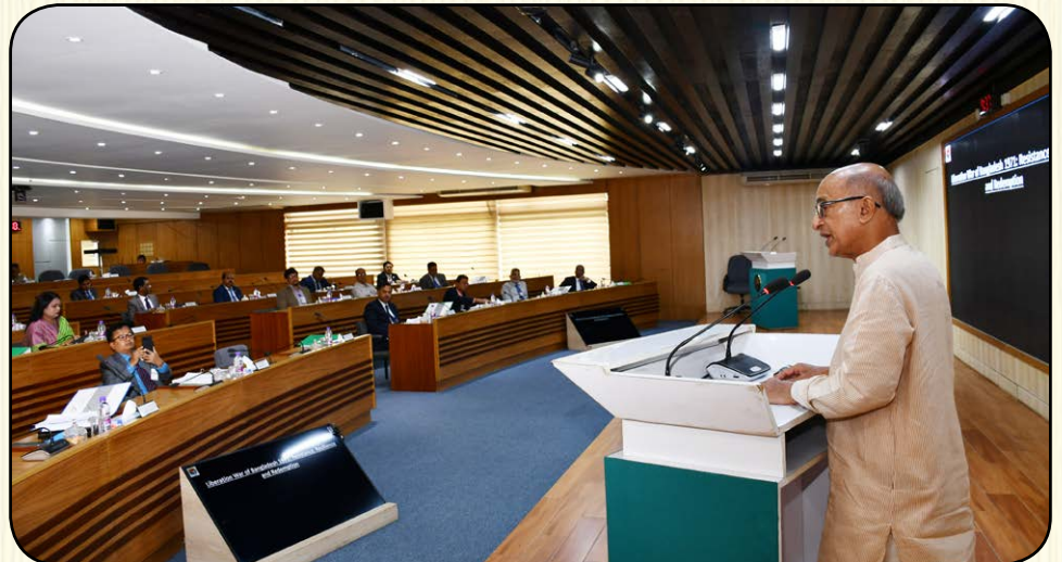
Dr. Tawfiq e Elahi Chowdhury , BB, Energy Advisor to Hon’ble Prime Minister delivering a lecture on “ Liberation War of Bangladesh 1971: Resistance, Resilience and Redemption ” to the Fellows of Capstone Course 2022-2 on 05 September 2022.