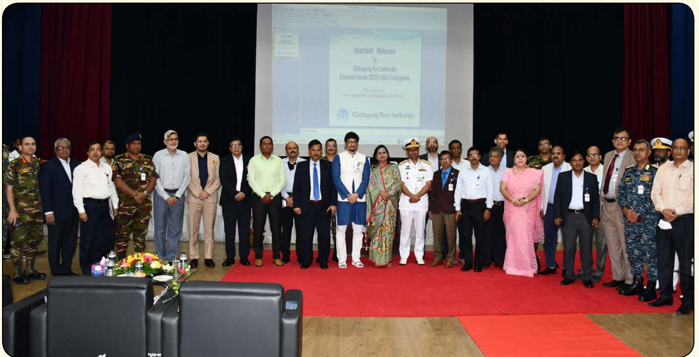
Chittagong Port Authority