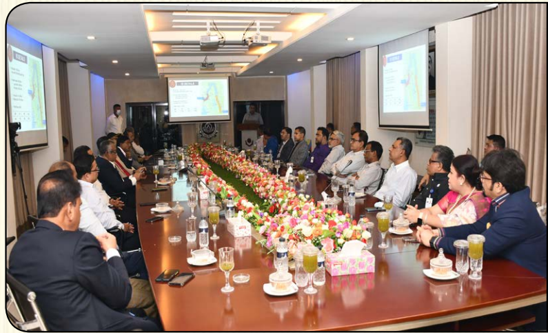
HQ BGB South East Region