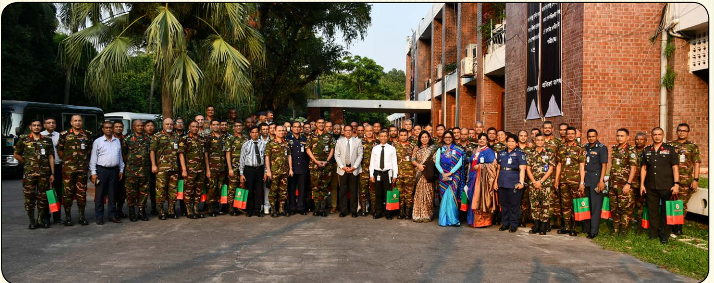
Visit to Ministry of Defence on 17 August 2022.