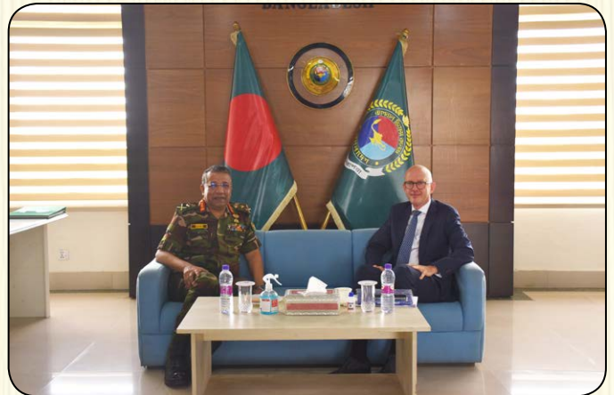
H.E. Charles Whiteley, Ambassador of European Union in Bangladesh visited NDC and called on Commandant NDC on 11 September 2022.