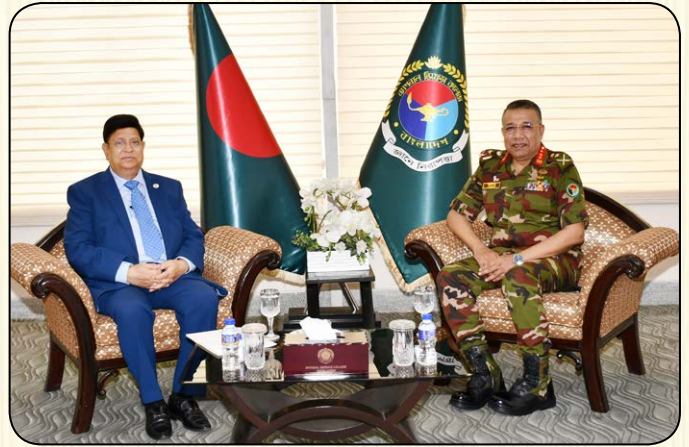
Dr. A K Abdul Momen, MP, Hon'ble Minister, Ministry of Foreign Affairs visited NDC and called on Commandant NDC on 13 July 2022.