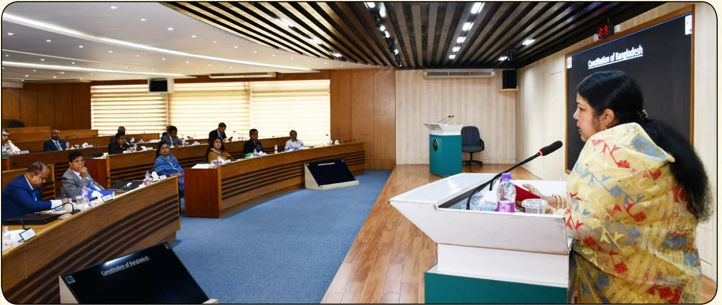
Dr. Shirin Sharmin Chaudhury, MP, Hon'ble Speaker of Bangladesh National Parliament delivering a lecture on “ Constitution of Bangladesh ” to the Fellows of Capstone Course 2022-2 on 18 September 2022.