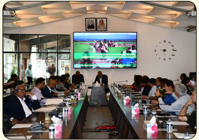
Office of the Refugee Relief and Repatriation Commissioner (RRRC)