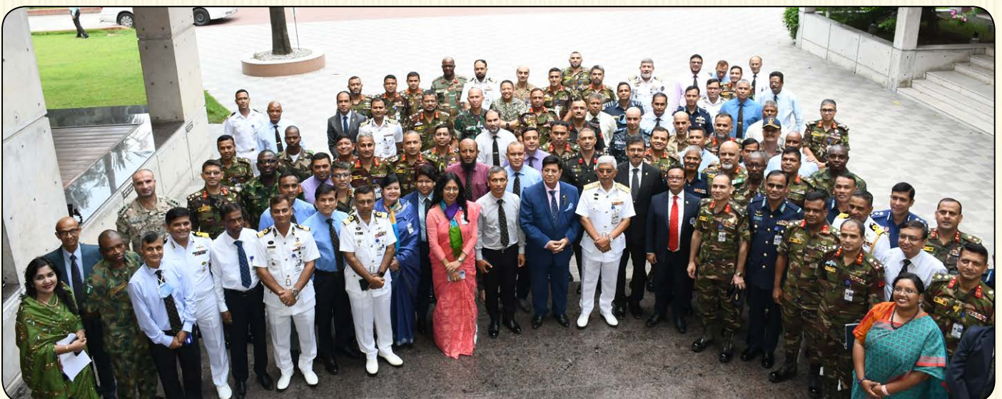
Visit to Ministry of Foreign Affairs on 30 August 2022.