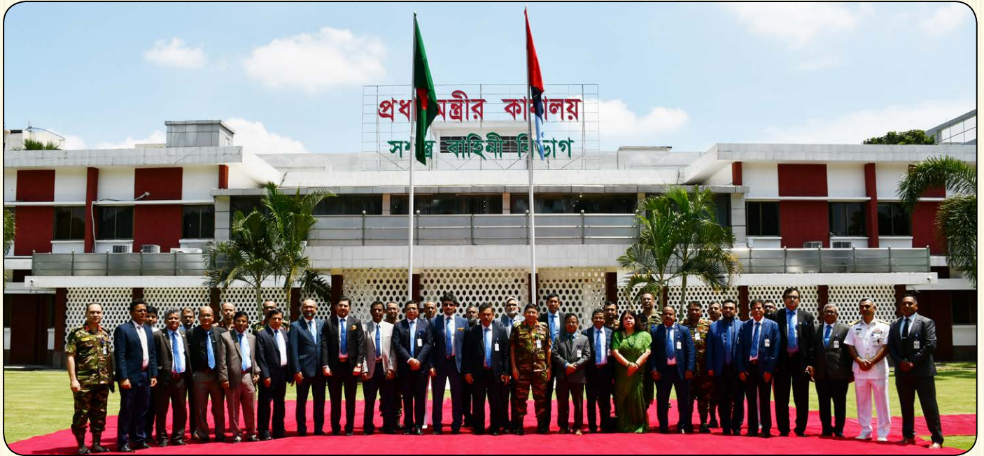
Armed Forces Division

As part of course curricula, Fellows of Capstone Course 2022-2, Faculty Members and Staff Officers of NDC visited various Armed Forces installations during the course. The visit included Armed Forces Division, BAF Base Bangabandhu, Chattogram Naval Area, HQ BGB South East Region, Chittagong Port Authority, HQ 24 Infantry Division, Korean EPZ, Cox's Bazar Development Authority, Cox's Bazar District Administration, Office of the Refugee Relief and Repatriation Commissioner (RRRC) and HQ 10 Infantry Division.