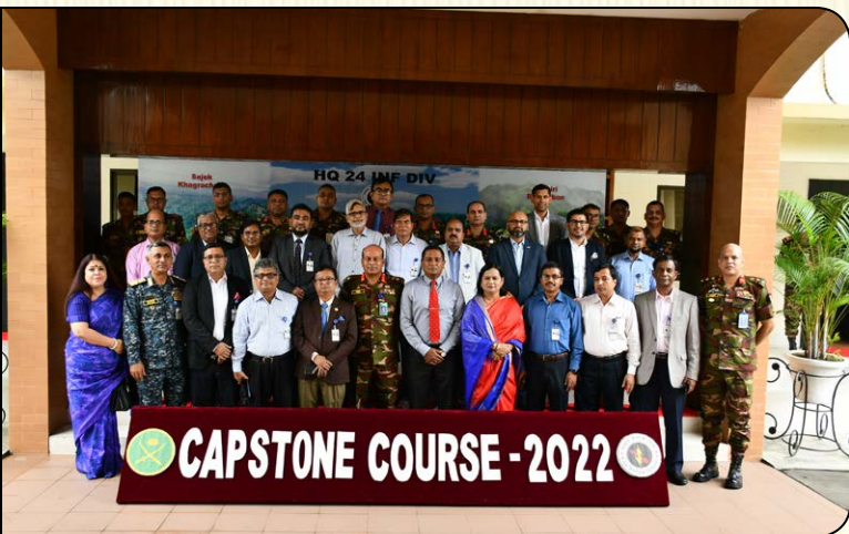
Headquarters 24 Infantry Division