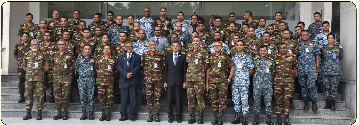
Visit to Ministry of Foreign Affairs on 06 September 2022.