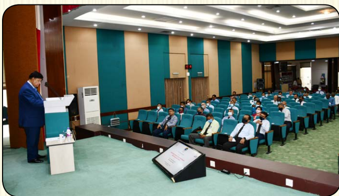
Dr. A K Abdul Momen, MP, Hon'ble Minister, Ministry of Foreign Affairs delivered a lecture on "Bangladesh Foreign Policy: Constraints, Compulsions and Choices" to the Course Members of ND Course-2022 on 13 July 2022.